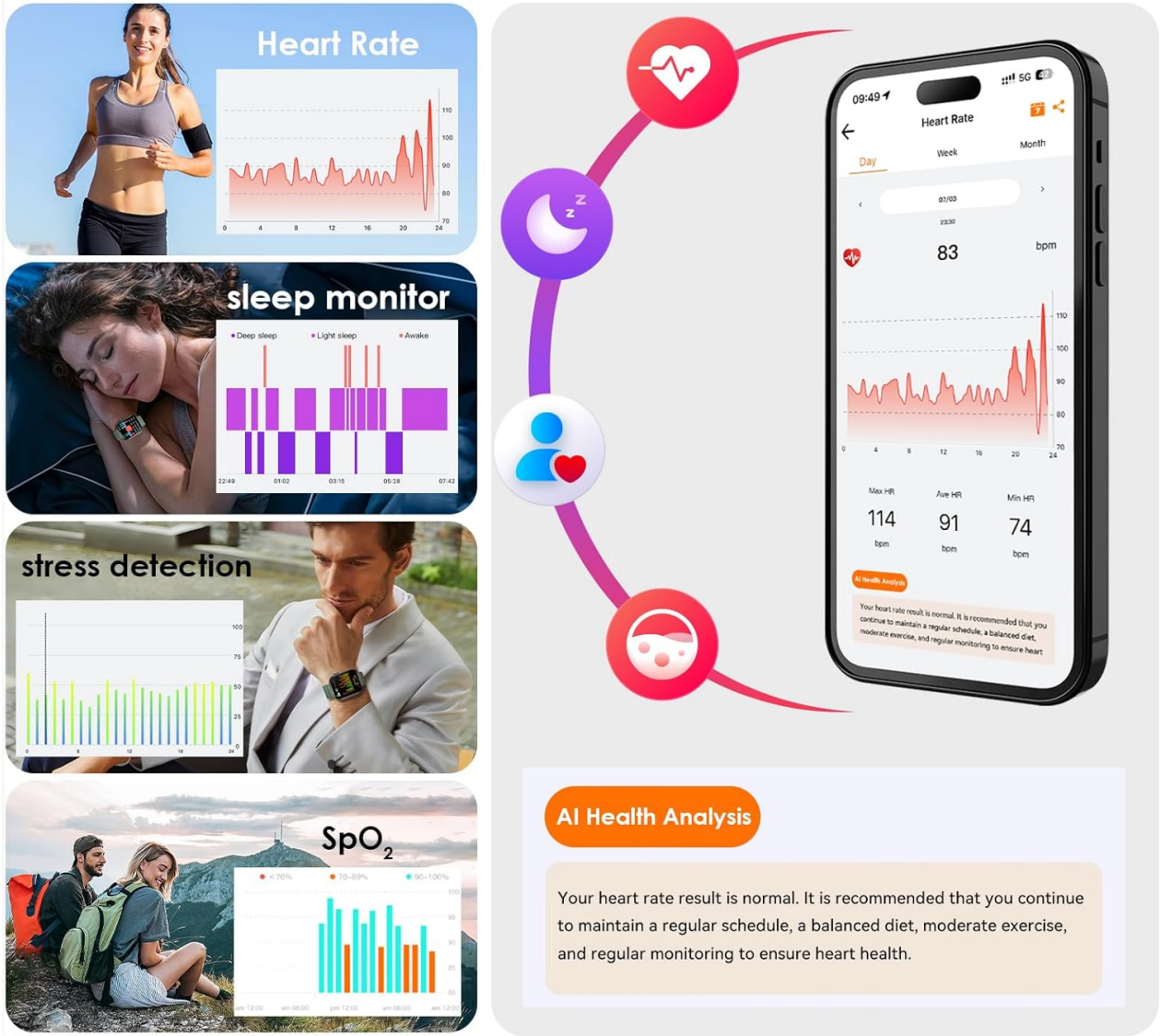
Image: The AURAFIT AI Smart Watch F39C shows various health tracking screens, including heart rate graphs, sleep patterns, stress detection, and SpO2 levels. An accompanying phone screen displays an AI health analysis report.