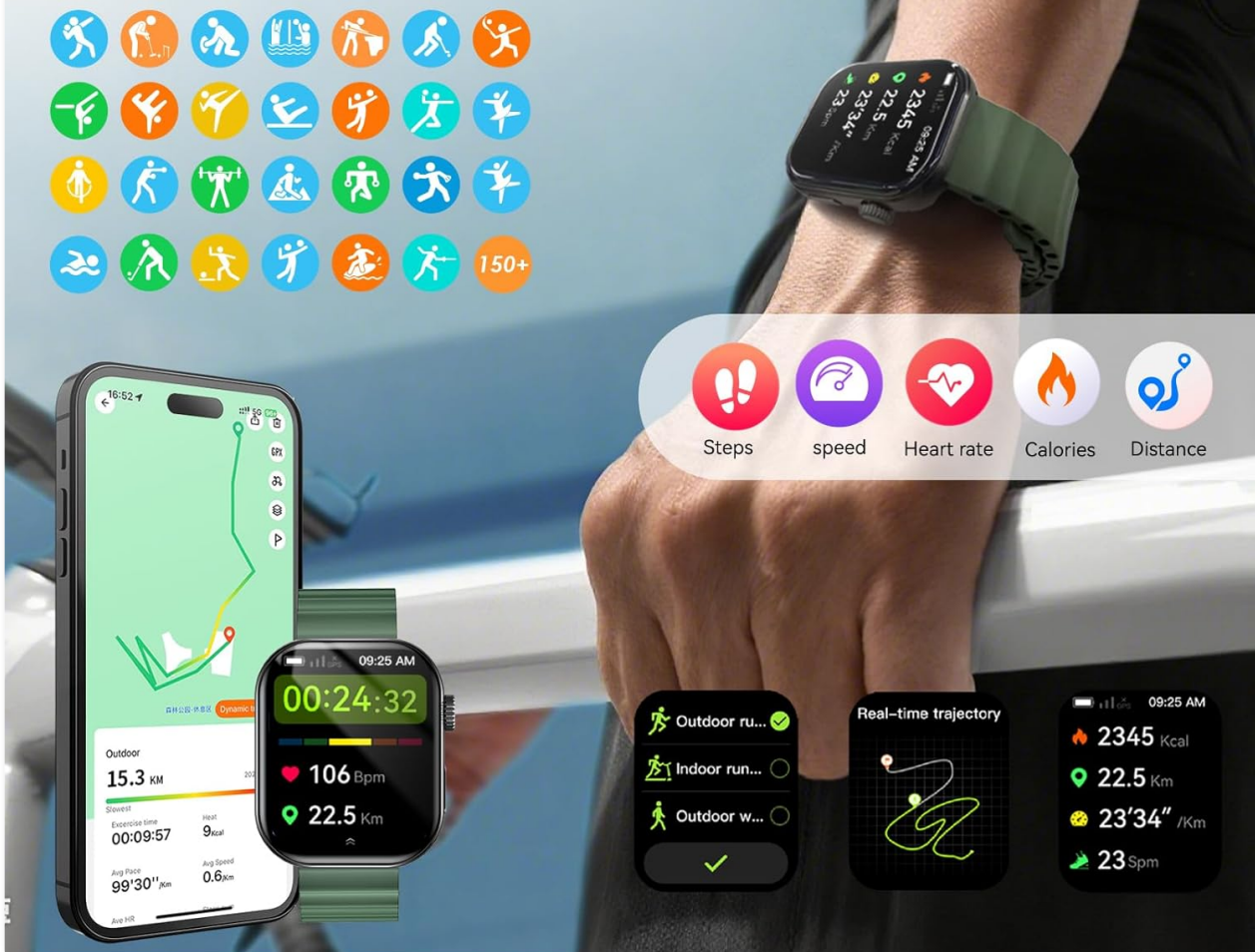
Image: The AURAFIT AI Smart Watch F39C shows a grid of icons representing over 100 sports modes. The watch screen displays real-time activity data like steps, speed, heart rate, calories, and distance, with a phone showing GPS tracking.