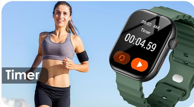
Image: The AURAFIT AI Smart Watch F39C shows multiple screens demonstrating its diverse functions, including an alarm clock, remote camera control, music playback, weather forecast, and a timer.