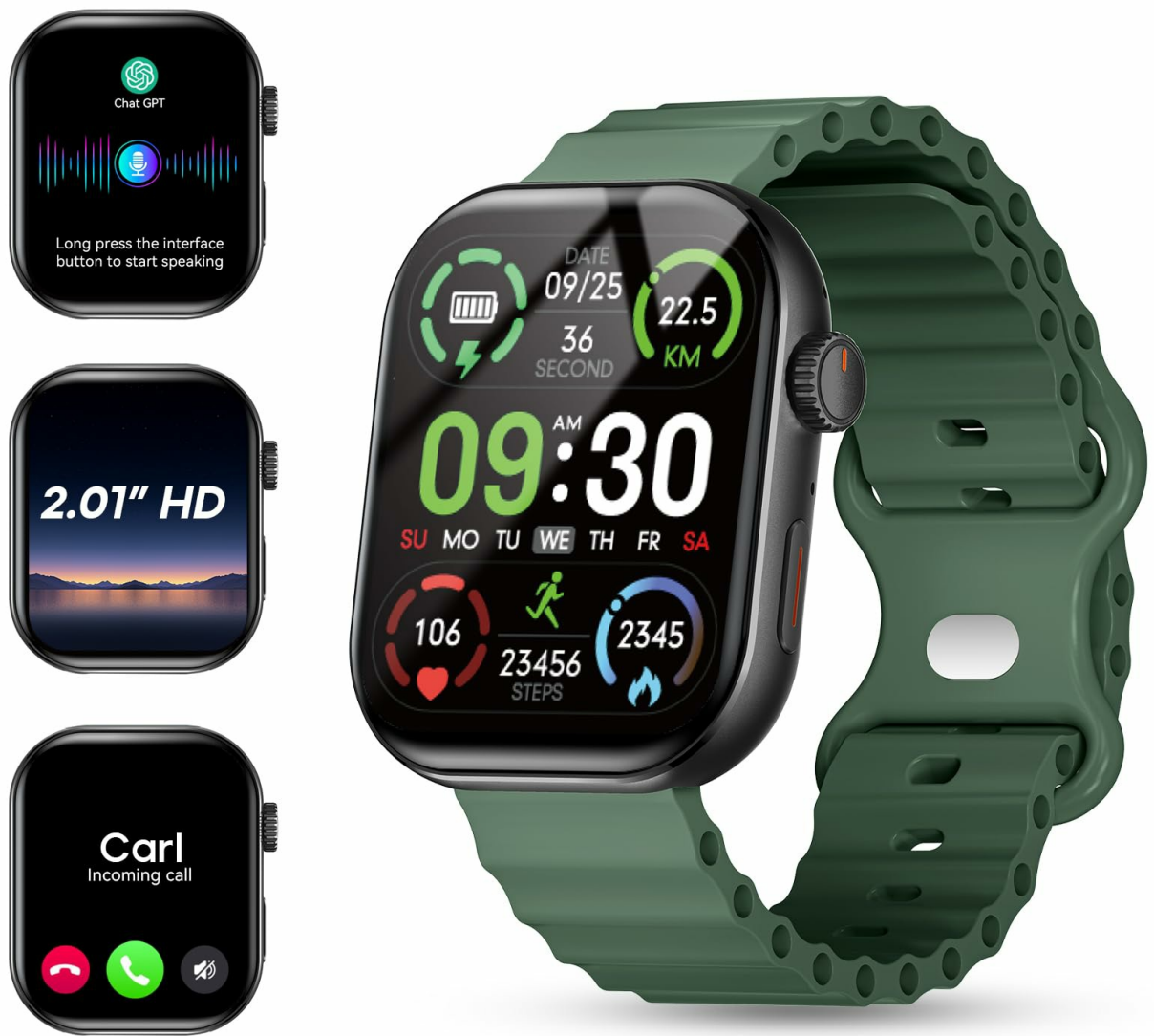
Image: The AURAFIT AI Smart Watch F39C screen shows an AI assistant conversation, a list of smart notifications from various apps, and options for answering or making calls, including call history and a dialpad.