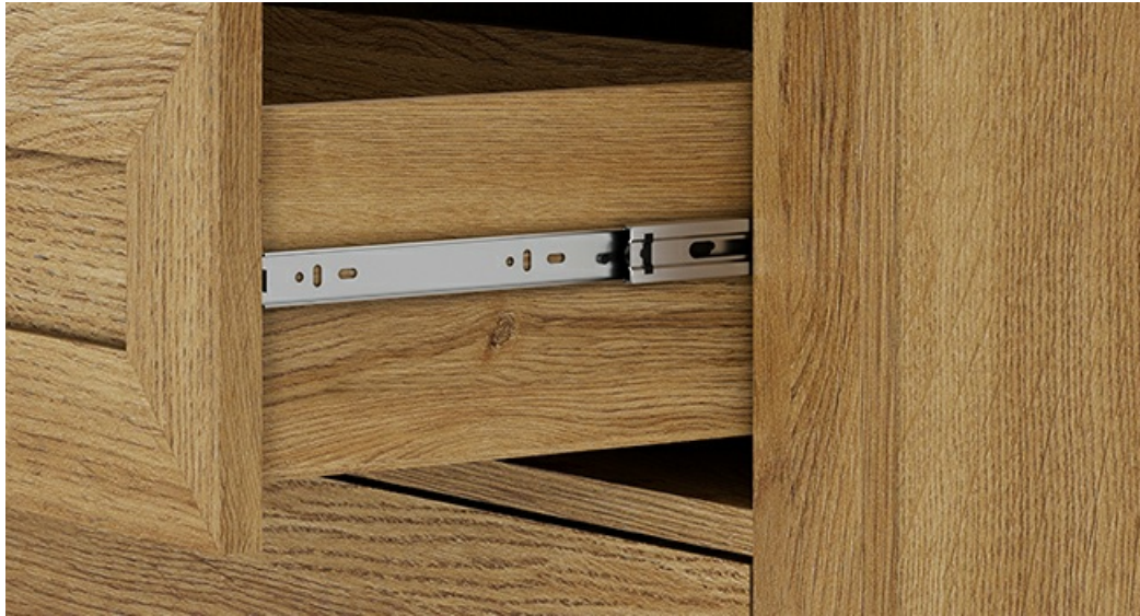
Image: A detailed view of the pre-assembled drawer glide mechanism, showcasing the smooth metal tracks that ensure easy drawer movement.

The drawers are designed for smooth and effortless operation, gliding on sturdy metal tracks. To open, gently pull the metal handle. To close, push the drawer back until it is fully seated. Avoid forcing drawers if resistance is met; check for obstructions.