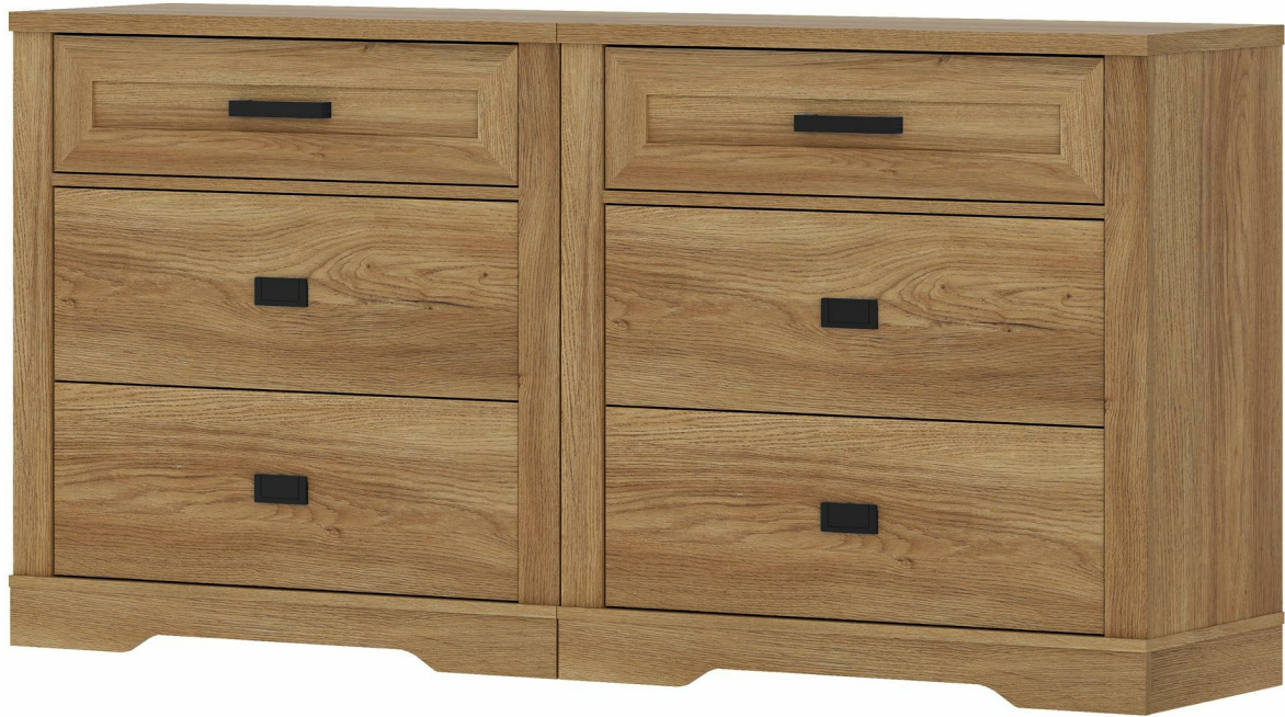
Image: The WAMPAT 2-in-1 Rustic Wood Dresser Set, 63-inch Vintage Oak, displayed in a living room setting with a television mounted above it.