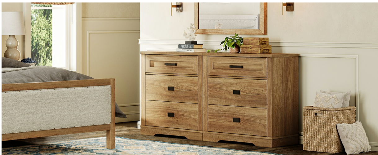
Image: Two WAMPAT dresser units are shown combined, illustrating the 'double dresser' configuration suitable for a bedroom.

This 2-in-1 dresser set offers adaptable layouts. You can place the two units together to form a long, 63-inch console, suitable for use as a TV stand or a wide storage dresser. Alternatively, the units can be separated and used individually as two 31.5-inch storage chests or oversized nightstands, providing flexibility to suit your space and needs.