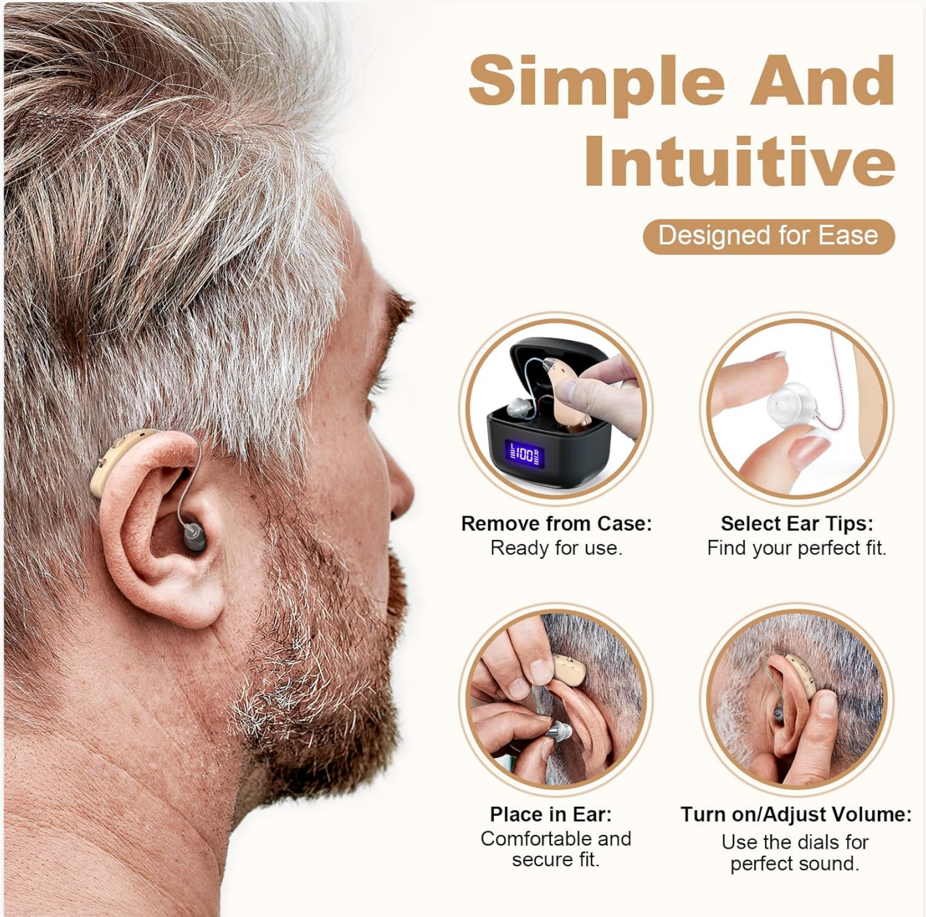
Image: A visual guide demonstrating the simple and intuitive steps for using the hearing aids, from removing them from the case to adjusting the volume.