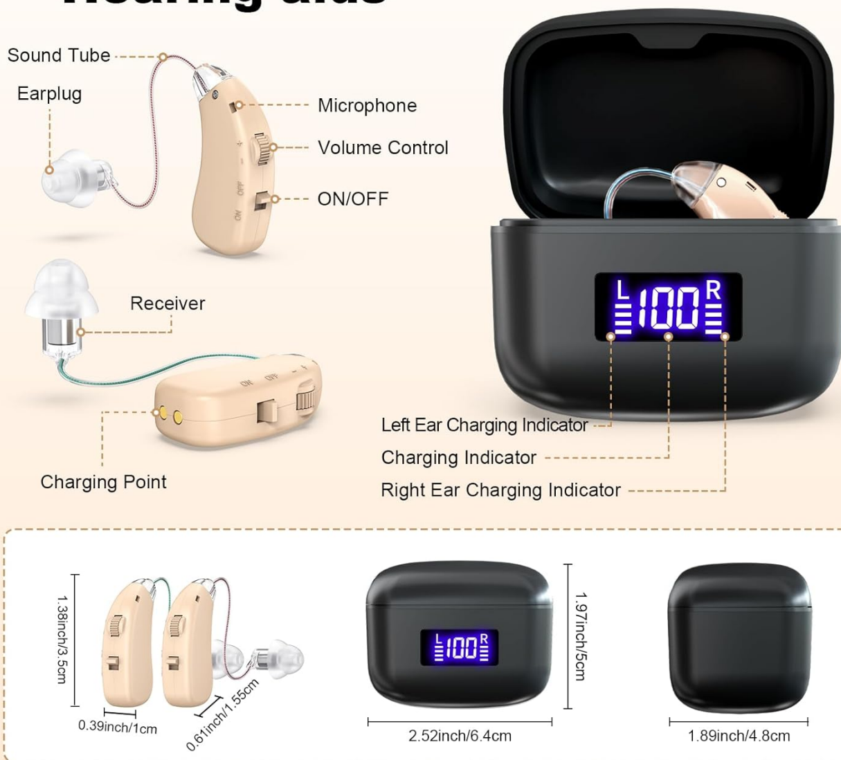
Image: Detailed diagram illustrating the sound tube, earplug, microphone, volume control, ON/OFF switch on the hearing aid, and the charging indicators (Left, Right, and overall) on the charging case.