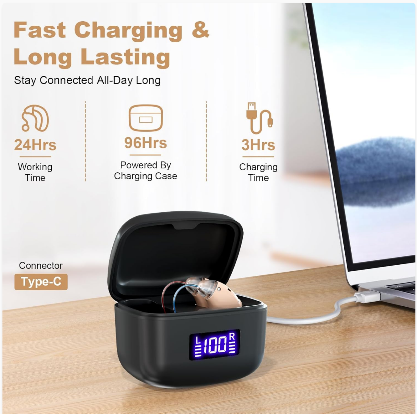
Image: The charging case connected to a power source, highlighting its fast charging capabilities and extended battery life.