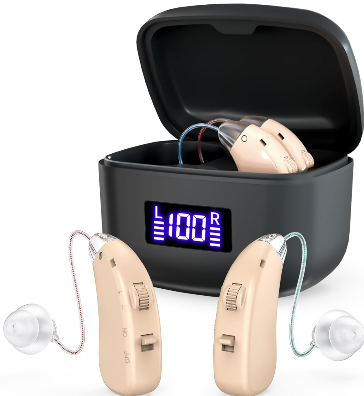
Image: The OMAGISM ZF-M909 hearing aids with their portable charging case.