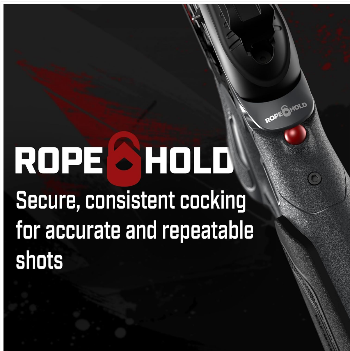
Figure 4: Rope-Hold Technology for consistent cocking.