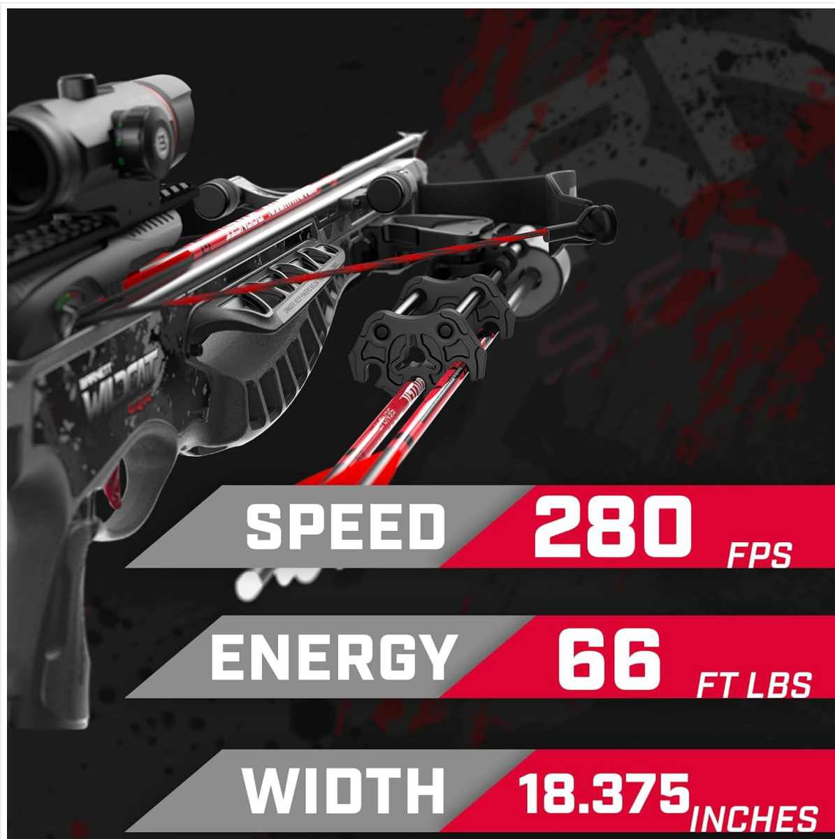
Figure 3: Assembled Wildcat CRX Crossbow.