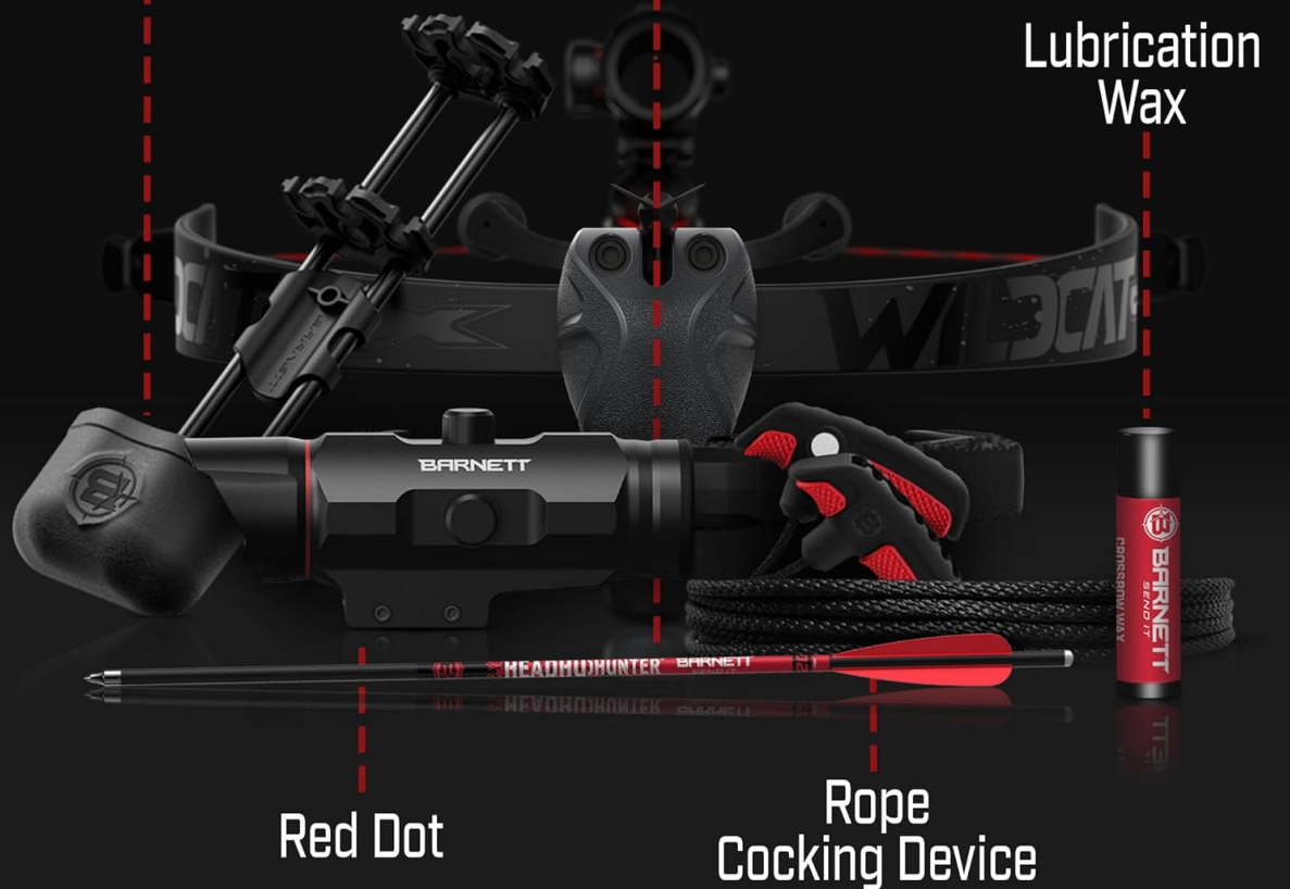
Figure 2: Included Accessories with the Wildcat CRX Bundle.