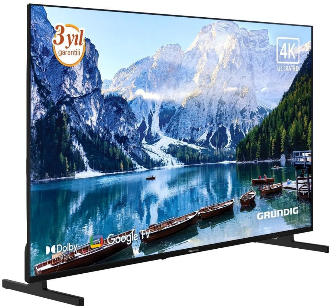
Image 2: Angled front view of the Grundig 50 GKU 700 TV, showcasing its slim design and the attached stand. The screen displays a vibrant image, highlighting the 4K Ultra HD capability.