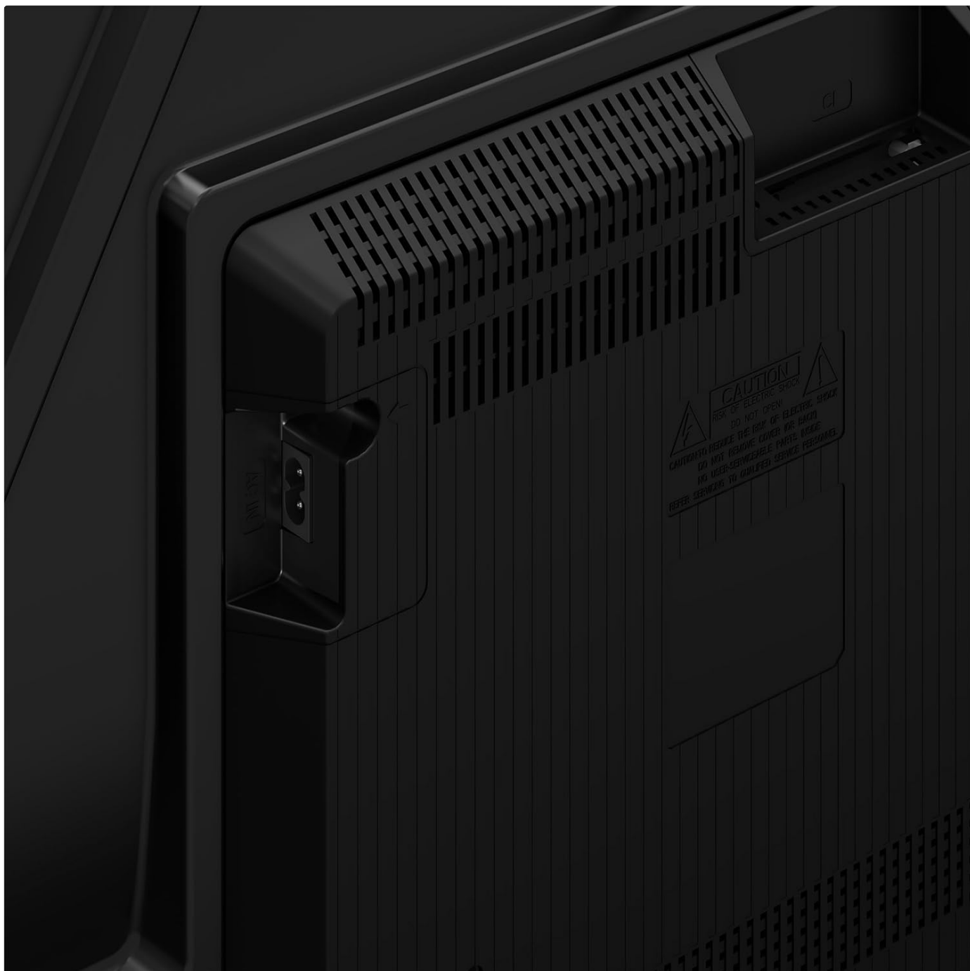
Image 3: Close-up view of the power input port located on the back of the Grundig TV, labeled "AC IN". A caution label regarding electric shock is visible nearby.