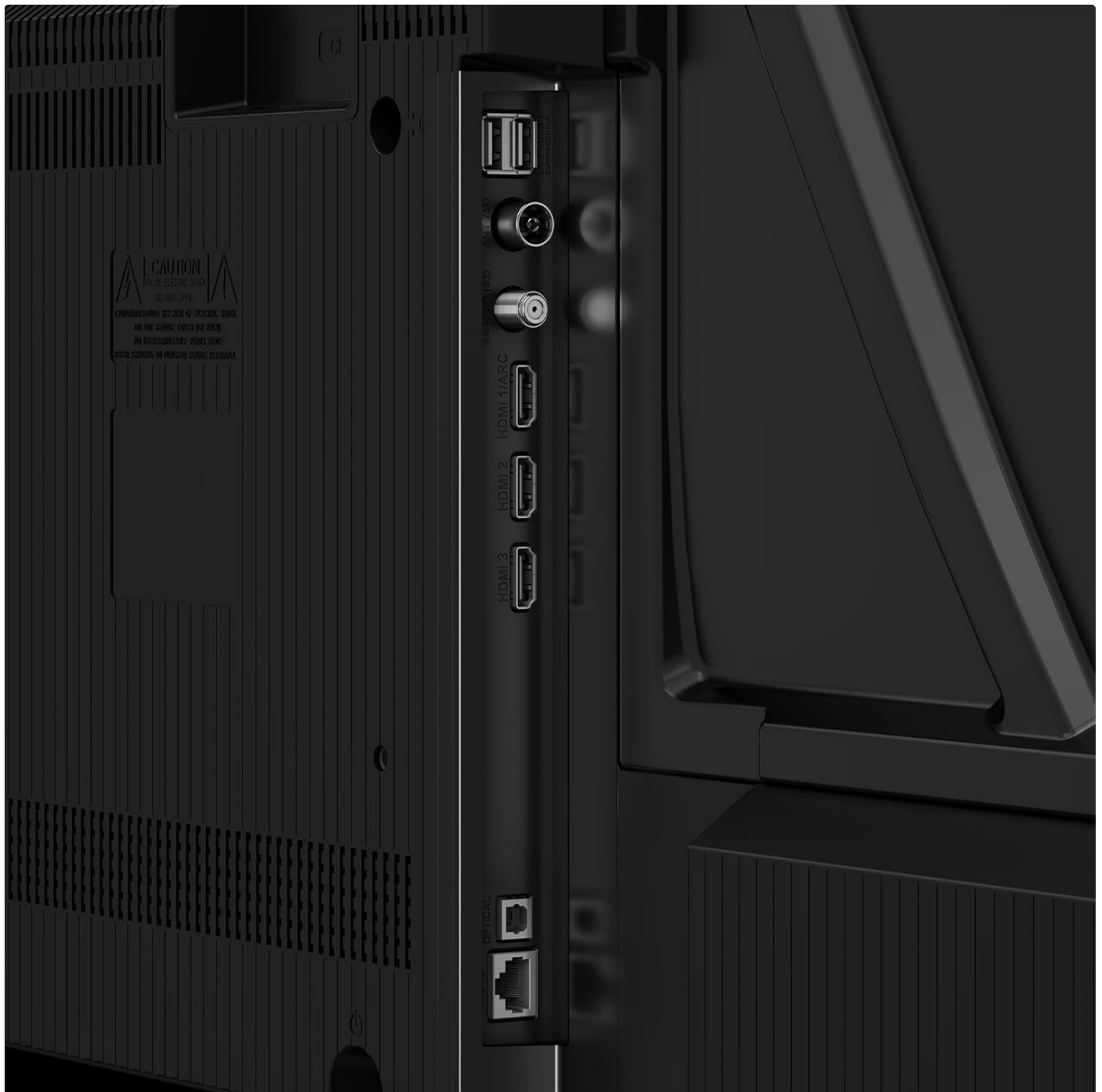
Image 4: Detailed view of the connectivity panel on the back of the Grundig TV, showing multiple ports including USB, HDMI (HDMI 1/ARC, HDMI 2, HDMI 3), satellite/antenna input, and an Ethernet (LAN) port.