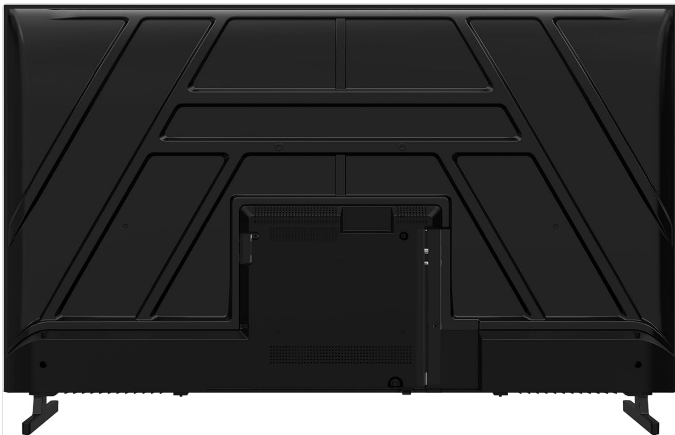
Image 5: Full rear view of the Grundig 50 GKU 700 TV, showing the overall design of the back panel and the central area where the power and input ports are located.