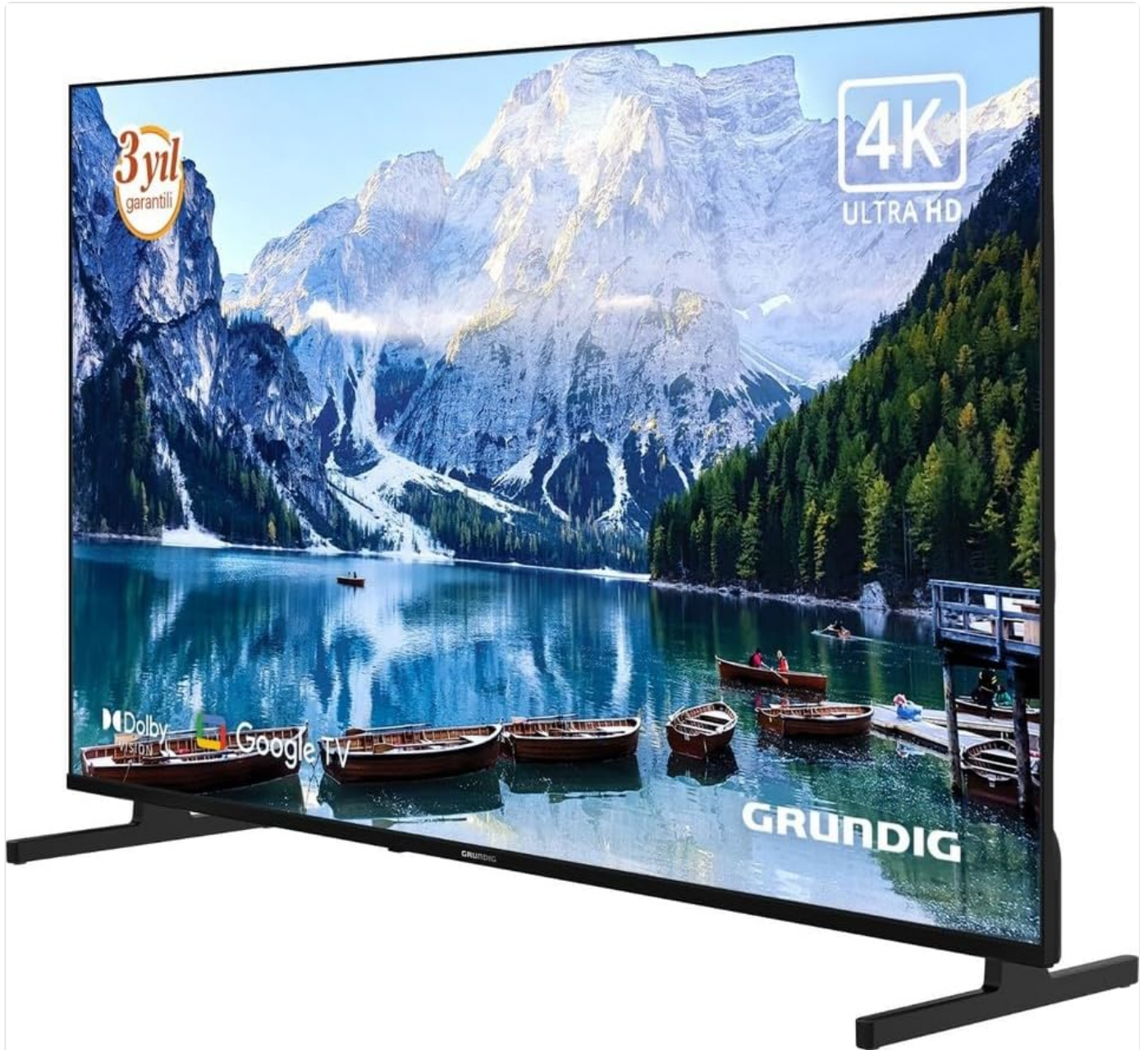
Image 1: Front view of the Grundig 50 GKU 700 TV with its stand. The screen displays a scenic landscape with mountains and a lake. The TV features a slim bezel and the Grundig logo at the bottom center.