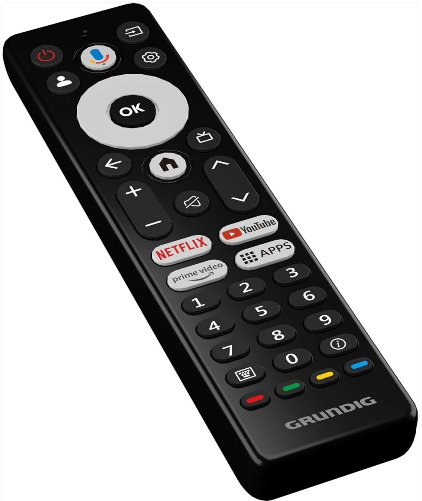
Image 7: Angled view of the Grundig TV remote control, showing its ergonomic design and the layout of its buttons.