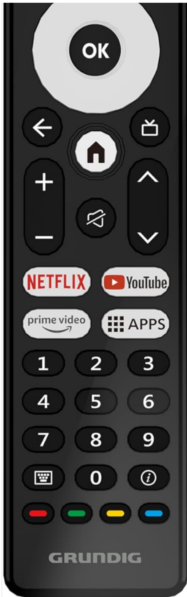
Image 6: Front view of the Grundig TV remote control. Key buttons include Power, Google Assistant (microphone), Settings, Input, Navigation Pad with OK button, Volume, Channel, Home, Mute, Netflix, YouTube, Prime Video, and Apps buttons, along with numeric keys.