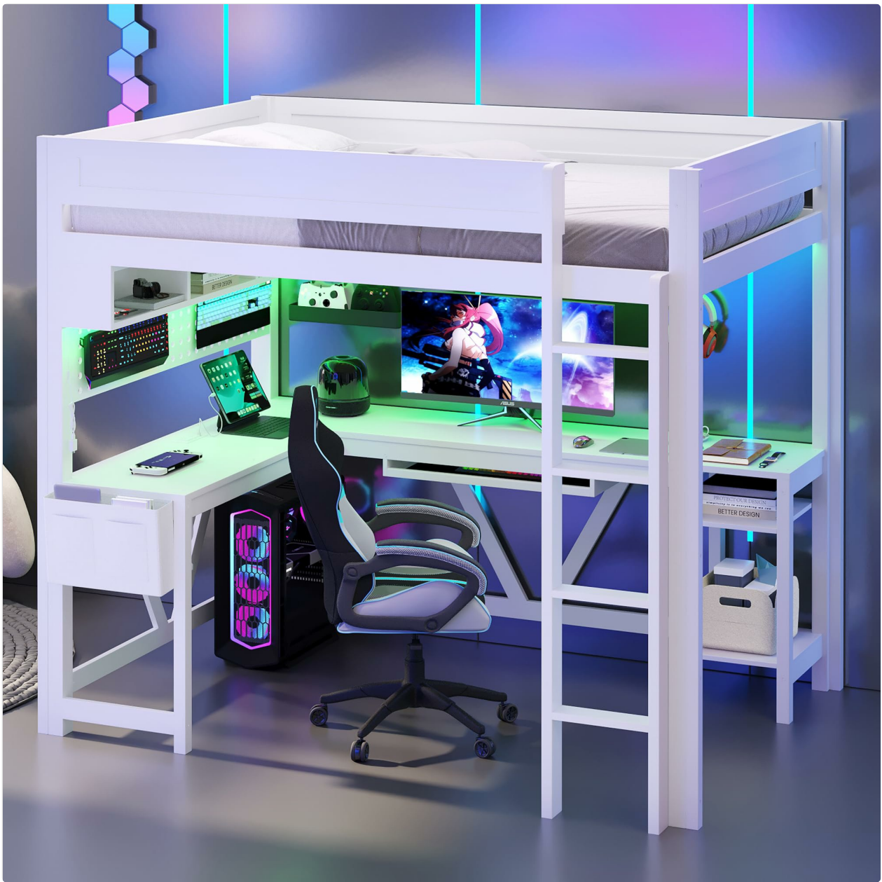
Image: Overall view of the DERCASS Full Size Gaming Loft Bed in white, showcasing the integrated desk, storage, and ladder.