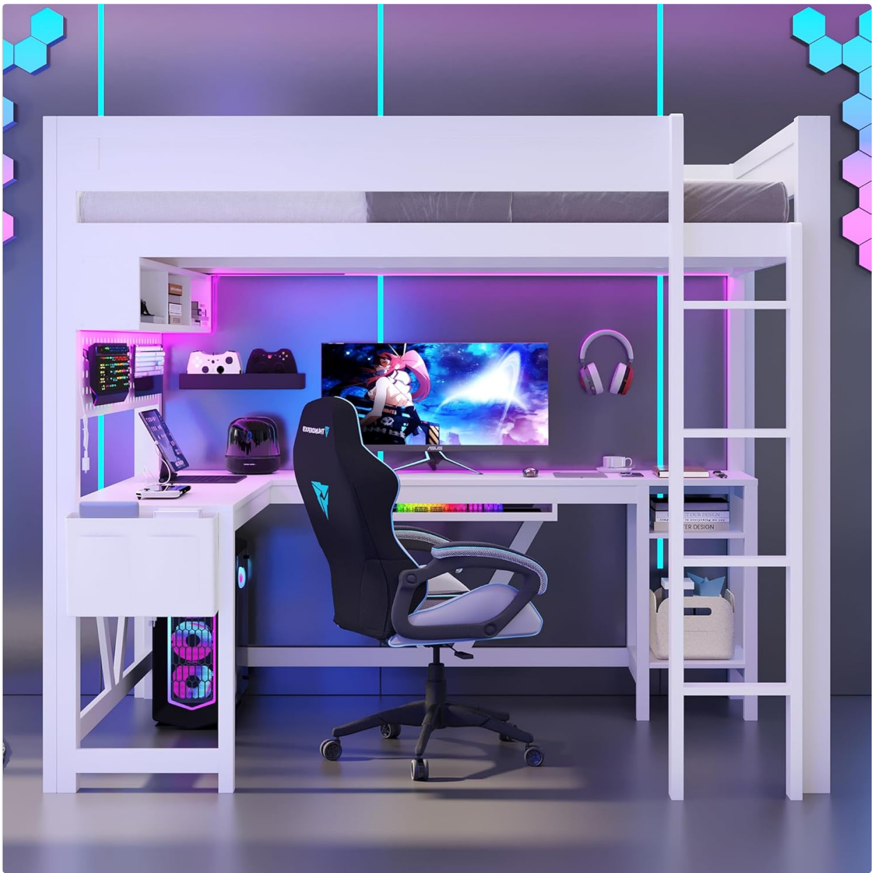
Image: The loft bed's desk area with the LED lights illuminated in a green hue, highlighting the integrated lighting feature.