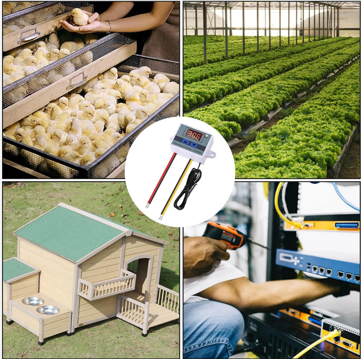
Image 1.1: The XH-W3001 digital temperature controller can be used in a wide range of applications, such as controlling temperatures in incubators, greenhouses, pet enclosures, and industrial equipment like server racks.