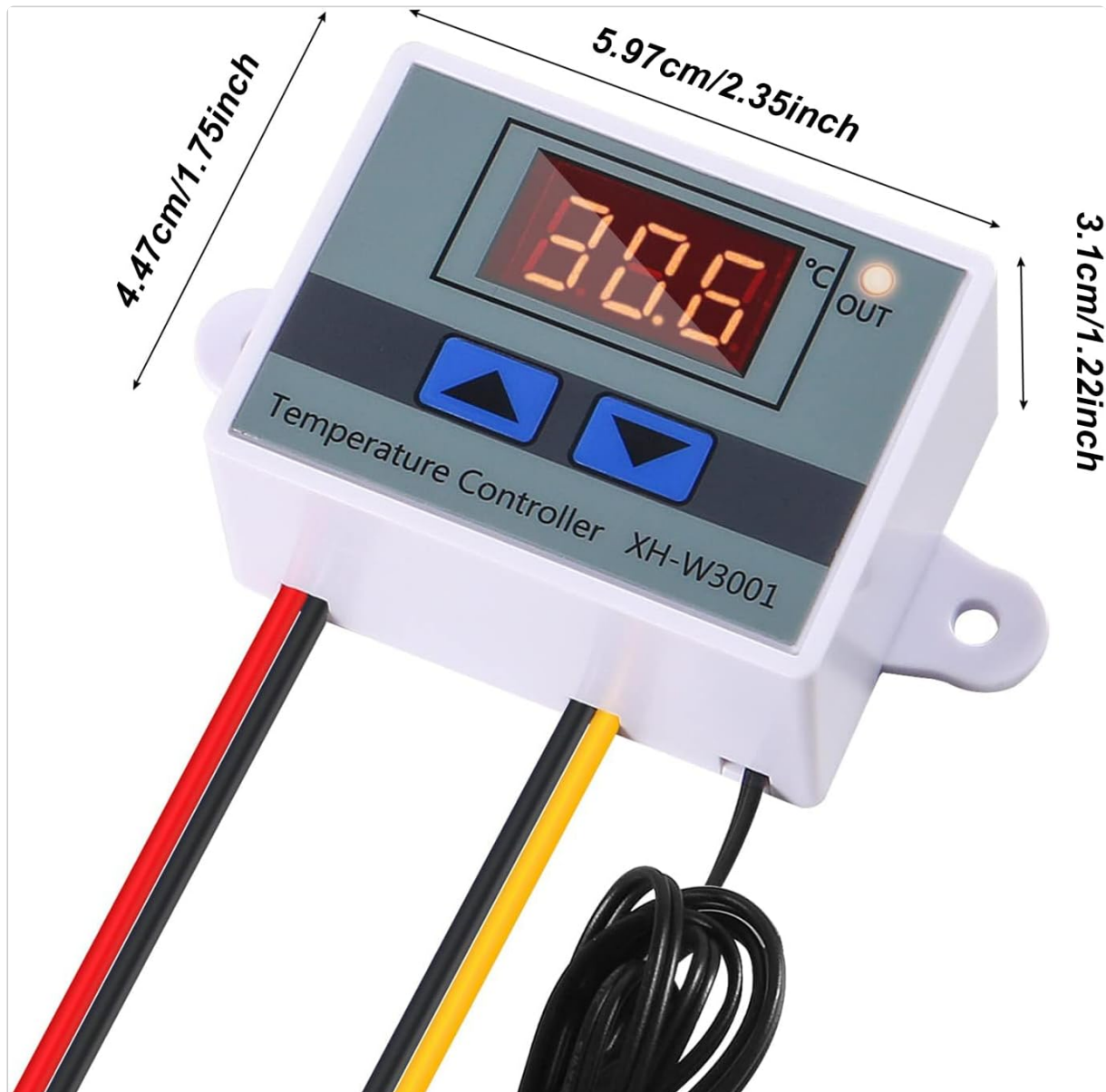
Image 4.1: Approximate physical dimensions of the XH-W3001 controller.