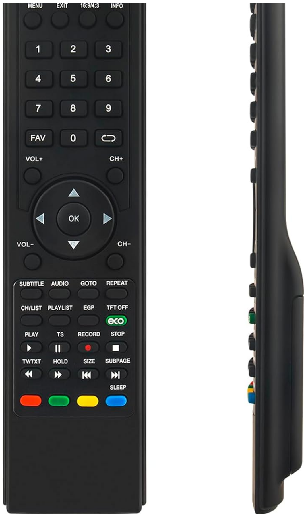
Figure 4: Diagram illustrating the dimensions of the VINABTY remote control: 22 cm (8.66 in) in length and 5.4 cm (2.13 in) in width.