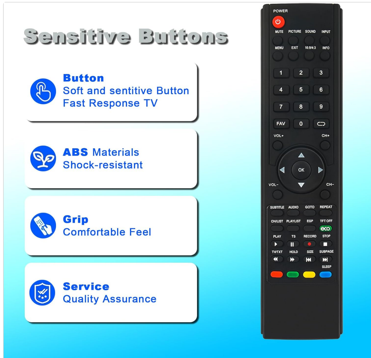
Figure 2: Diagram highlighting the sensitive and responsive buttons of the remote control, made from durable ABS material for a comfortable grip and quality assurance.

The remote control features a standard layout for intuitive operation of your BLU:SENS TV. Point the remote directly at your television's infrared receiver for optimal performance.