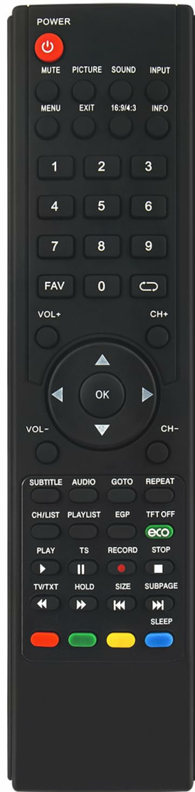
Figure 1: VINABTY Replacement Remote Control. This image shows the full remote control with its array of buttons, set against a blurred background of a modern living room with a television.