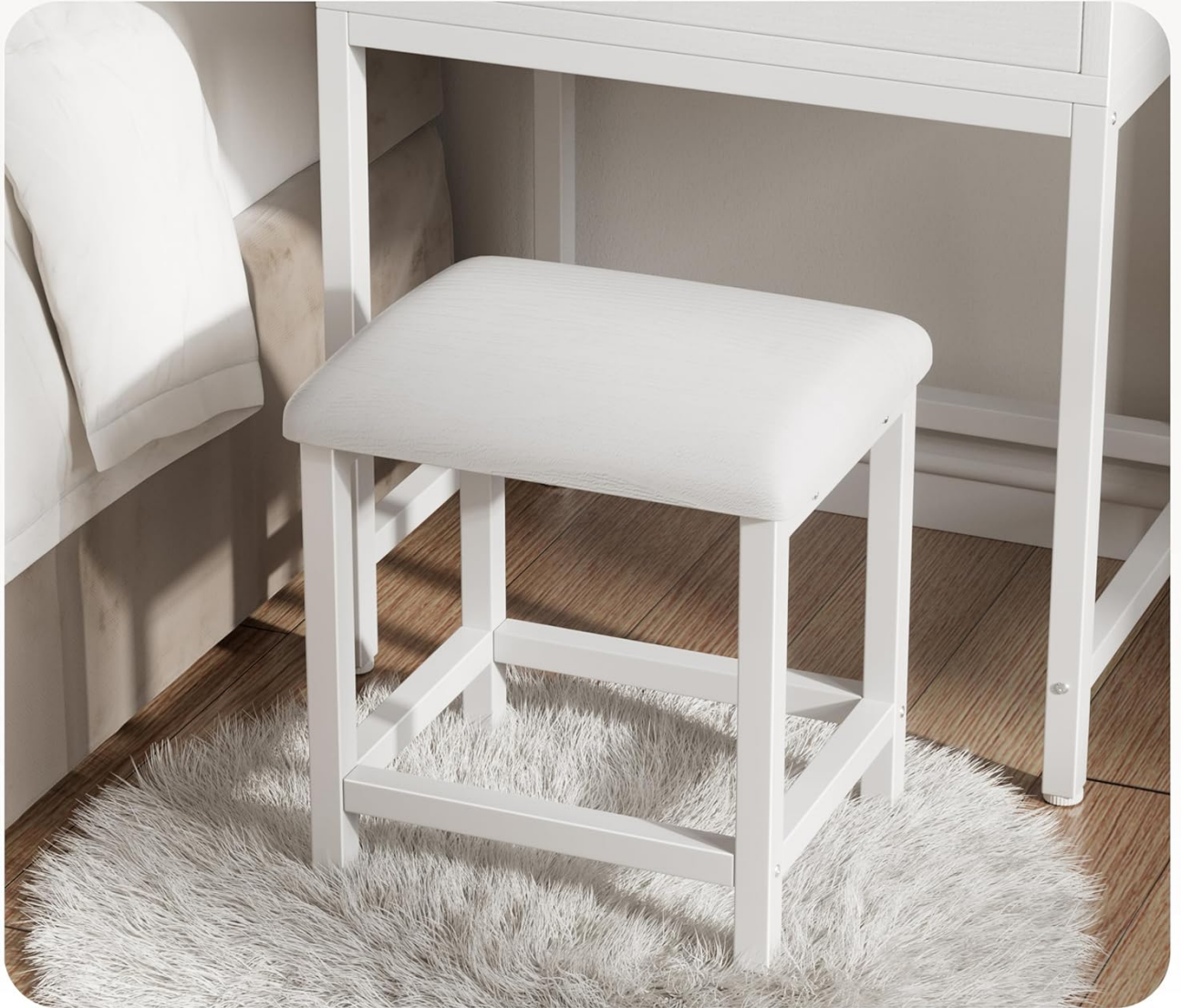
Image: Close-up of the white cushioned stool, emphasizing its comfortable seat and sturdy frame. The stool is positioned under the vanity desk.