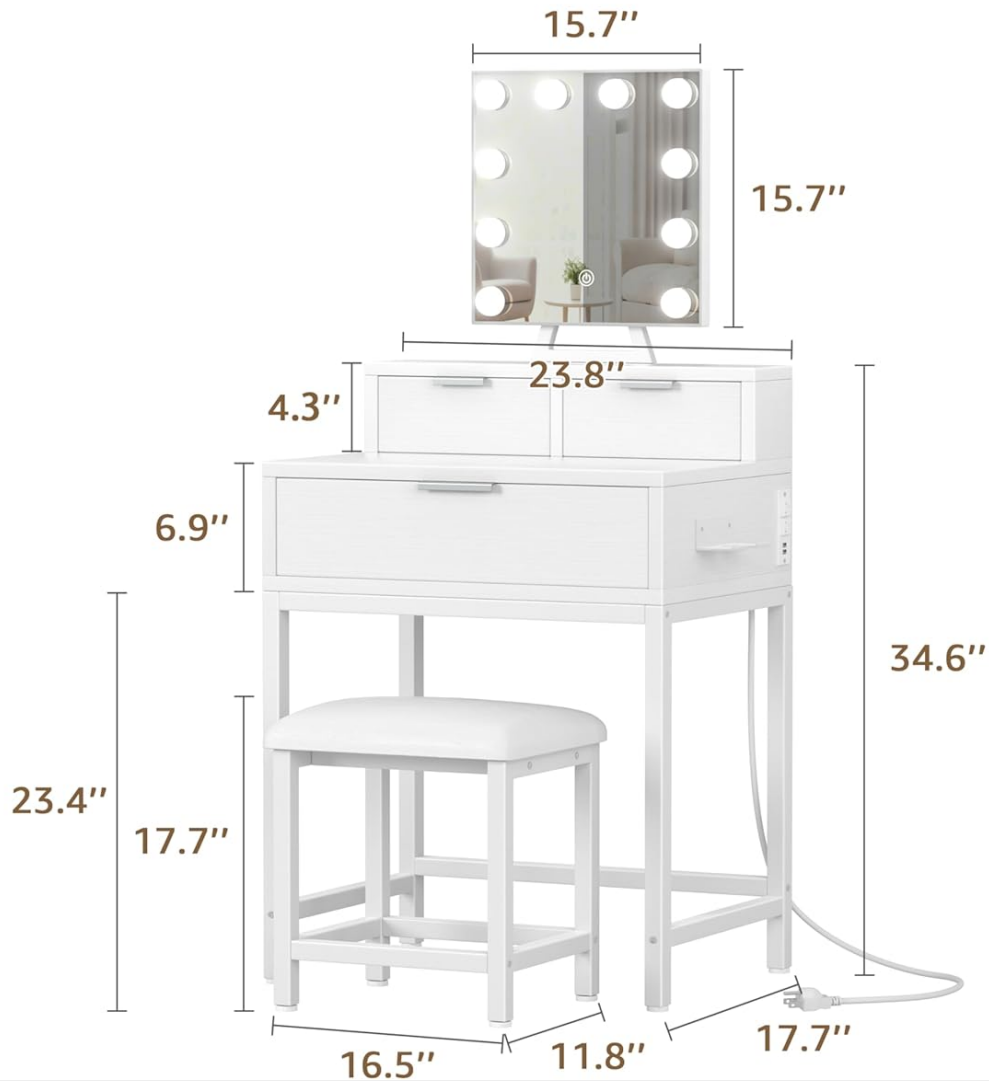
Image: Diagram illustrating the detailed product dimensions of the BOLUO White Makeup Vanity Desk, including height, width, and depth measurements for the desk, mirror, and stool.