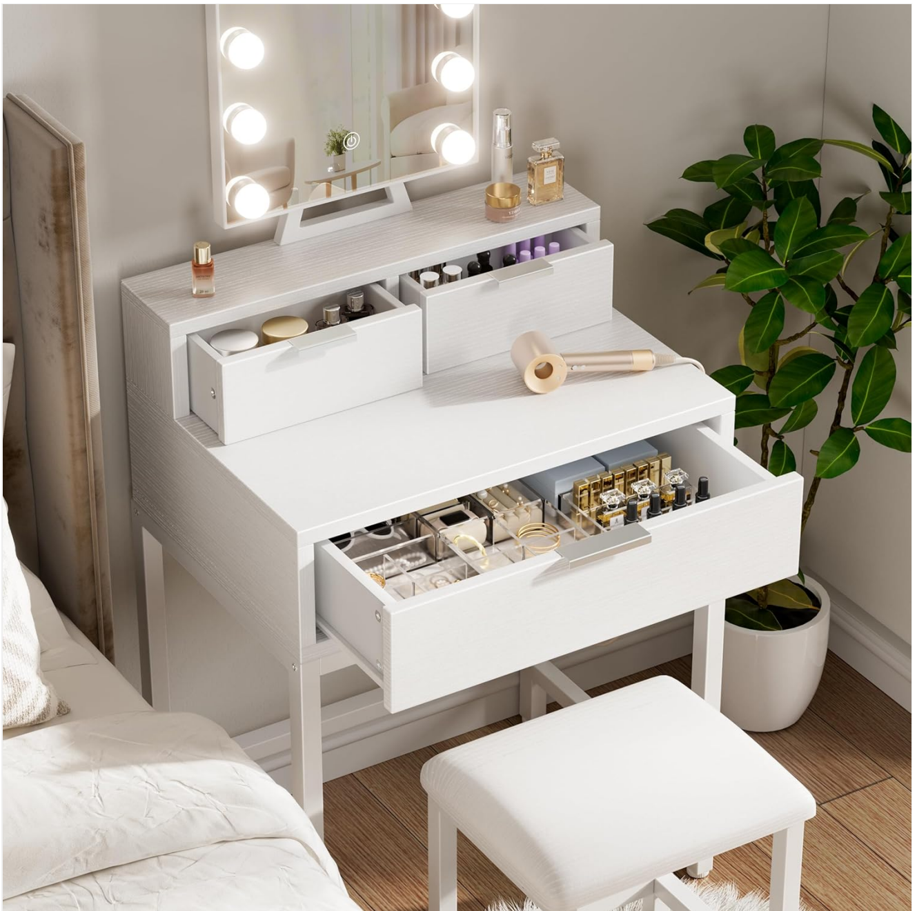
Image: Top-down view of the vanity desk with drawers open, revealing organized storage for cosmetics and jewelry. This illustrates the practical storage capacity of the desk.