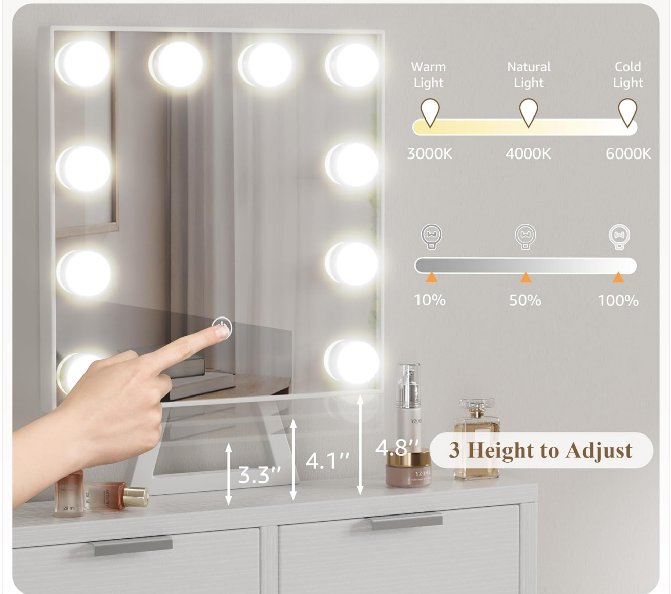
Image: Close-up of the Hollywood mirror showing the touch controls for 3 color light modes and adjustable brightness. The image illustrates the different light temperatures and brightness levels.