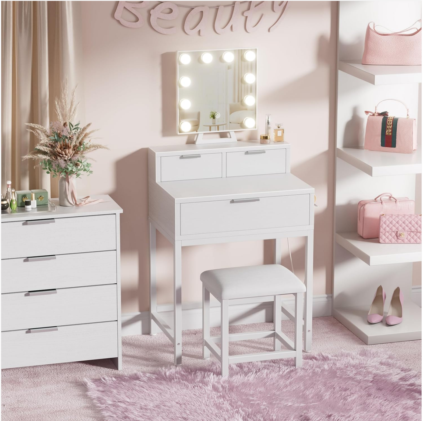
Image: Fully assembled BOLUO White Makeup Vanity Desk with Hollywood Mirror and Stool. This image shows the complete vanity setup, including the desk, mirror with lights, and matching stool, ready for use.