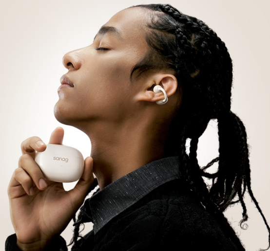
Image highlighting the extended battery life: 7 hours of playback on a single charge and up to 50 hours with the charging case.