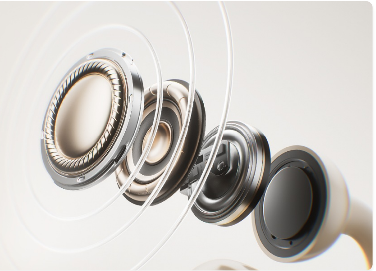
Illustration of the 12mm dual composite magnetic film driver, emphasizing strong bass and powerful sound.

The Z60S also incorporates technology to minimize sound leakage, ensuring your listening experience is private even at higher volumes.