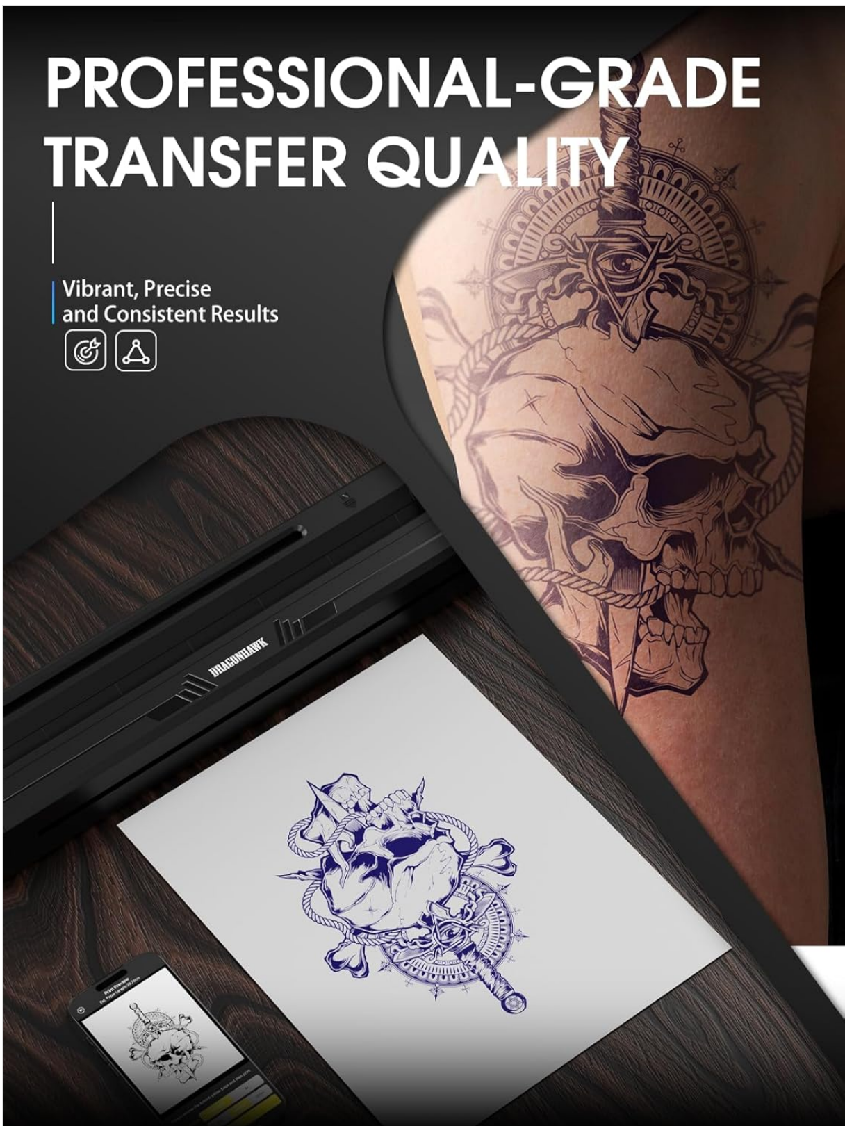
Image: A close-up view of a tattoo stencil being printed, emphasizing the vibrant, precise, and consistent results of the professional-grade transfer quality.