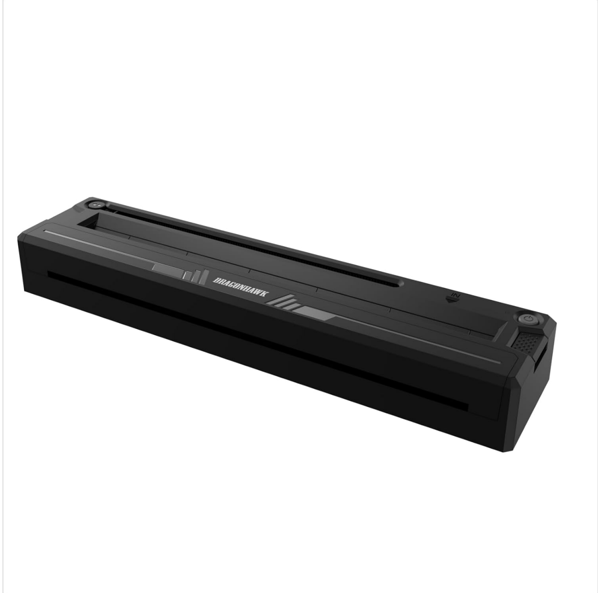
Image: The Dragonhawk A4 Wireless Thermal Tattoo Stencil Printer, showcasing its sleek, compact design.

Familiarize yourself with the main components of your printer: