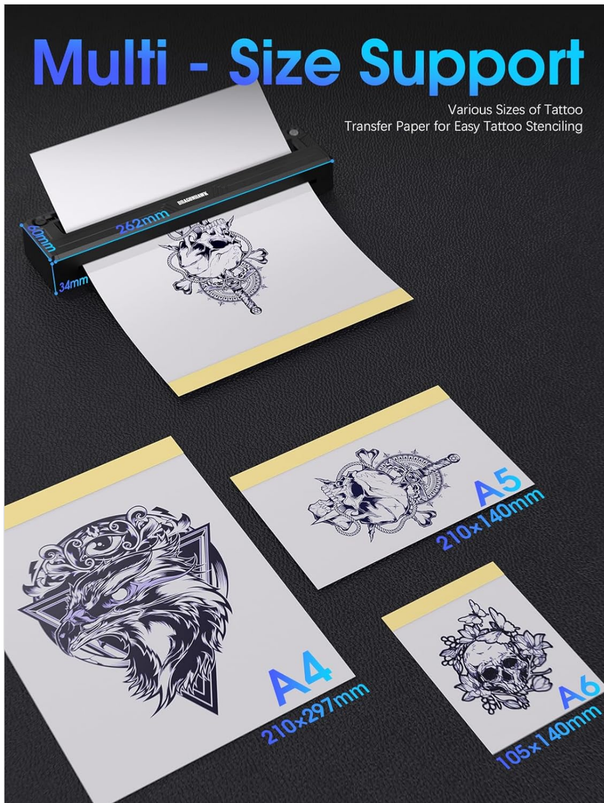
Image: The Dragonhawk A4 printer demonstrating its multi-size support for various tattoo transfer paper dimensions, including A4 (210x297mm), A5 (210x140mm), and A6 (105x140mm).

Carefully insert the stencil transfer paper into the printer's paper feed slot. Ensure the paper is aligned correctly and fed straight to prevent jams or skewed prints. The printer supports various sizes, including A4, A5, and A6.