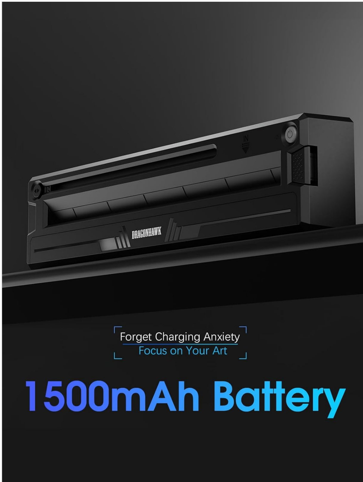
Image: The Dragonhawk A4 printer highlighting its 1500mAh battery, designed to provide long-lasting power for extended use.