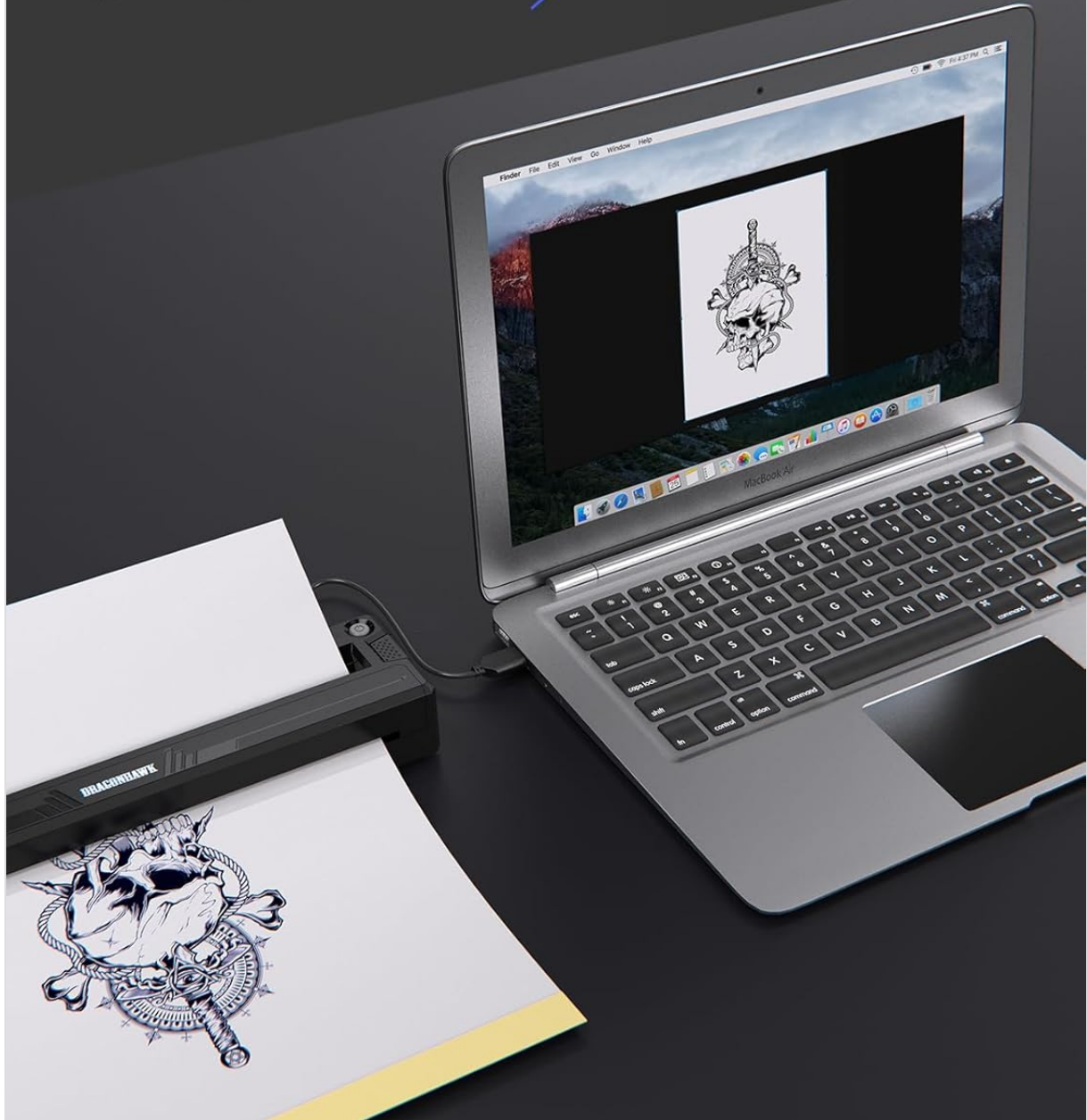
Image: The Dragonhawk A4 printer connected to a laptop via its Type-C port, illustrating its compatibility with PC control for printing tattoo stencils.

Type-C Port: Charge with Universal Cables & Support PC Control