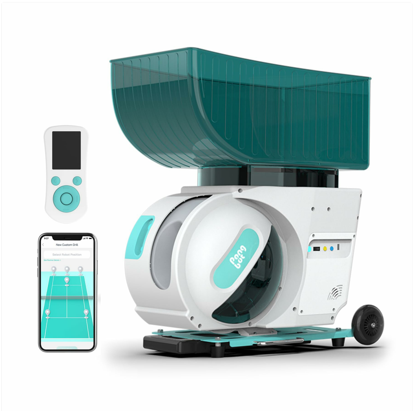
Image: The PONGBOT PACE S Tennis Ball Machine, a compact and portable device designed for tennis training.