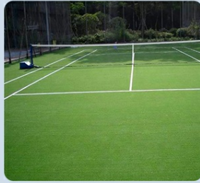
Artificial Grass Court