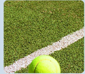
Natural Grass Court

Image: A tennis player on court returning a ball, with a smartphone overlay showing the app's custom drill creation interface, demonstrating the machine's ability to recreate various shot paths.