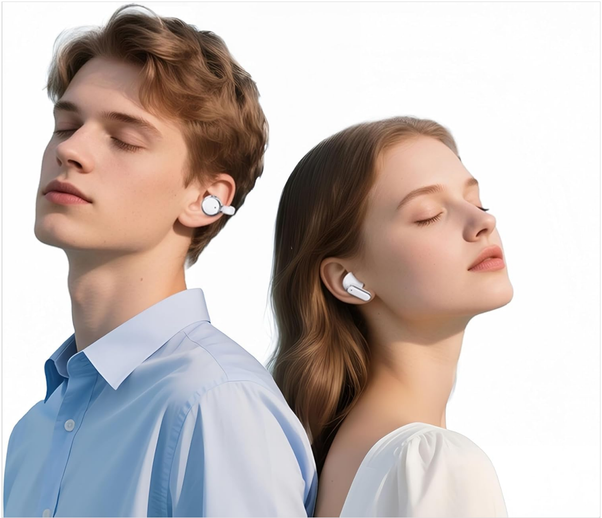
Image: A man and a woman wearing the white Q16 earbuds, demonstrating the ear-clip wearing style in use.