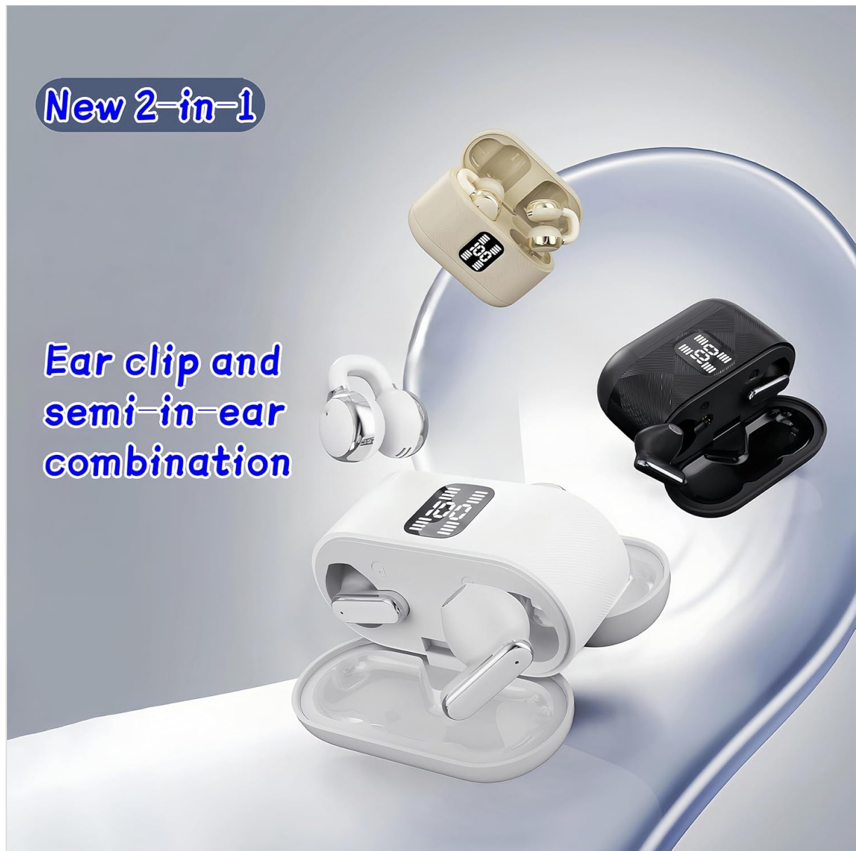
Image: A graphic illustrating the two wearing styles: ear clip and semi-in-ear, highlighting the versatility of the Q16 earbuds.