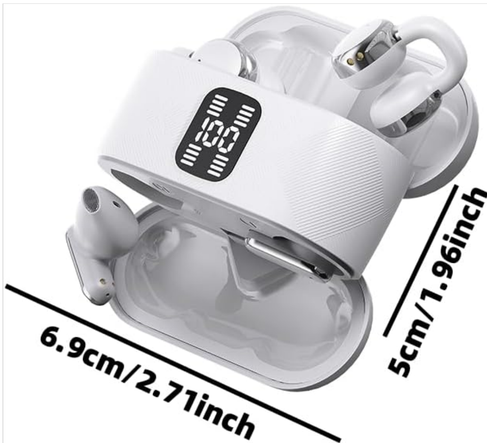
Image: The Generic Q16 TWS Earbuds nestled within their charging case, showcasing the compact design.