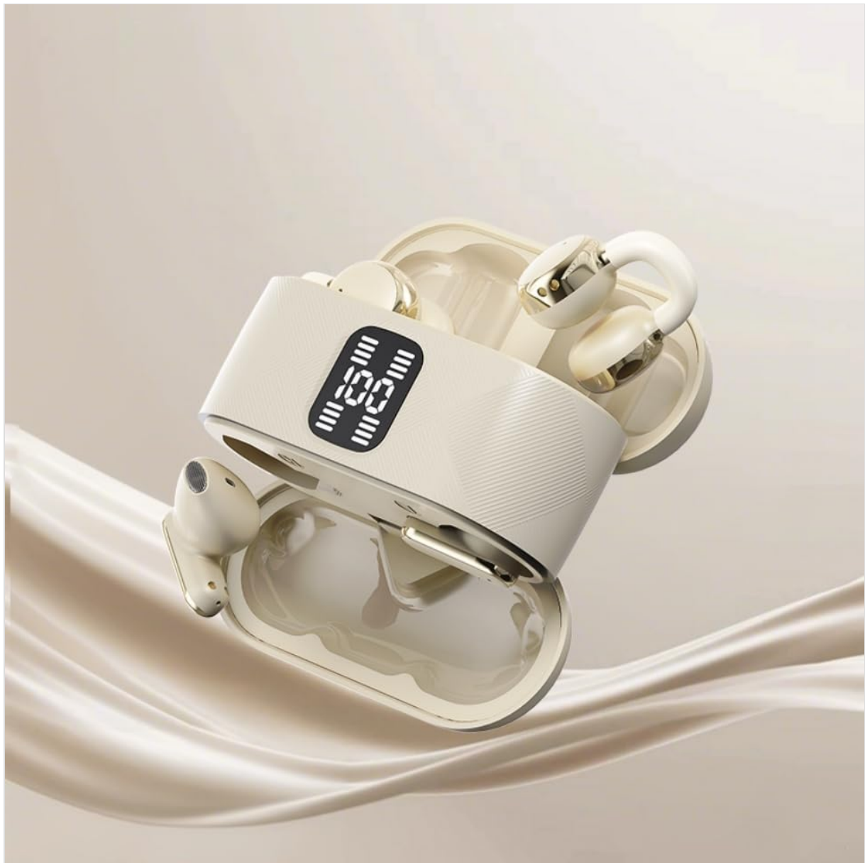
Image: Beige Q16 TWS Earbuds inside their open charging case, with the LED display clearly showing a full charge (100%).