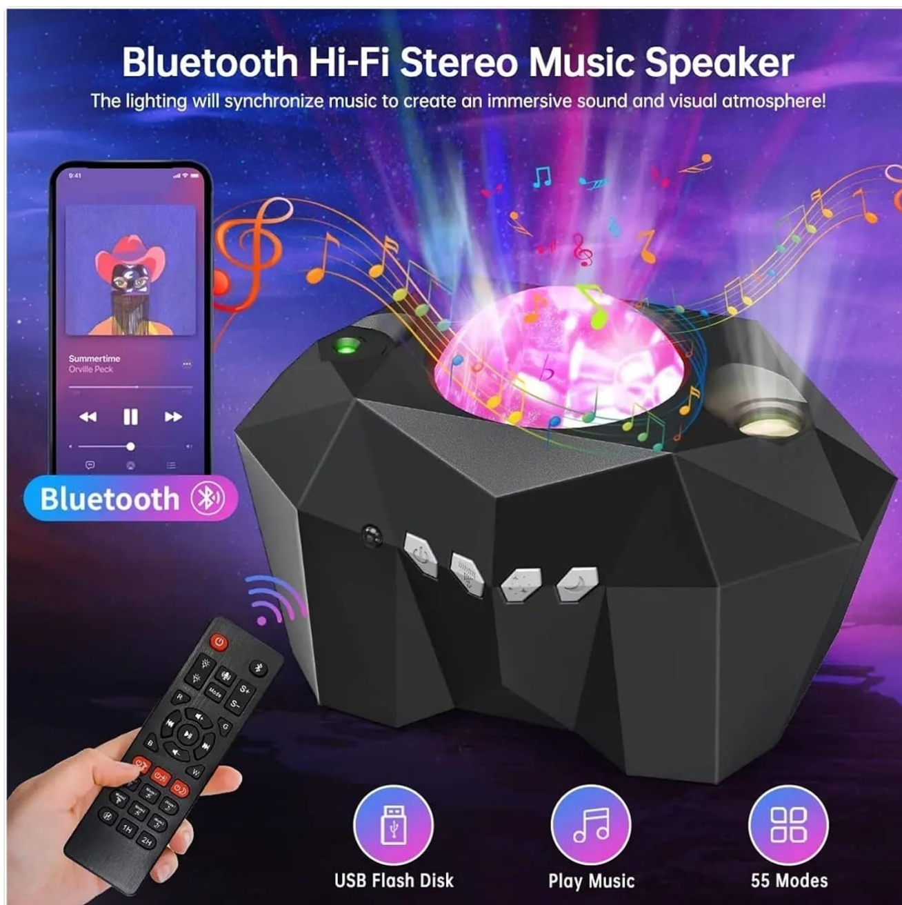
Image 2: A close-up view of the Aurora Projector, highlighting its Bluetooth Hi-Fi Stereo Music Speaker feature. The image shows the projector emitting colorful lights, with musical notes and a smartphone displaying music playback, indicating its audio capabilities.