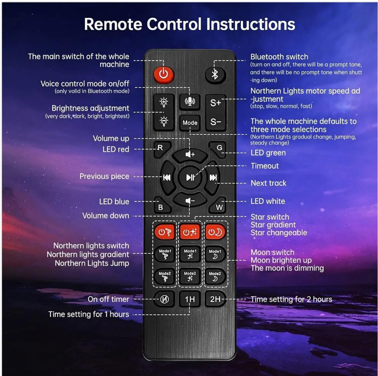
Image 3: Diagram illustrating the functions of each button on the remote control. Key functions include power, Bluetooth switch, brightness adjustment, volume control, LED color selection (Red, Green, Blue, White), Northern Lights motor speed, various light modes (Northern Lights, Star, Moon), and timer settings (1H, 2H).

The remote control provides full functionality for the projector. Refer to the diagram below for button identification: