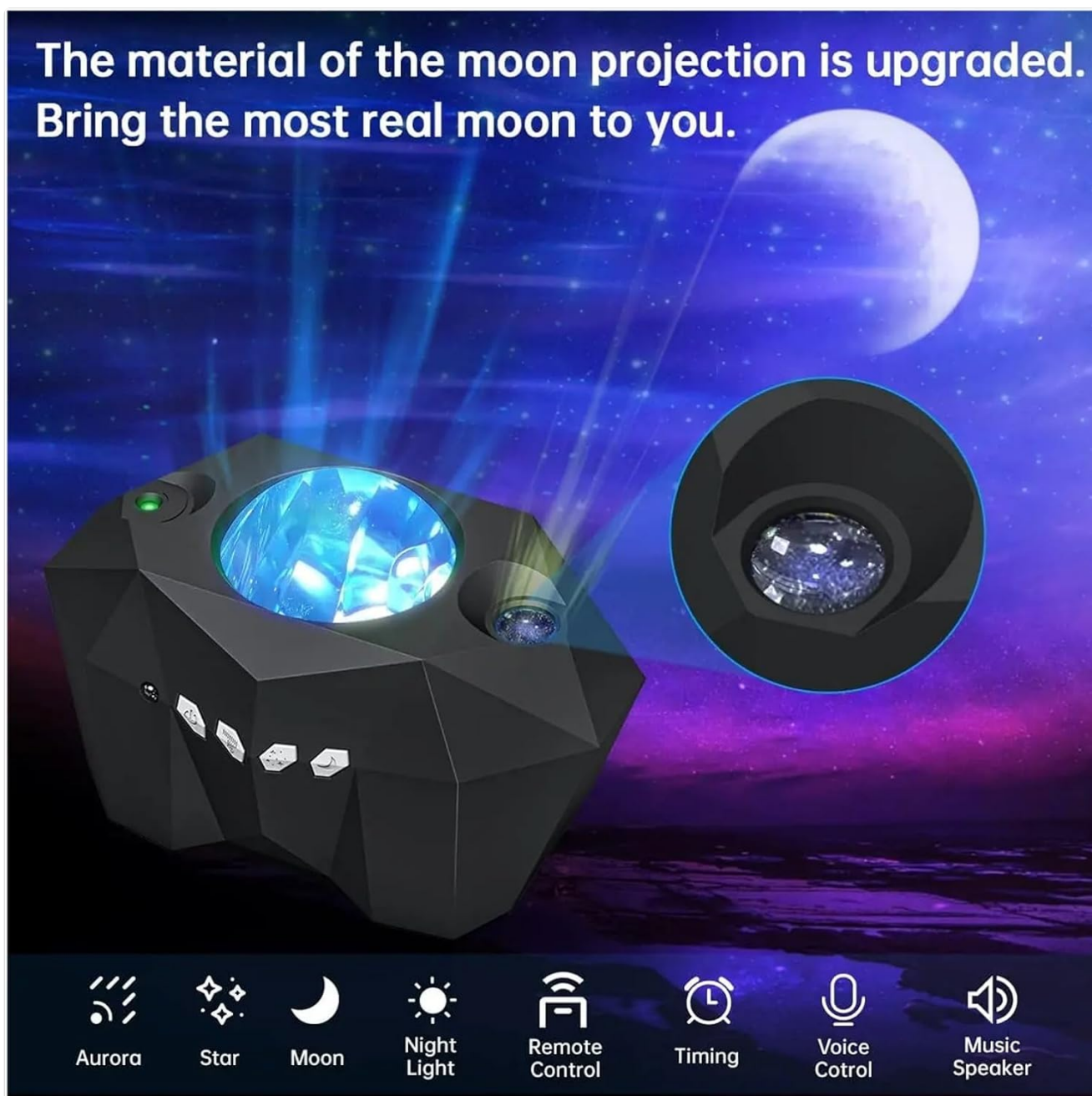
Image 5: This image highlights the upgraded moon projection feature, showing a clear and realistic moon projected onto a surface, emphasizing the quality of the lunar imaging.