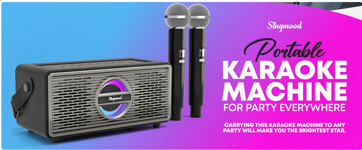
Image: The two wireless UHF microphones included with the system, emphasizing their key features.