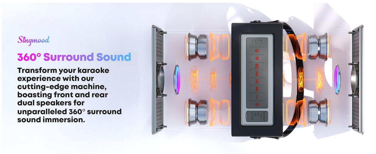
Image: An internal view illustrating the 360-degree surround sound design and speaker placement.