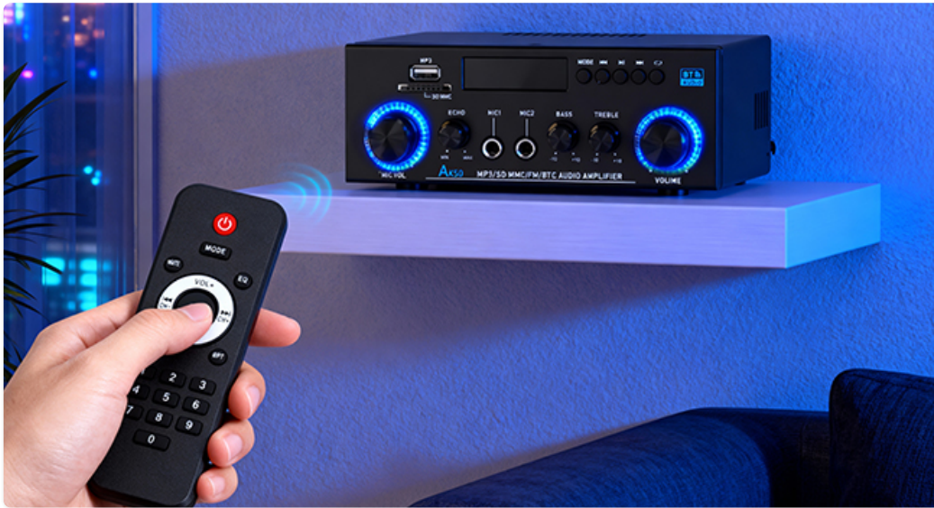
Figure 10: Remote Control