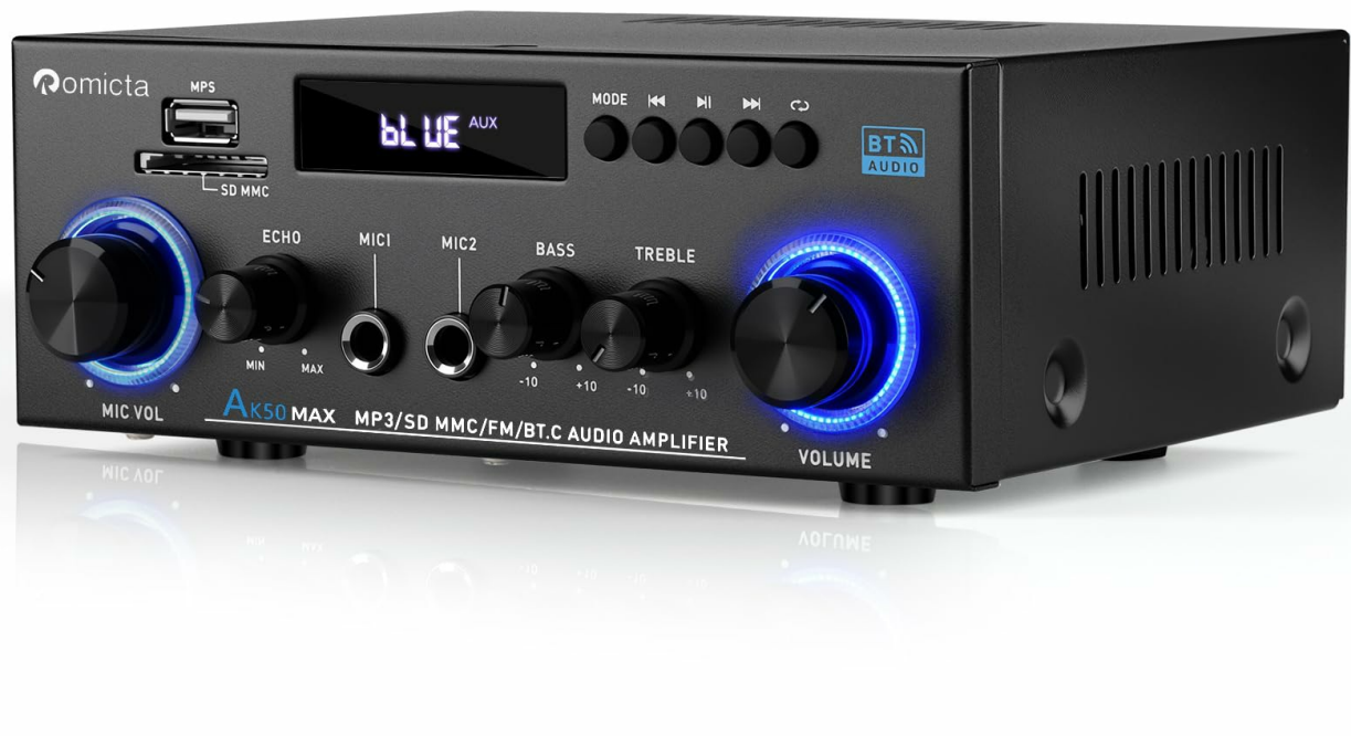
Figure 1: Romicta AK50MAX Stereo Audio Amplifier