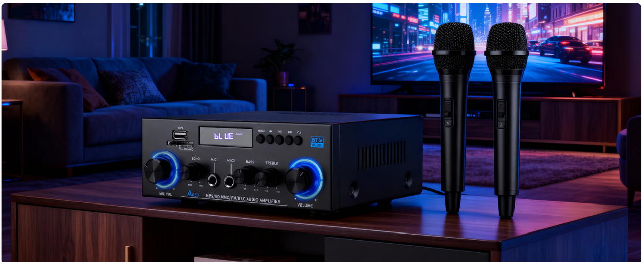
Figure 8: Microphone Inputs and Controls