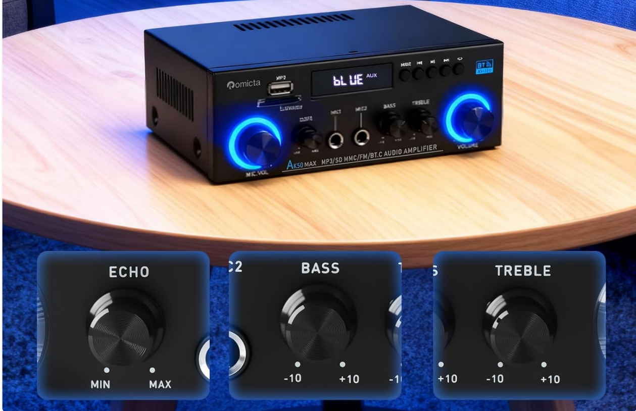
Figure 9: Tone Control Knobs

Customize your perfect sound with adjustable bass, mid, treble, echo, and full control.