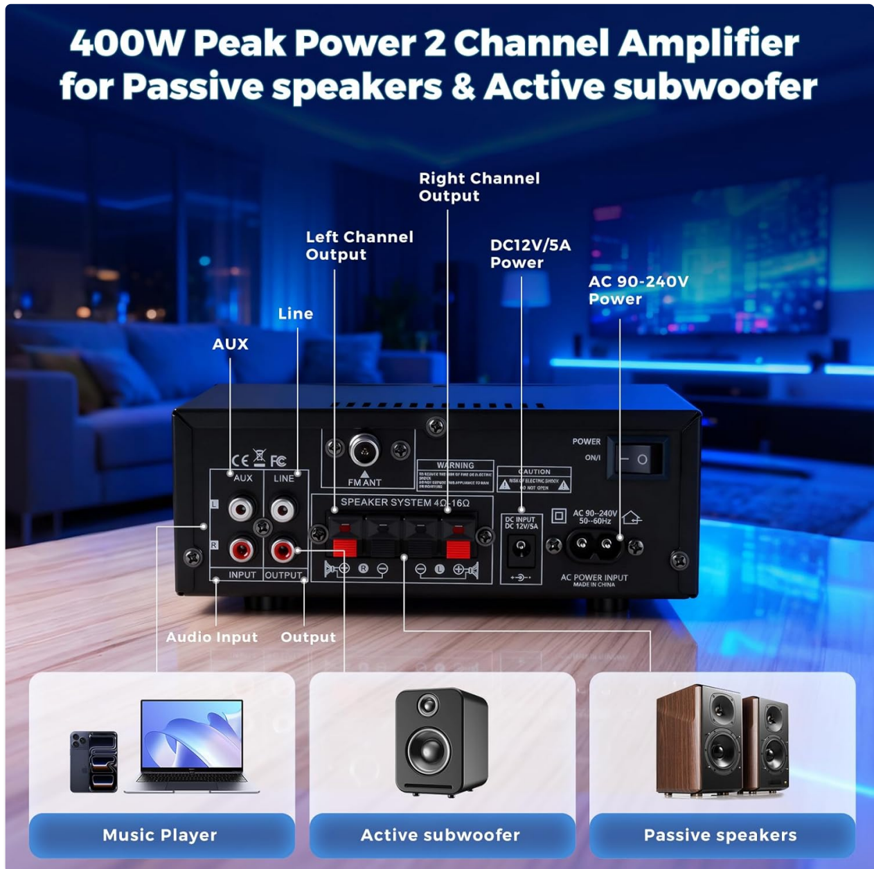
Figure 5: Speaker Connection Diagram

Connect your passive speakers to the speaker terminals on the back panel. Ensure correct polarity (red to red, black to black) for optimal sound quality. The amplifier supports speakers with 4-16Ω impedance.