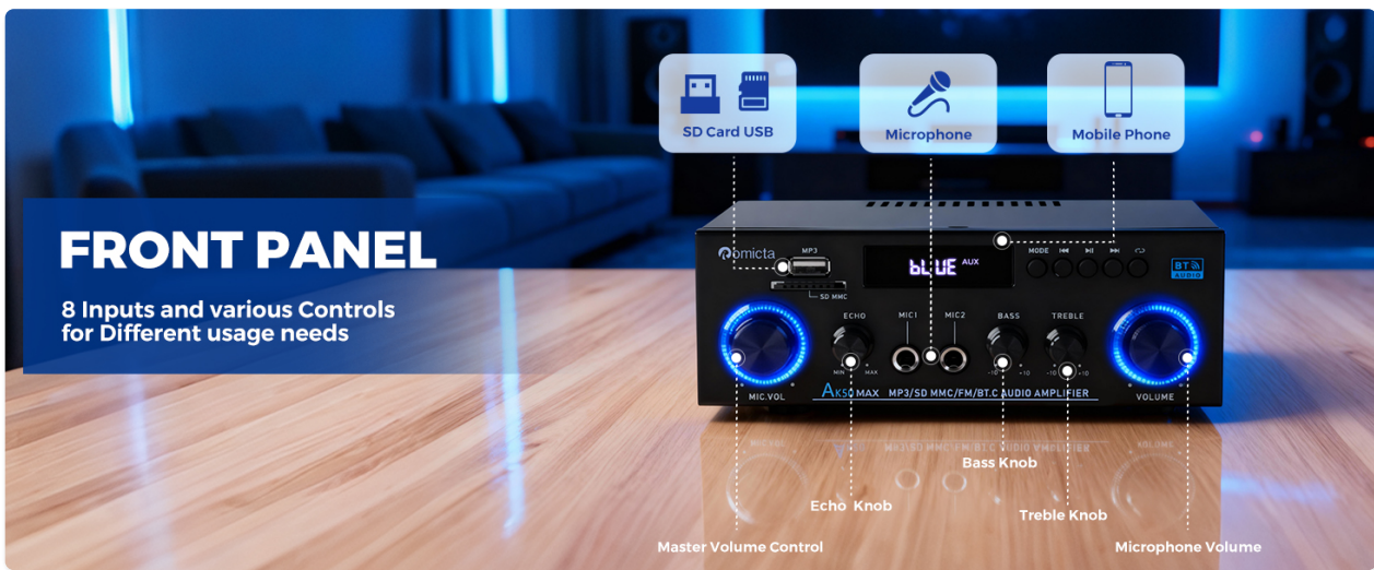
Figure 3: Front Panel Controls