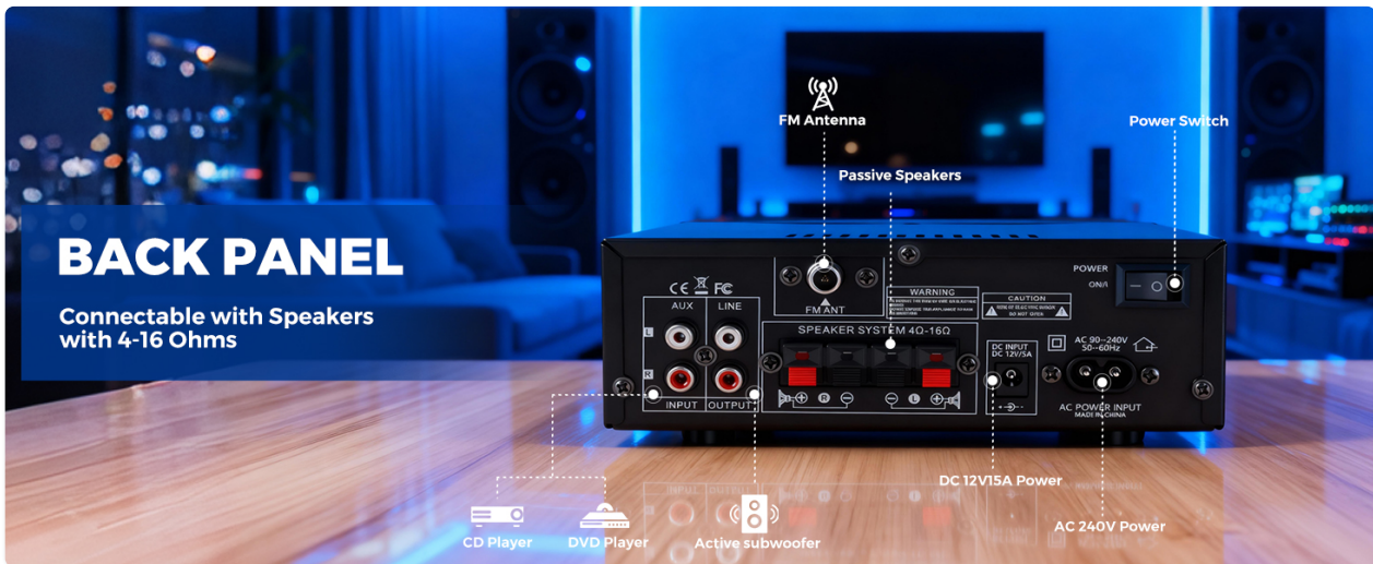
Figure 4: Back Panel Connections