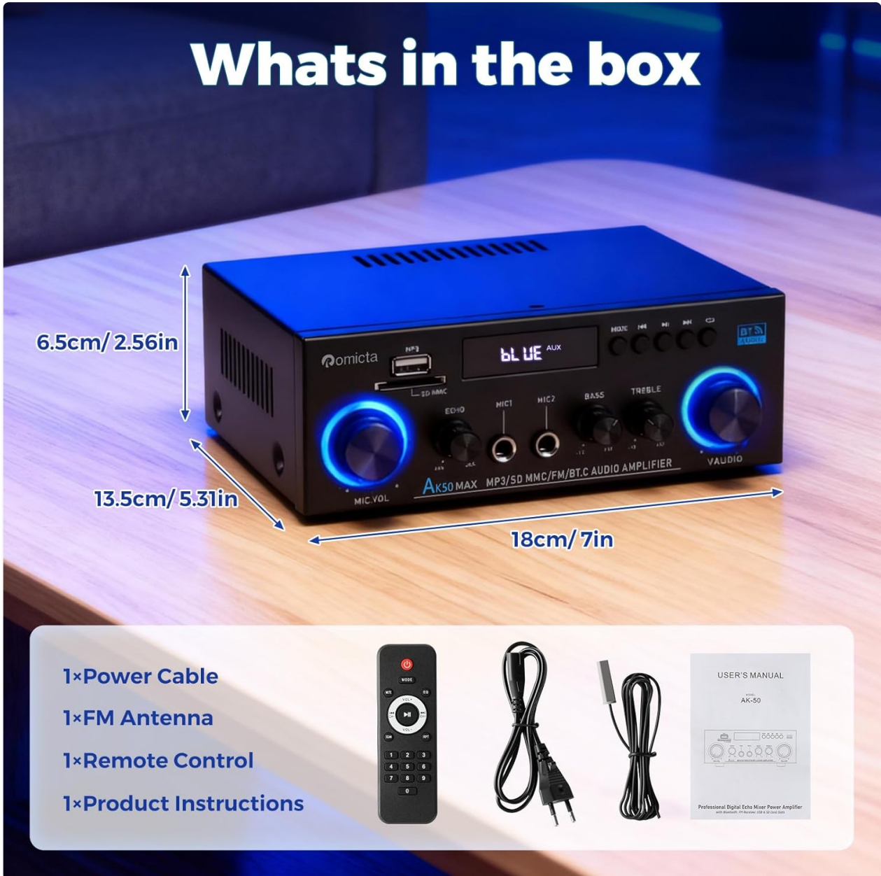
Figure 2: Package Contents