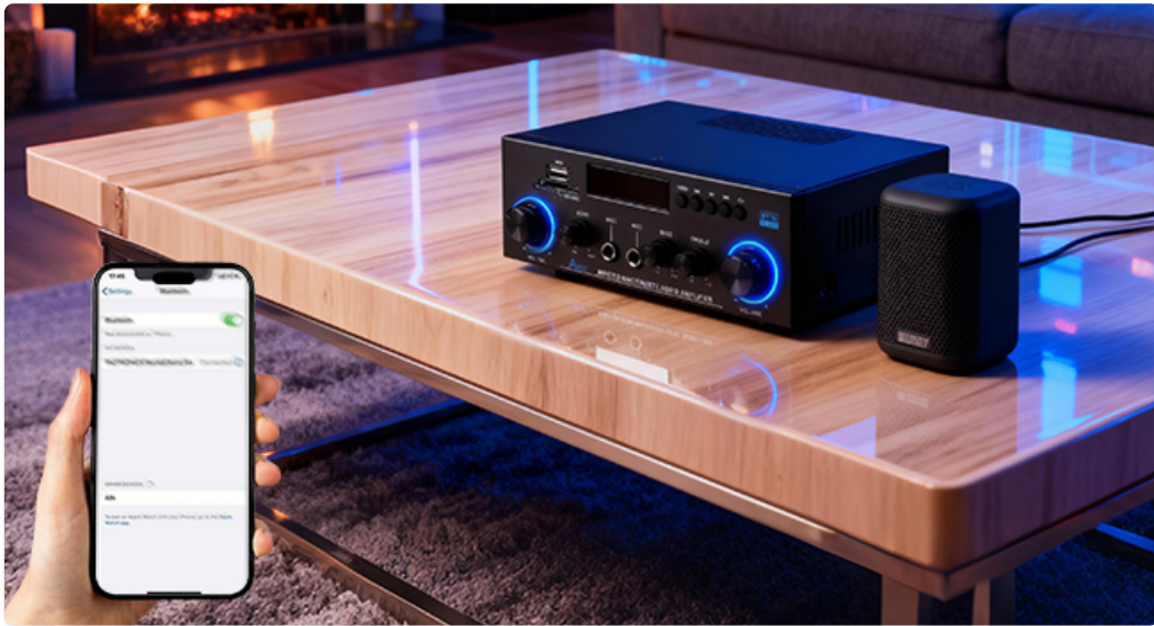
Figure 7: Bluetooth Pairing