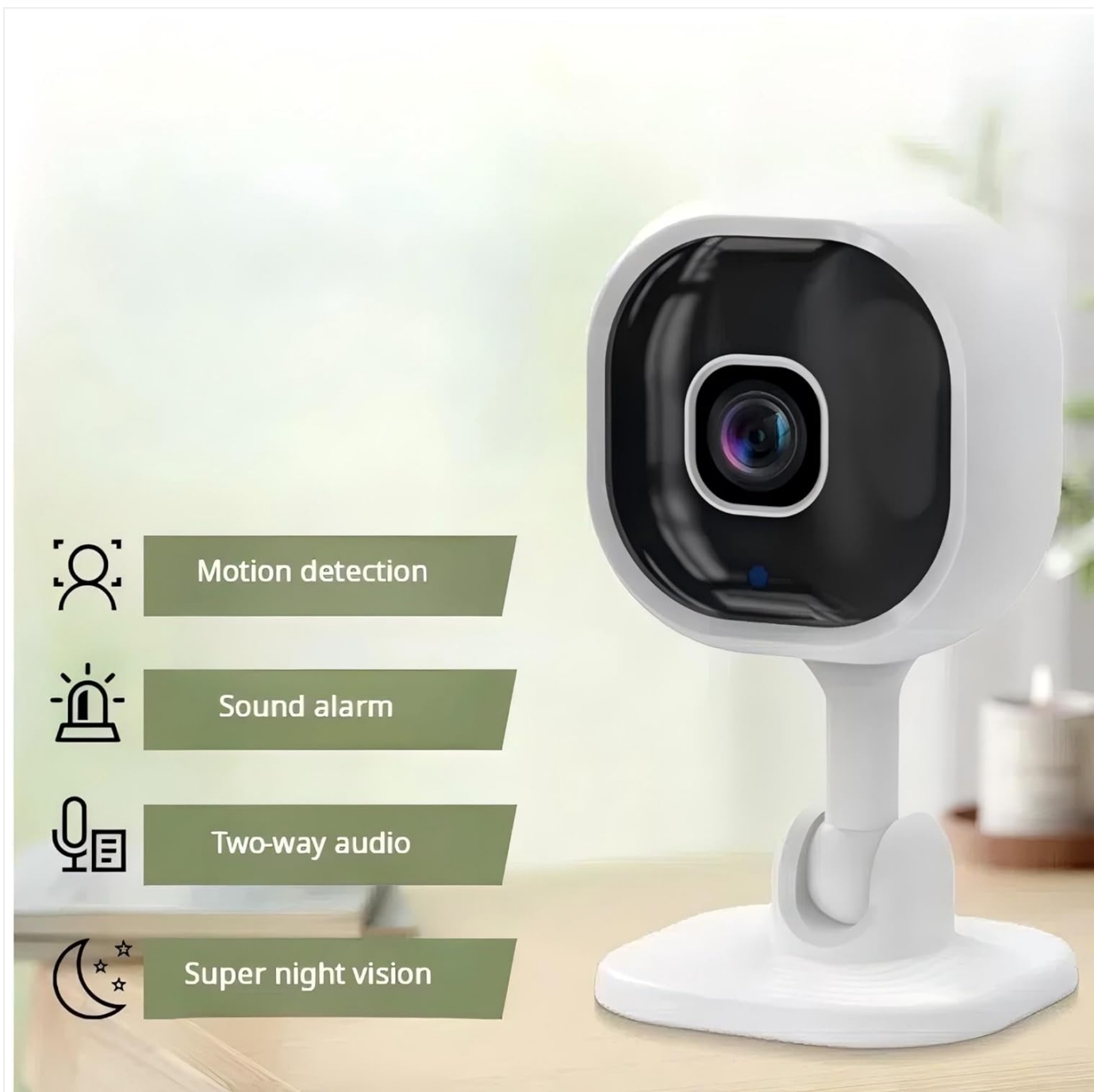
Figure 1: JolyWell Baby Monitor highlighting key features such as motion detection, sound alarm, two-way audio, and super night vision.