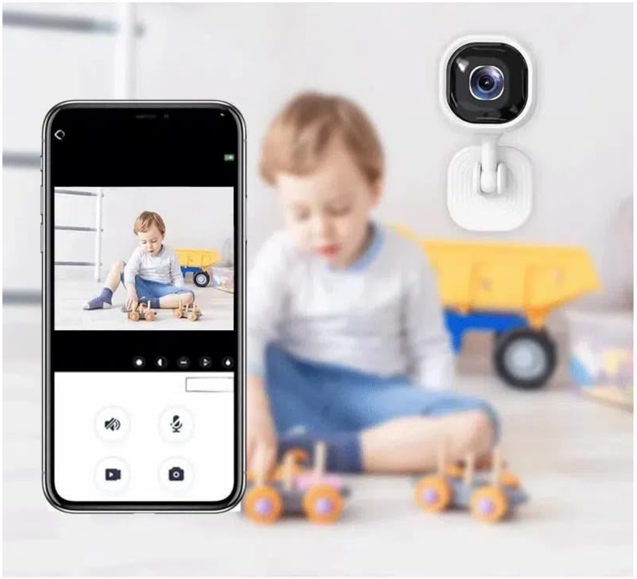
Figure 2: The JolyWell Baby Monitor can be viewed remotely via a smartphone application, showing a live feed of a child.