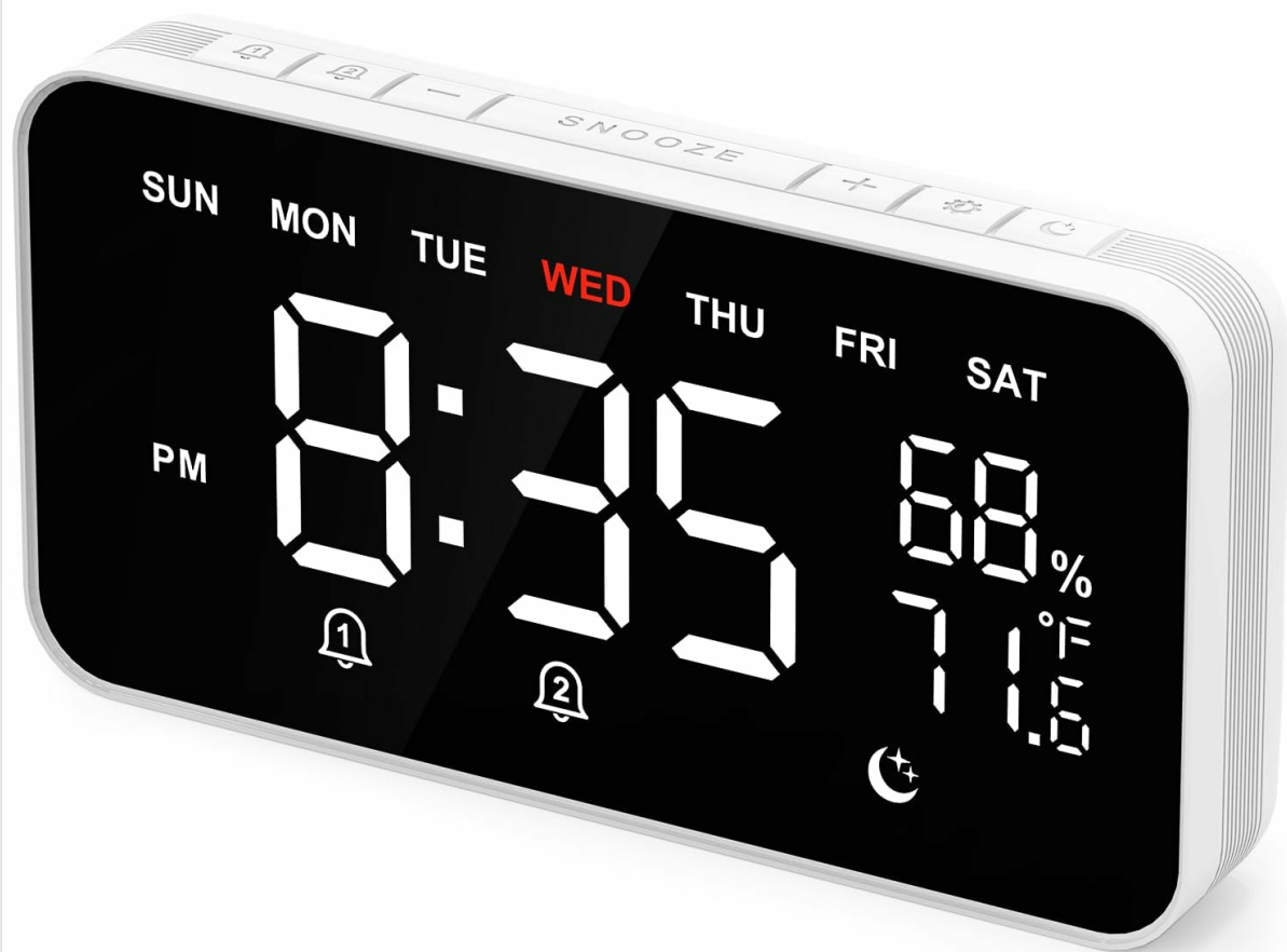
Image: The clock's display showing time, day of the week, temperature, and humidity.