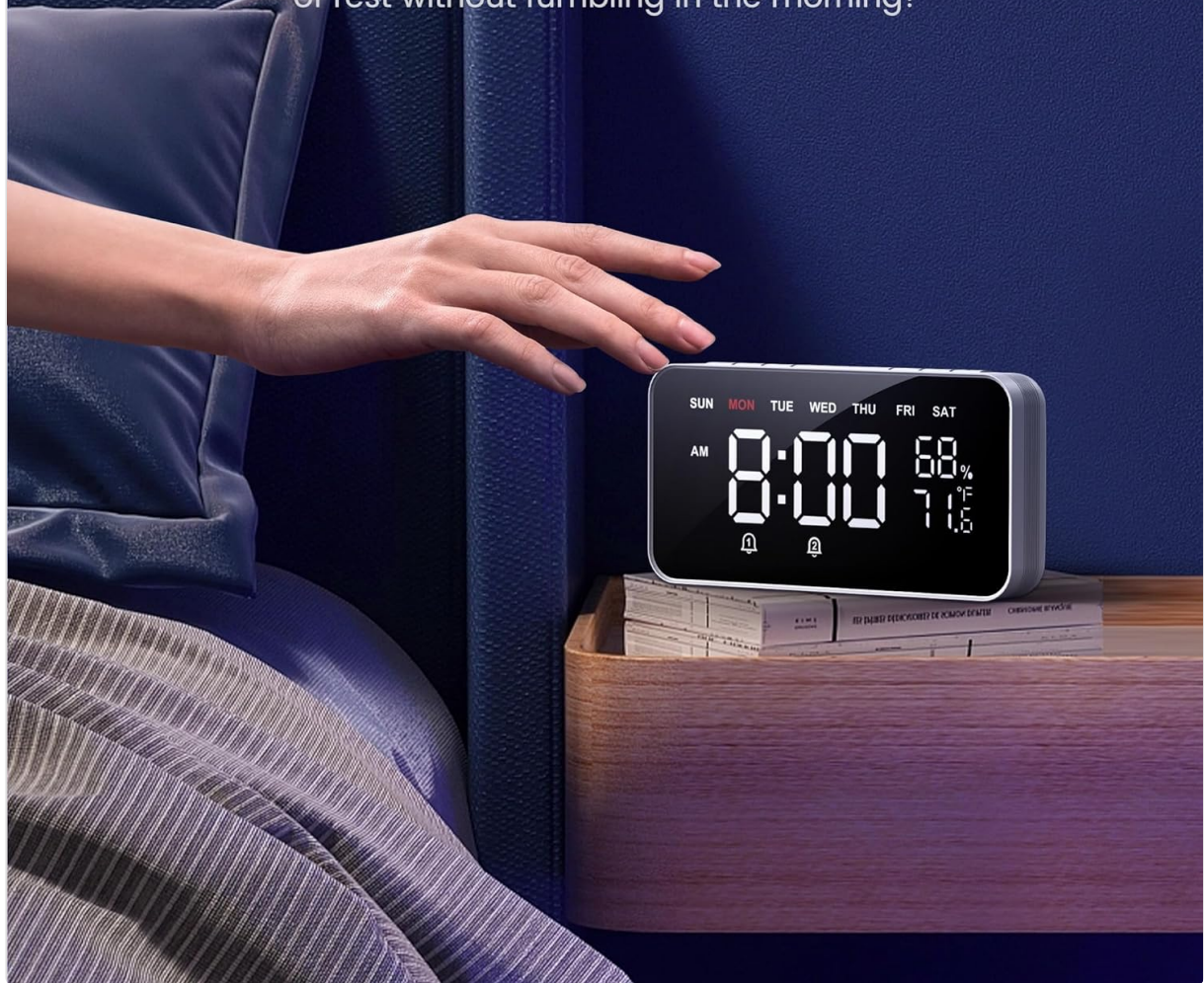
Image: A hand interacting with the large snooze button located on the top of the alarm clock.

Effortlessly snooze with a single tap—enjoy an extra 9 minutes of rest without fumbling in the morning!