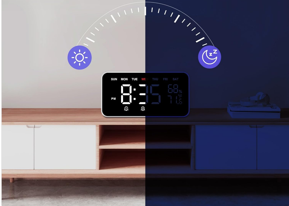
Image: The clock's display demonstrating its auto-dimming capability in varying light environments.

Alternatively, manually adjust brightness or turn off the display entirely.