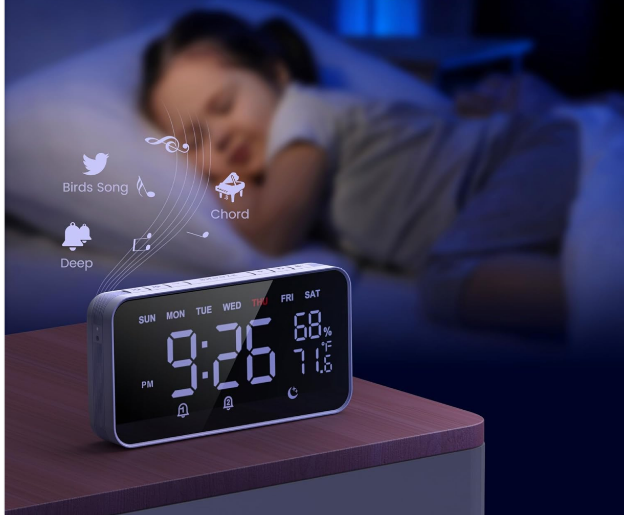
Image: The clock displaying musical notes, indicating the sleep sound function is active.