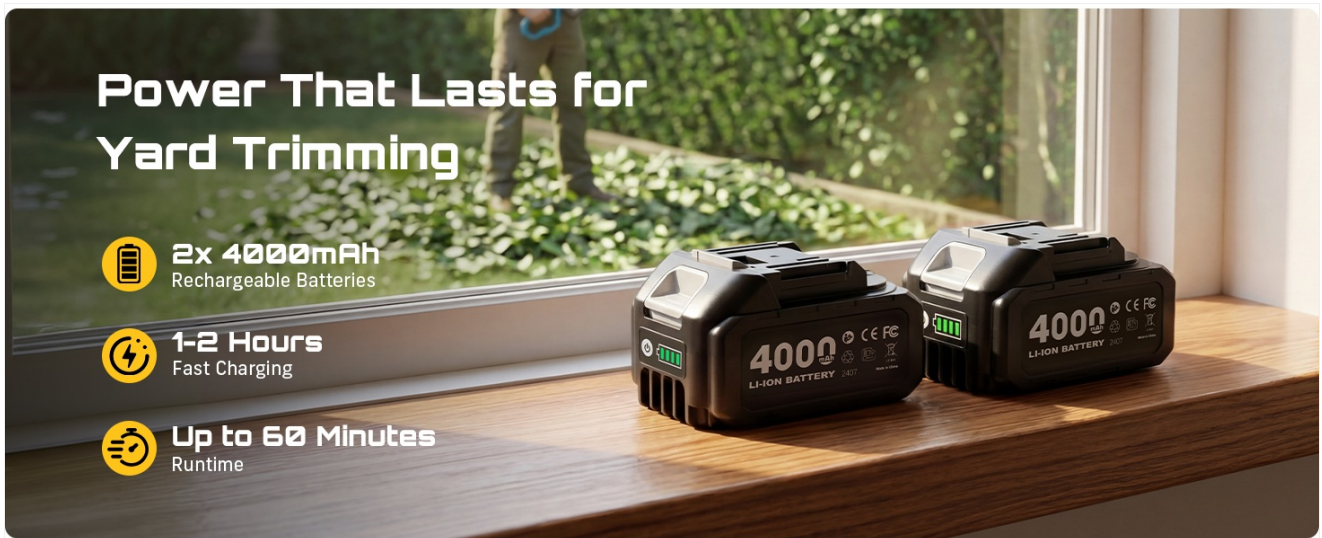
Image: This image highlights the dual 4000mAh batteries, fast charging capability (1-2 hours), and up to 60 minutes of runtime per battery.