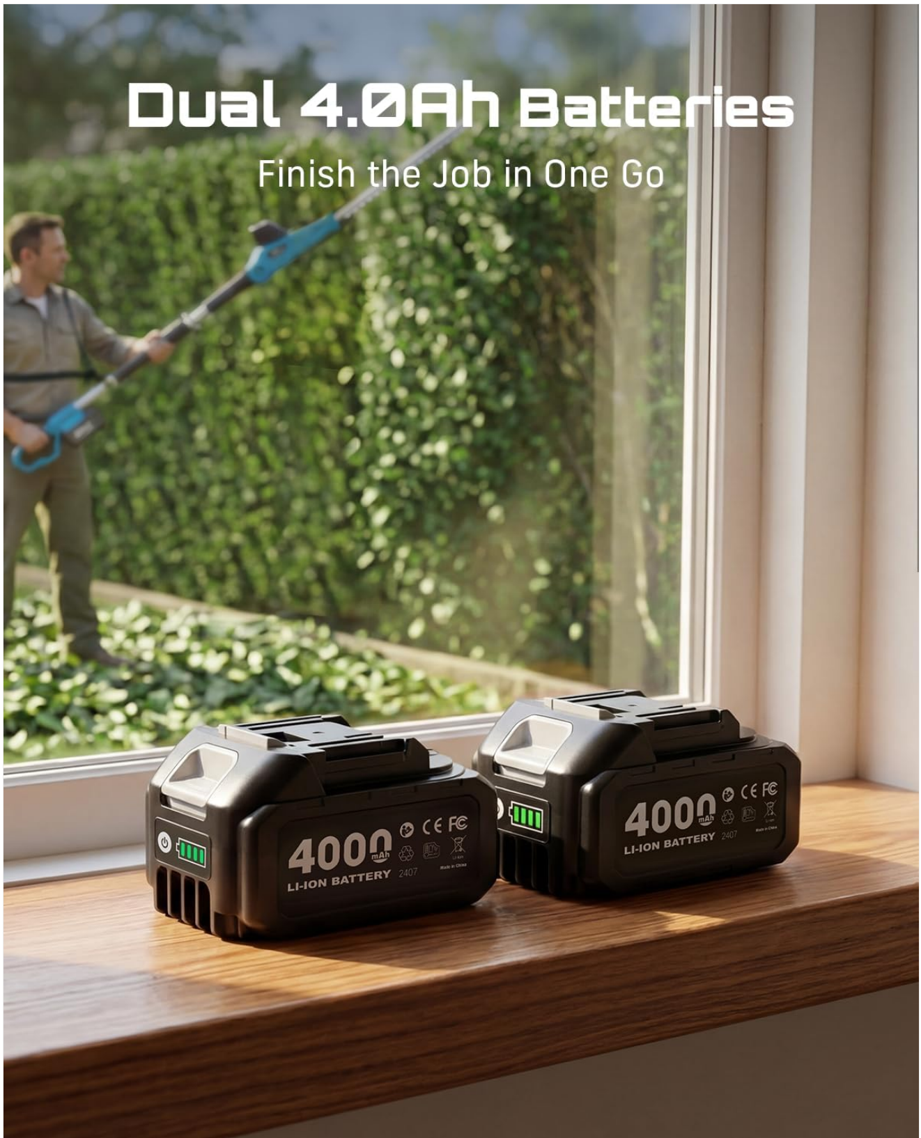
Image: Two 4000mAh lithium-ion batteries, which provide power for the cordless hedge trimmer.