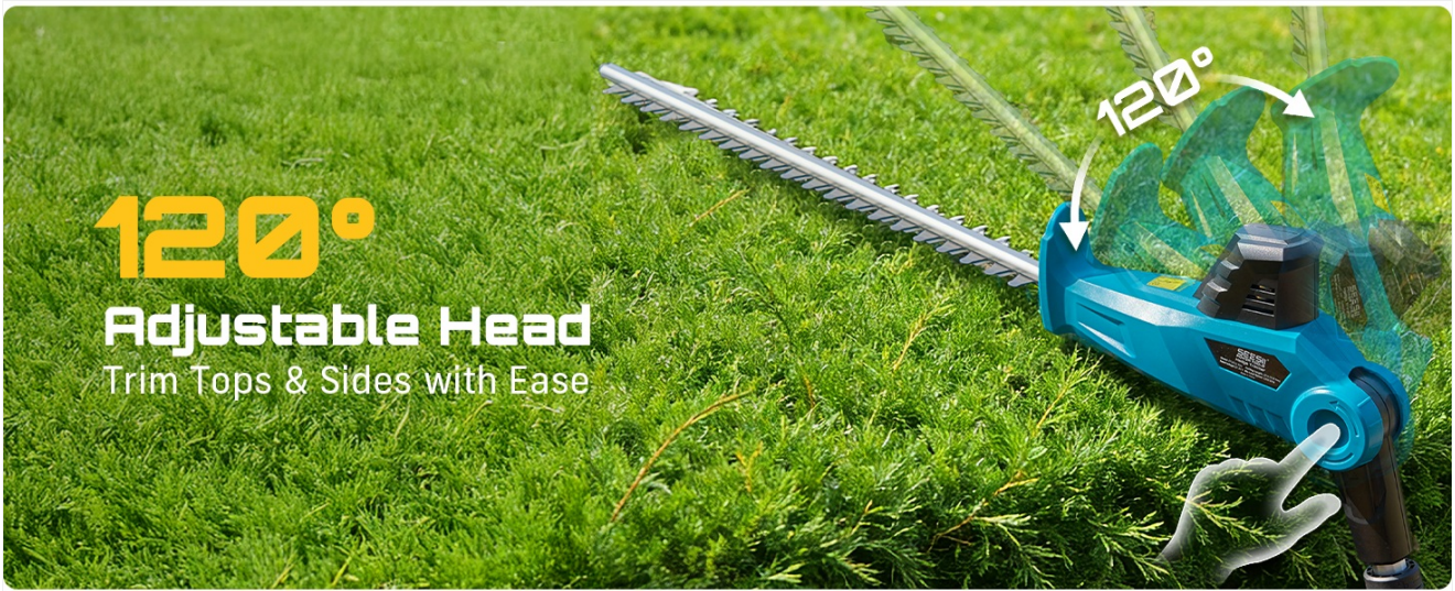
Image: The trimmer head can be adjusted up to 120 degrees, allowing for flexible trimming of hedge tops and sides.