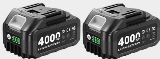
2 x 4.0Ah Rechargeable Batteries