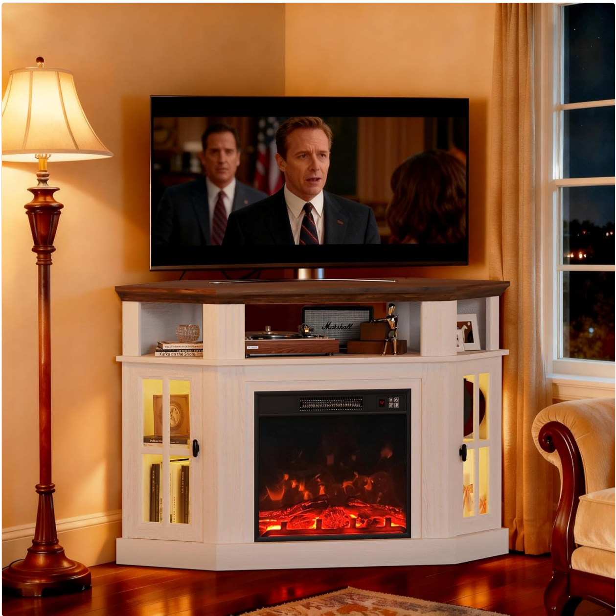
Image 5.1: The electric fireplace showing its 3D flame effect and control options.