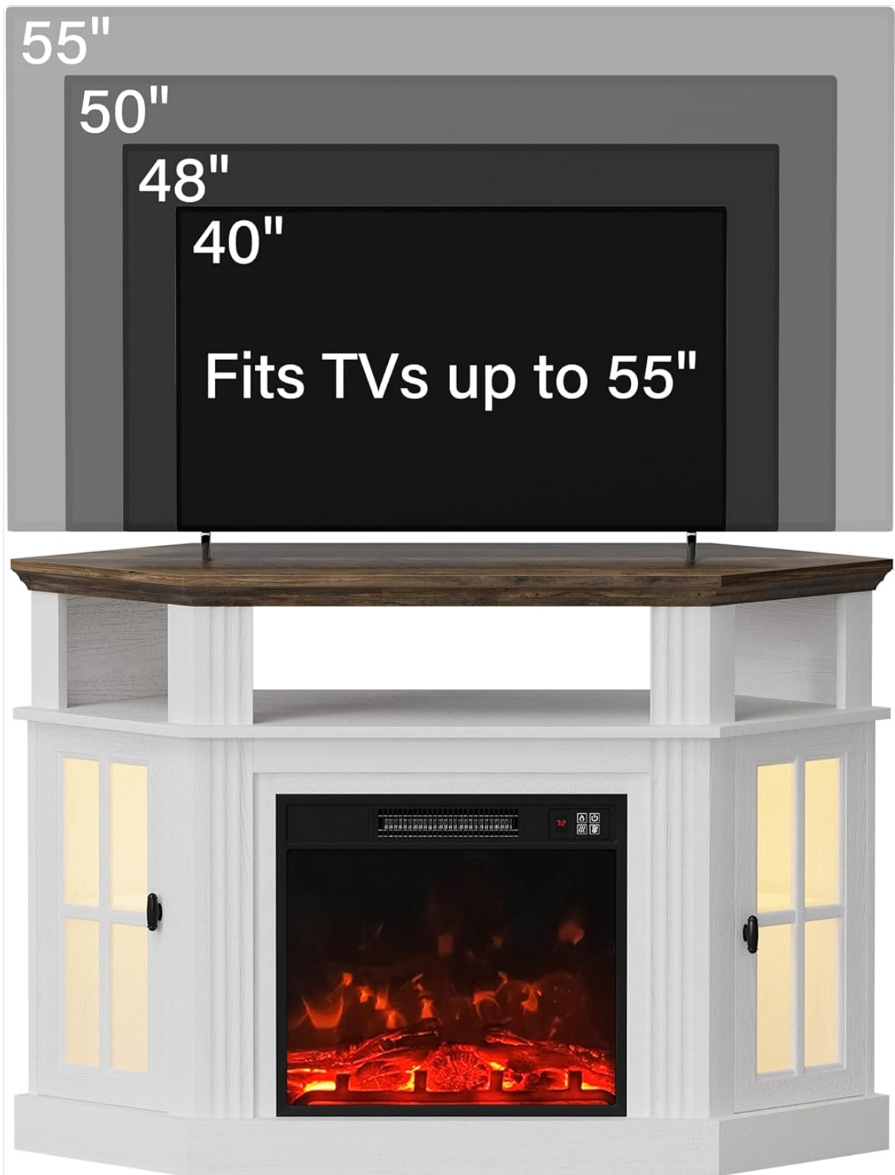
Image 8.2: TV placement options for the stand, accommodating various TV types.