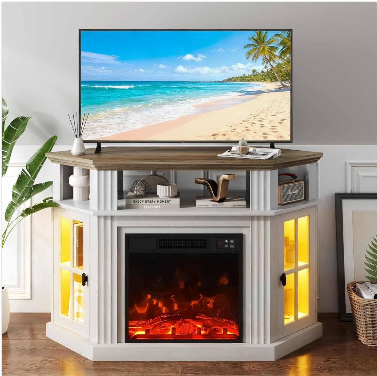
Image 1.1: The YESHOMY LED Corner Fireplace TV Stand, showcasing its design and integrated fireplace.