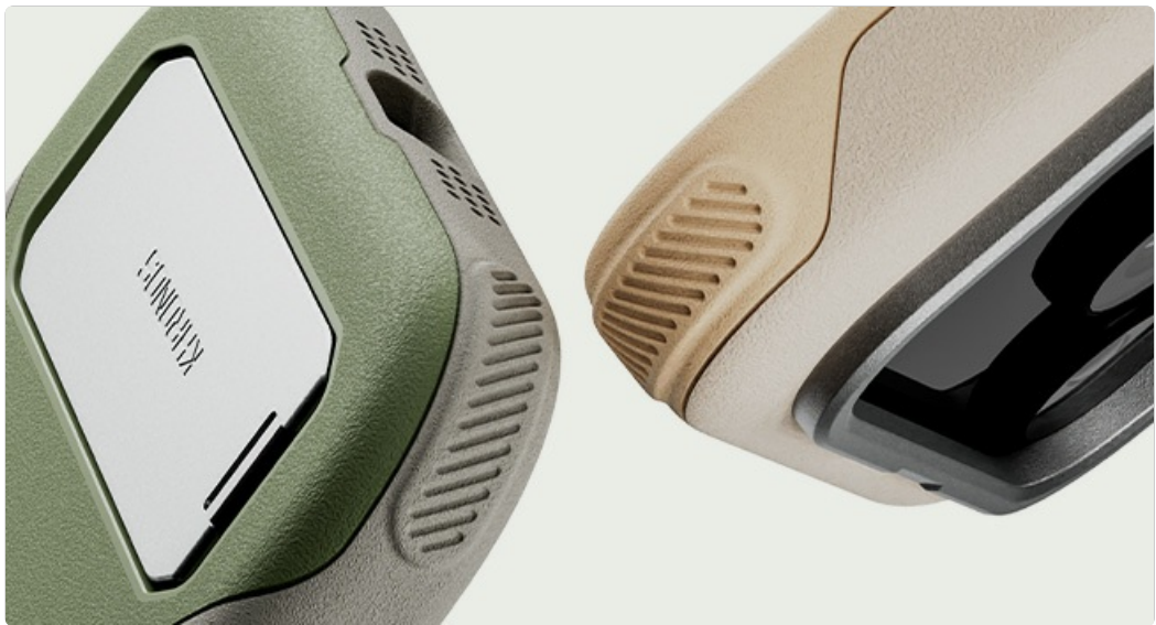
Figure 5.1: Reinforced corners provide additional protection against impacts.