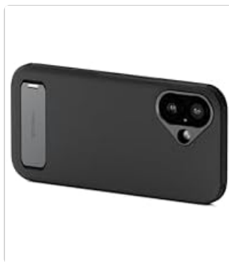
Figure 4.4: The case's design facilitates attachment of external lenses and other camera accessories.

The Khronos Lite Case is designed to be lightweight while providing a robust platform for mobile filmmaking. Its magnetic backplate ensures strong magnetic attachment for various camera-related accessories, making your iPhone 17 ready for professional-grade content creation.