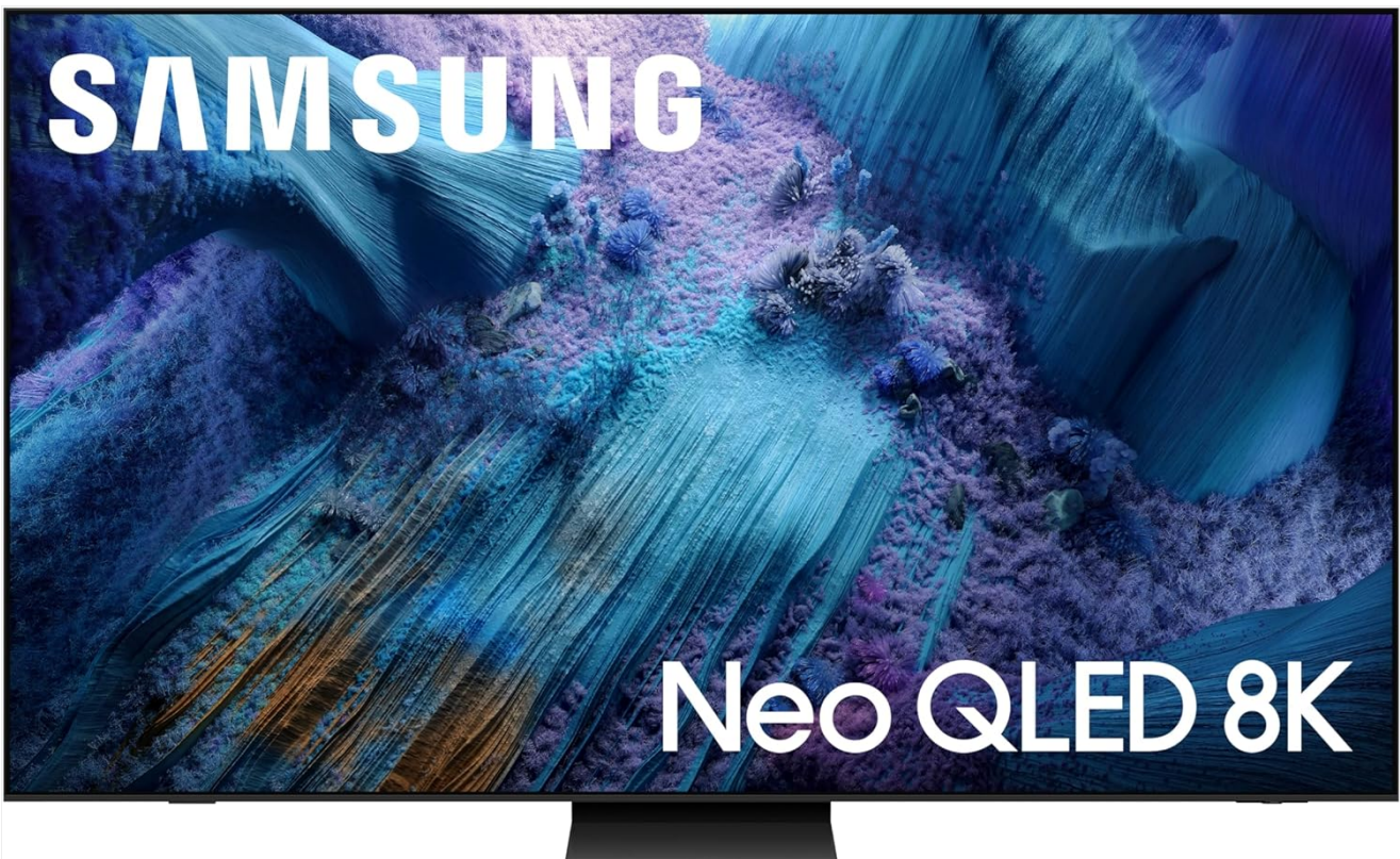
Figure 1: Front view of the Samsung QN65QN990FFXZA 65 Inch QN990F Neo QLED 8K TV.

Welcome to the user manual for your Samsung QN65QN990FFXZA 65 Inch QN990F Neo QLED 8K TV. This document provides essential information for setting up, operating, maintaining, and troubleshooting your television. Please read these instructions carefully to ensure proper use and to maximize your viewing experience.