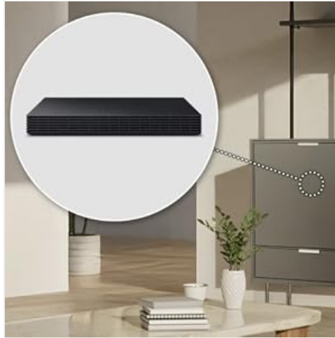
Figure 2: Wireless One Connect Box for streamlined connections.

The Samsung QN990F utilizes a Wireless One Connect Box to manage all external connections, reducing cable clutter around the TV. Connect all your devices to this box.