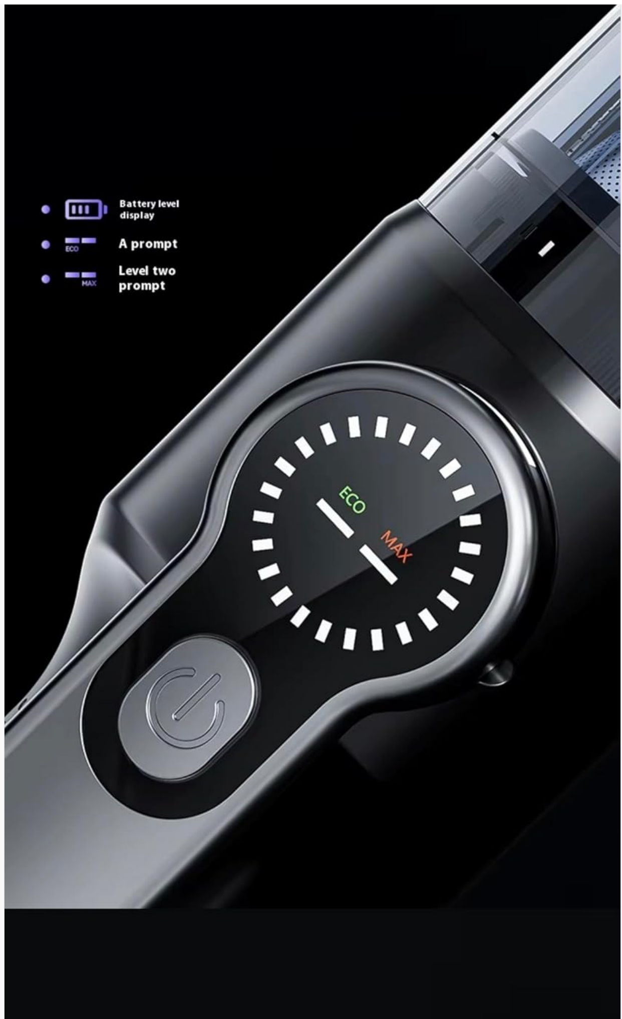
Figure 2: Digital display screen for real-time monitoring of battery level and power modes.