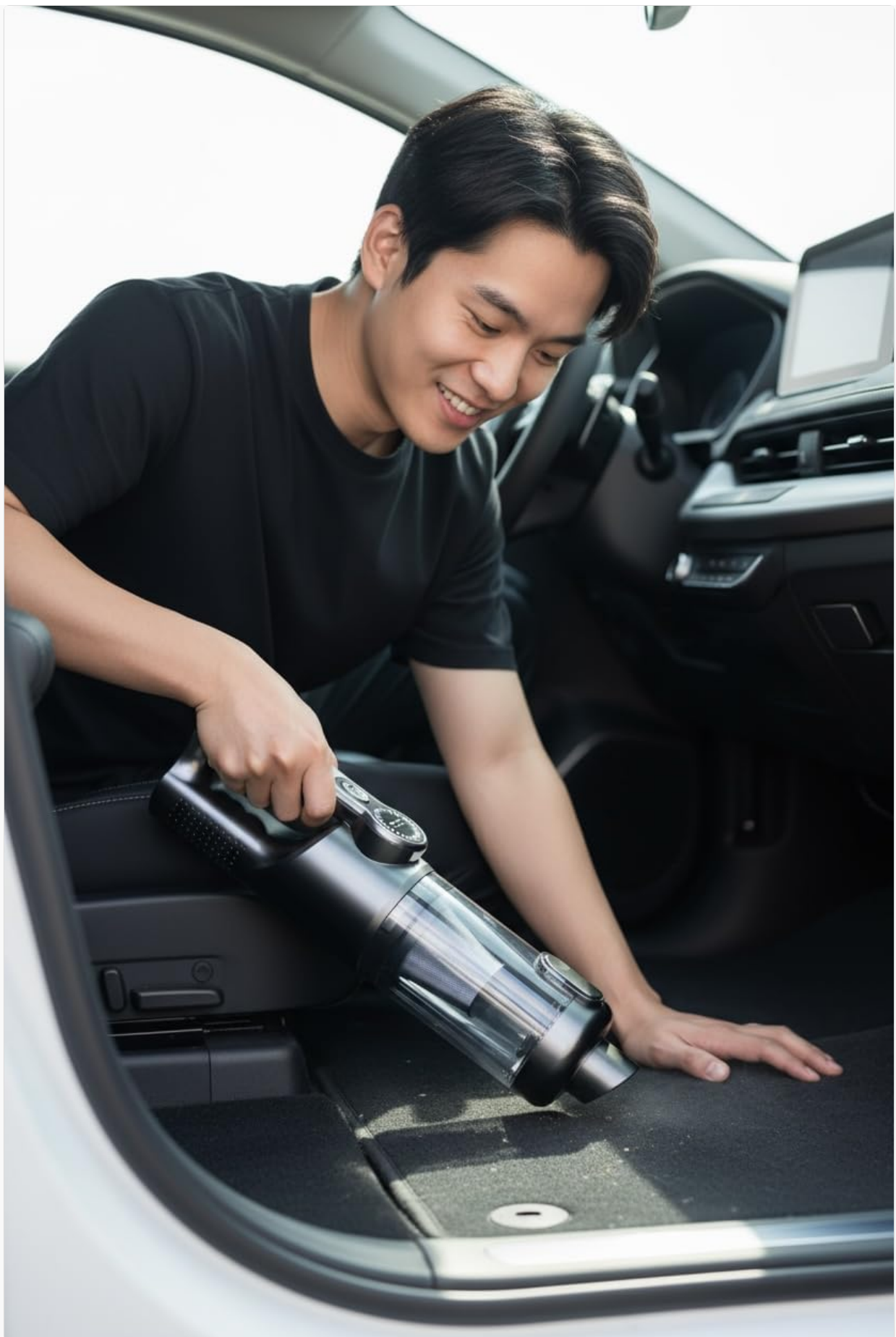
Figure 3: The ST-126 Plus is ideal for cleaning car interiors.