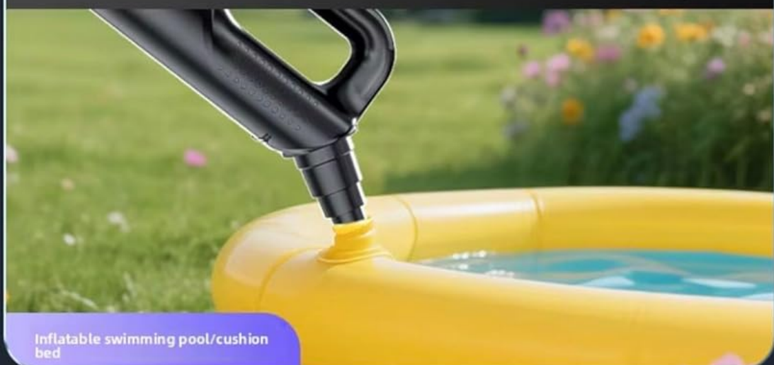
Figure 6: Inflatable nozzles for various items.