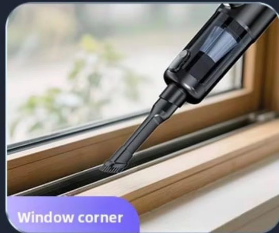
Figure 4: Using the long flat nozzle and brush for detailed cleaning.