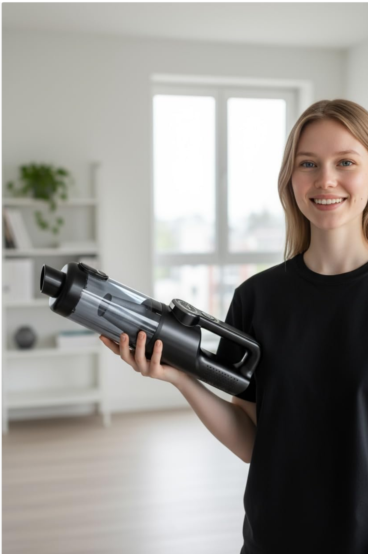
Figure 1: The ST-126 Plus handheld vacuum cleaner, showcasing its compact design.

Digital display screen, real-time monitoring, visibly clear