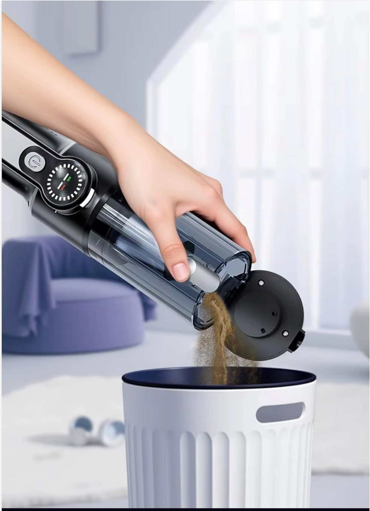
Figure 7: Emptying the dustbin.