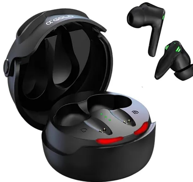
Figure 3: Earbuds in charging case.