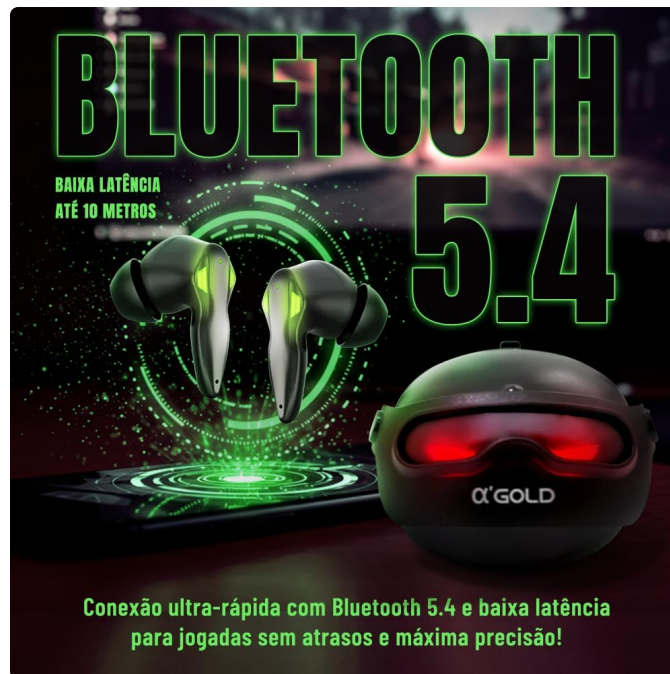
Figure 5: Bluetooth 5.4 connectivity.