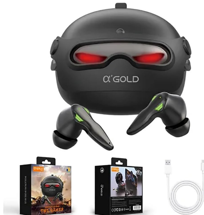
Figure 1: A'Gold FN-B48 Earbuds and accessories.

The A'Gold FN-B48 TWS Bluetooth 5.4 Gamer Earbuds are designed to provide an immersive audio experience with advanced features for gaming, music, and calls. This manual provides essential information on setting up, operating, and maintaining your earbuds to ensure optimal performance.