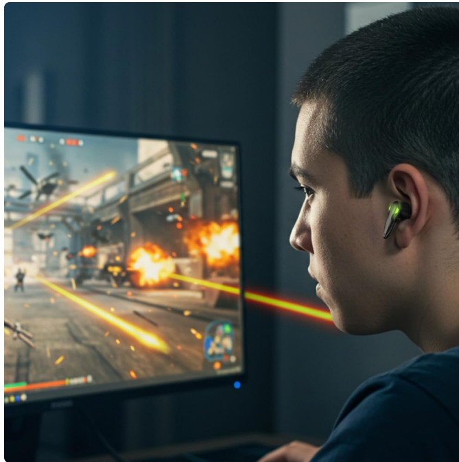
Figure 6: Gaming with A'Gold FN-B48 Earbuds.