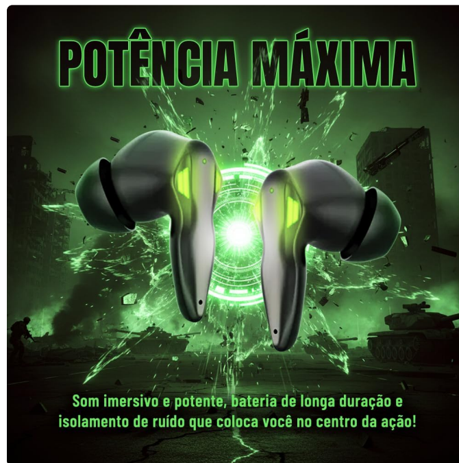
Figure 2: Immersive sound experience.

The A'Gold FN-B48 earbuds feature Bluetooth 5.4 for a stable and efficient wireless connection. They incorporate AI Noise Cancellation to minimize external interference, providing clearer audio for an immersive experience. An integrated microphone ensures clear communication during calls, gaming, or streaming. The ergonomic in-ear design offers lightweight comfort for extended use. The unique charging case features a robotic LED display , adding a distinctive gamer aesthetic. The product is ANATEL certified (10184-24-15069), ensuring quality and safety standards.