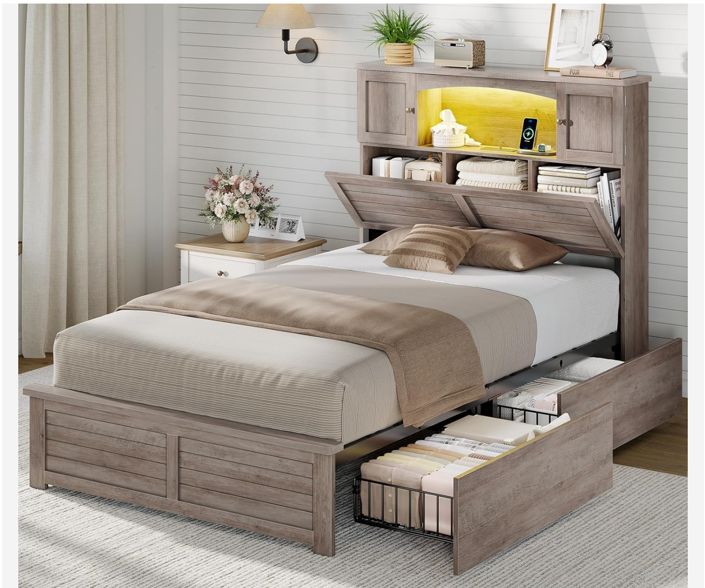
Image: Overall view of the MSmask Farmhouse Twin Bed Frame in grey, showcasing the bookcase headboard, LED lighting, and open storage drawers.