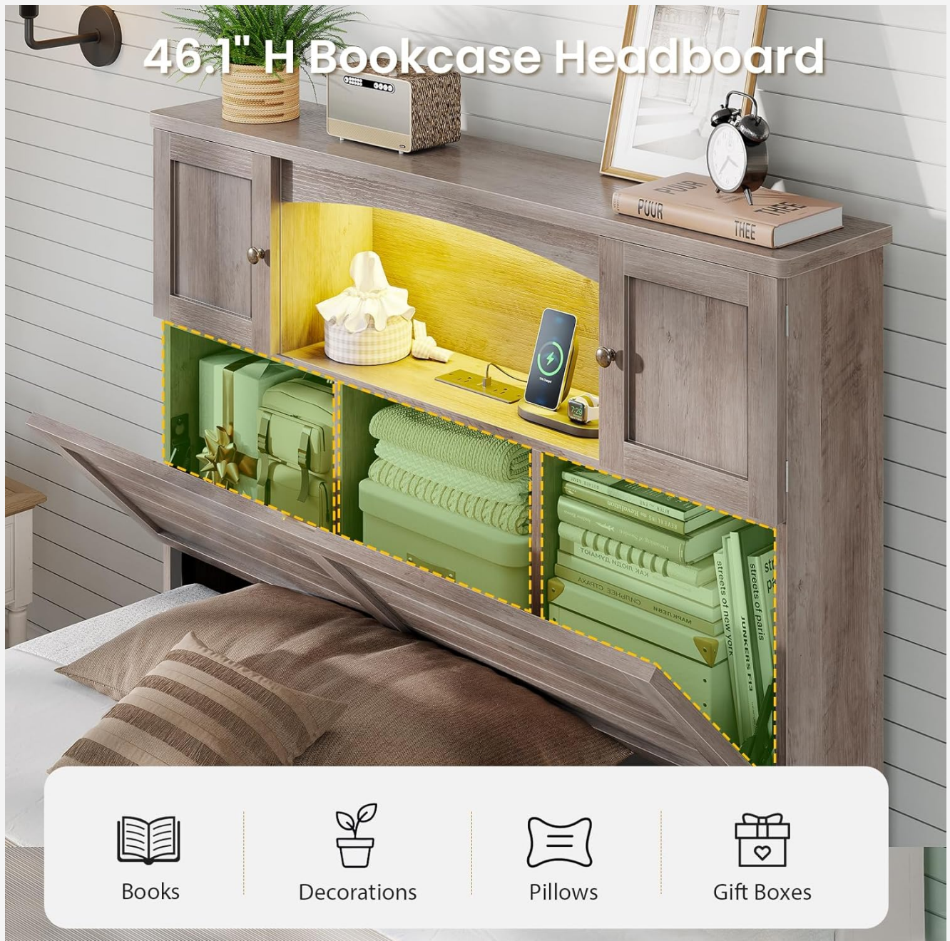
Image: Close-up view of the bookcase headboard, showing open compartments for books, decorations, pillows, and gift boxes.

The headboard features two cabinets and three large hidden compartments, ideal for storing books, pillows, and other bedside essentials. The top platform also provides additional display or storage space.