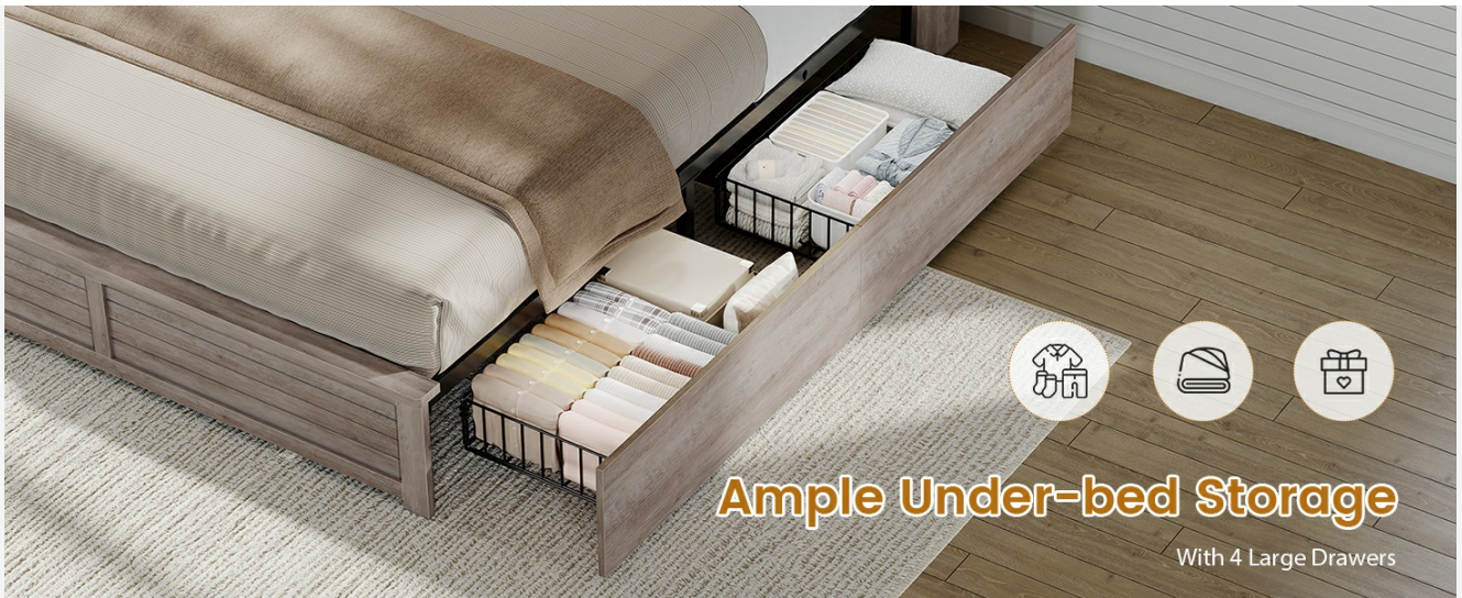
Image: View of the four large under-bed storage drawers, demonstrating their capacity for various items like clothing and linens.