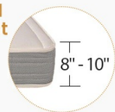
Image: Diagram illustrating the stable and sturdy structure of the bed frame, highlighting noise-free EVA strips, easy-to-assemble slats, embedded design, and recommended mattress height.