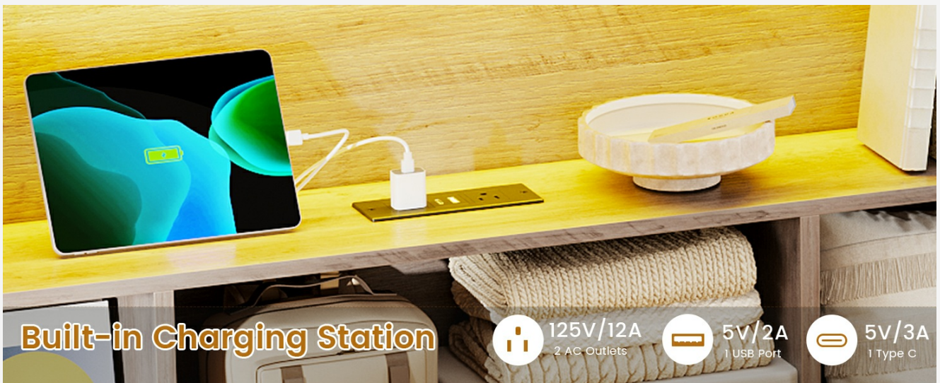
Image: Close-up of the built-in charging station on the headboard, showing the AC outlets, USB port, and Type-C port in use with a tablet.

Simply plug your devices into the appropriate ports for charging. Ensure the bed frame is connected to a power source.