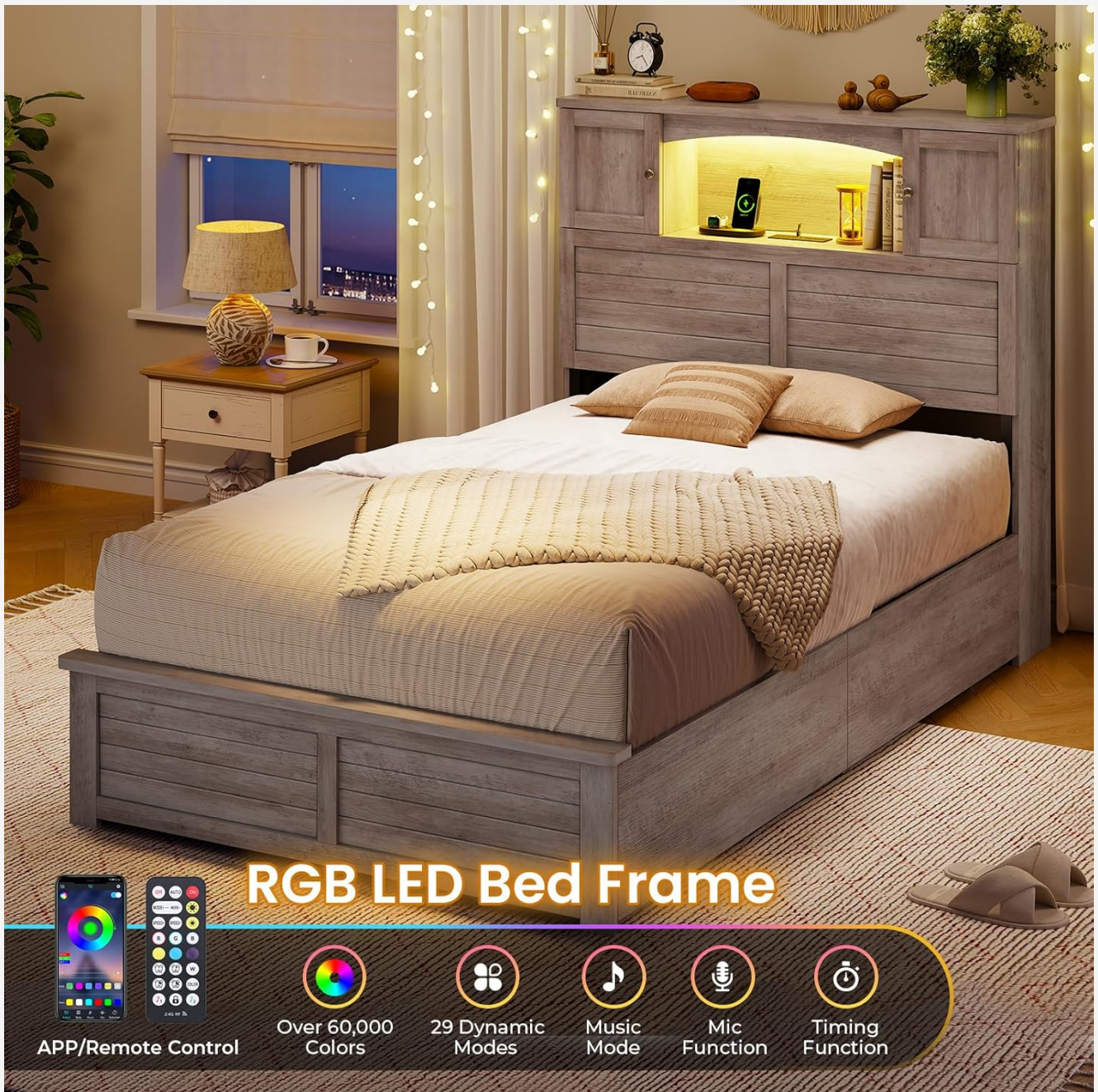
Image: The MSmask bed frame illuminated by its RGB LED lights, showcasing the various control options like APP/Remote Control, over 60,000 colors, dynamic modes, music mode, mic function, and timing function.