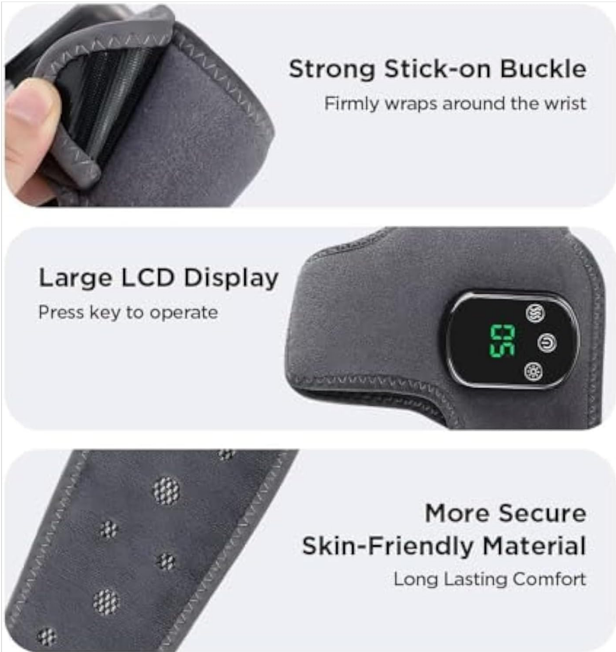
Image: Details of the foot massager, highlighting the secure buckle, clear LCD screen, and comfortable fabric.