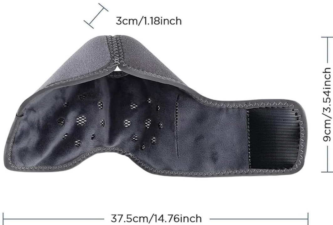
Image: Product dimensions for the foot massager.