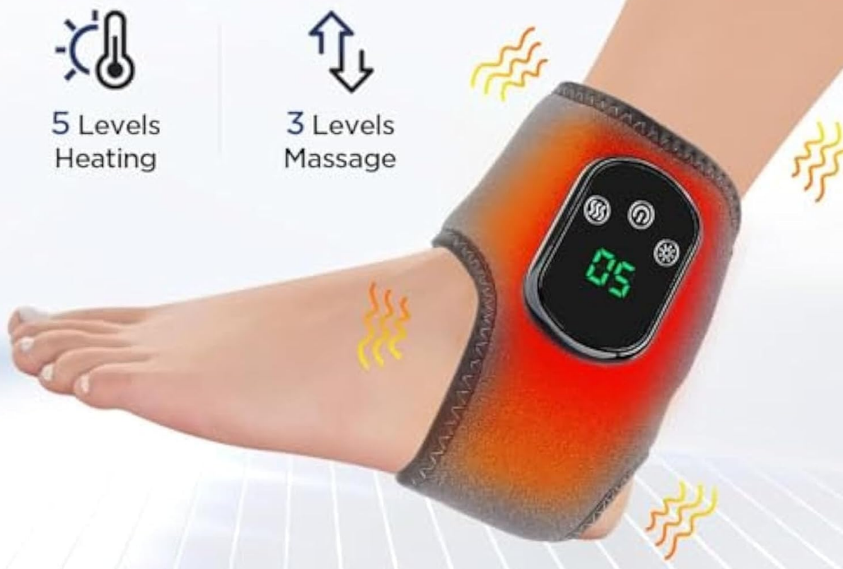
Image: The foot massager in use, demonstrating its multi-gear adjustment capabilities for heating and massage.