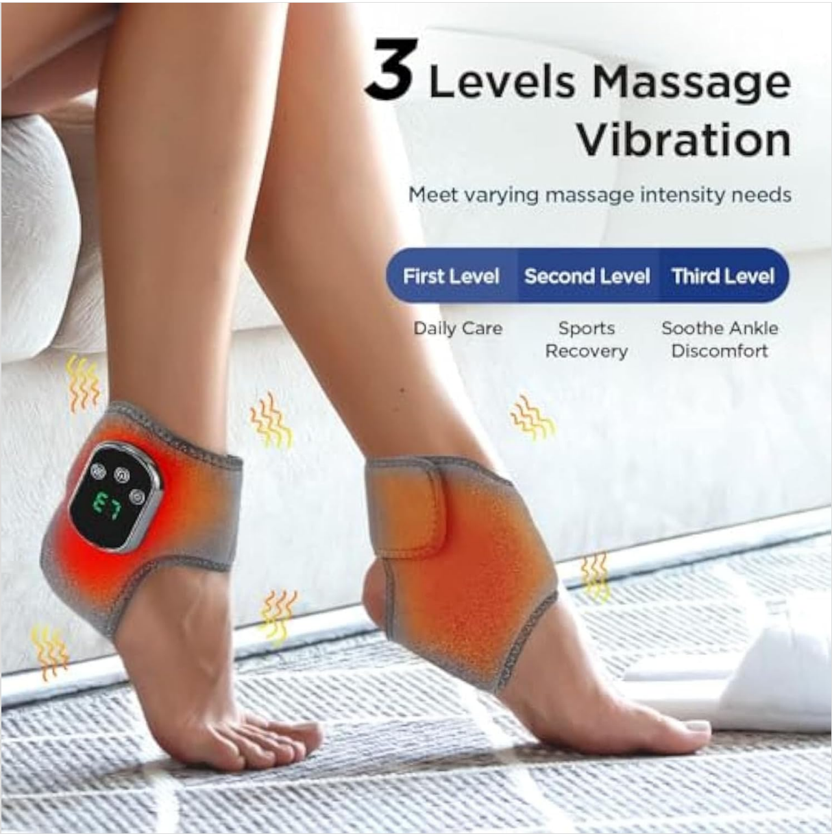
Image: Illustration of the 3 levels of massage vibration, catering to different needs from daily care to sports recovery and ankle discomfort relief.