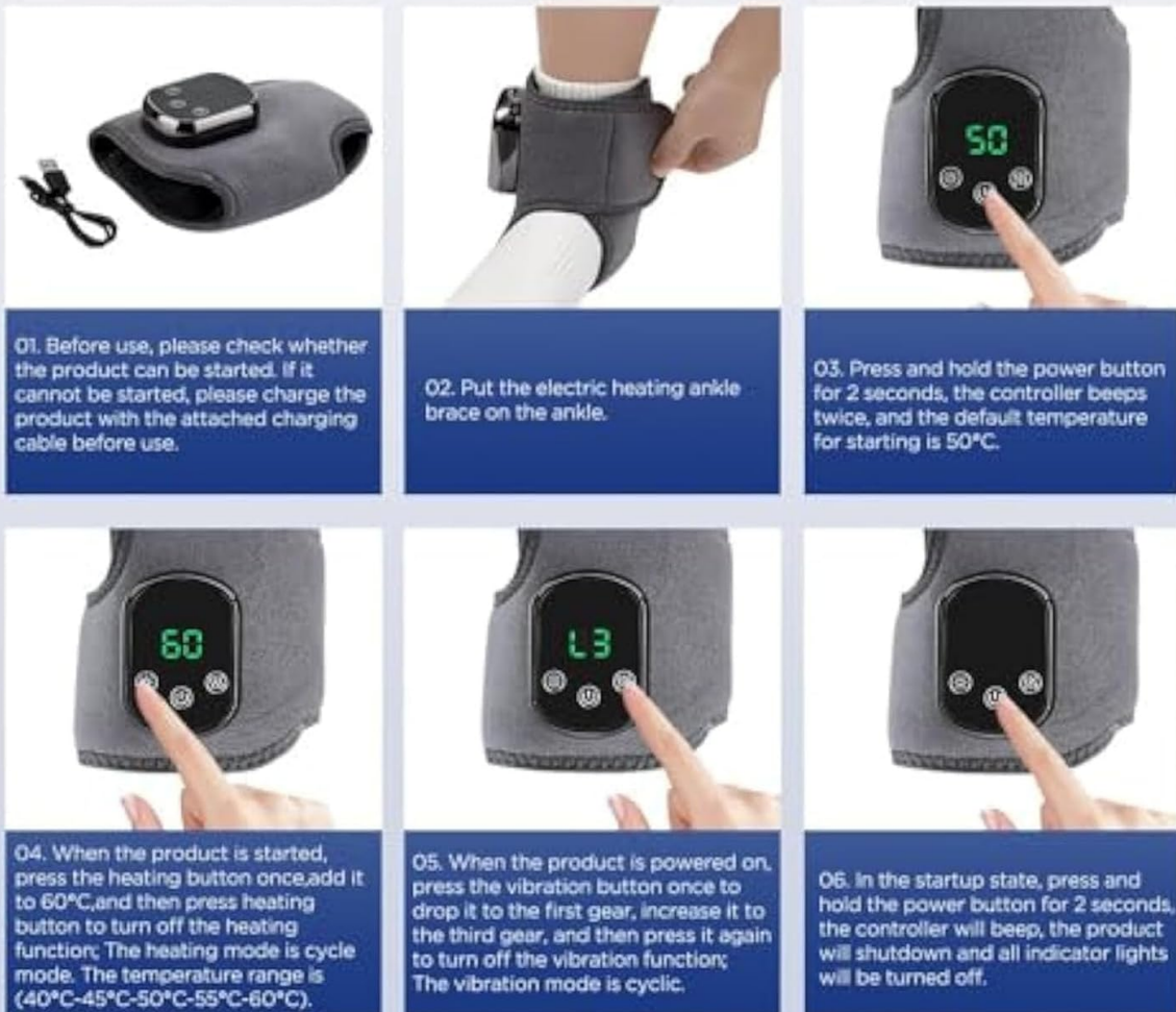
Image: Steps for initial charging and placing the foot massager on the ankle.