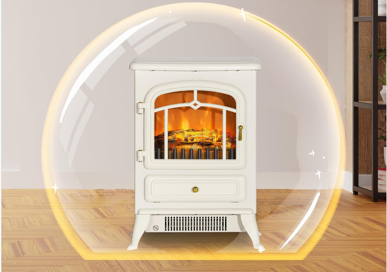
Figure 1: Overheat Protection Feature. The unit automatically shuts off if it detects overheating, ensuring user safety.