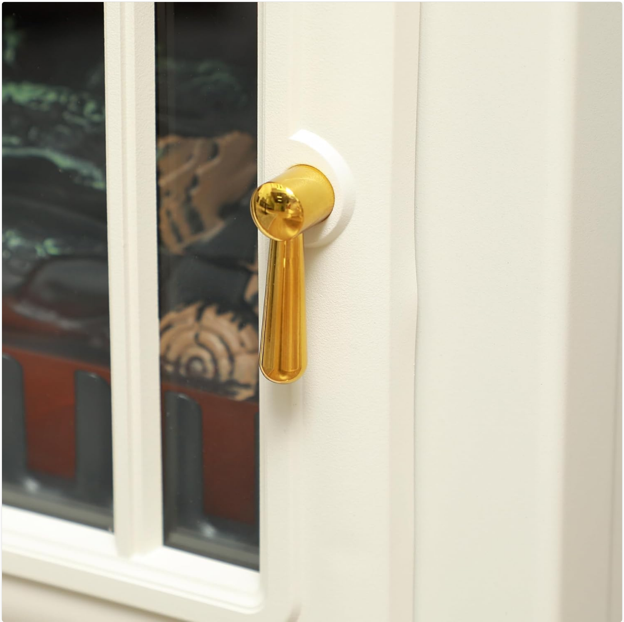
Figure 3: Close-up of the decorative door handle.