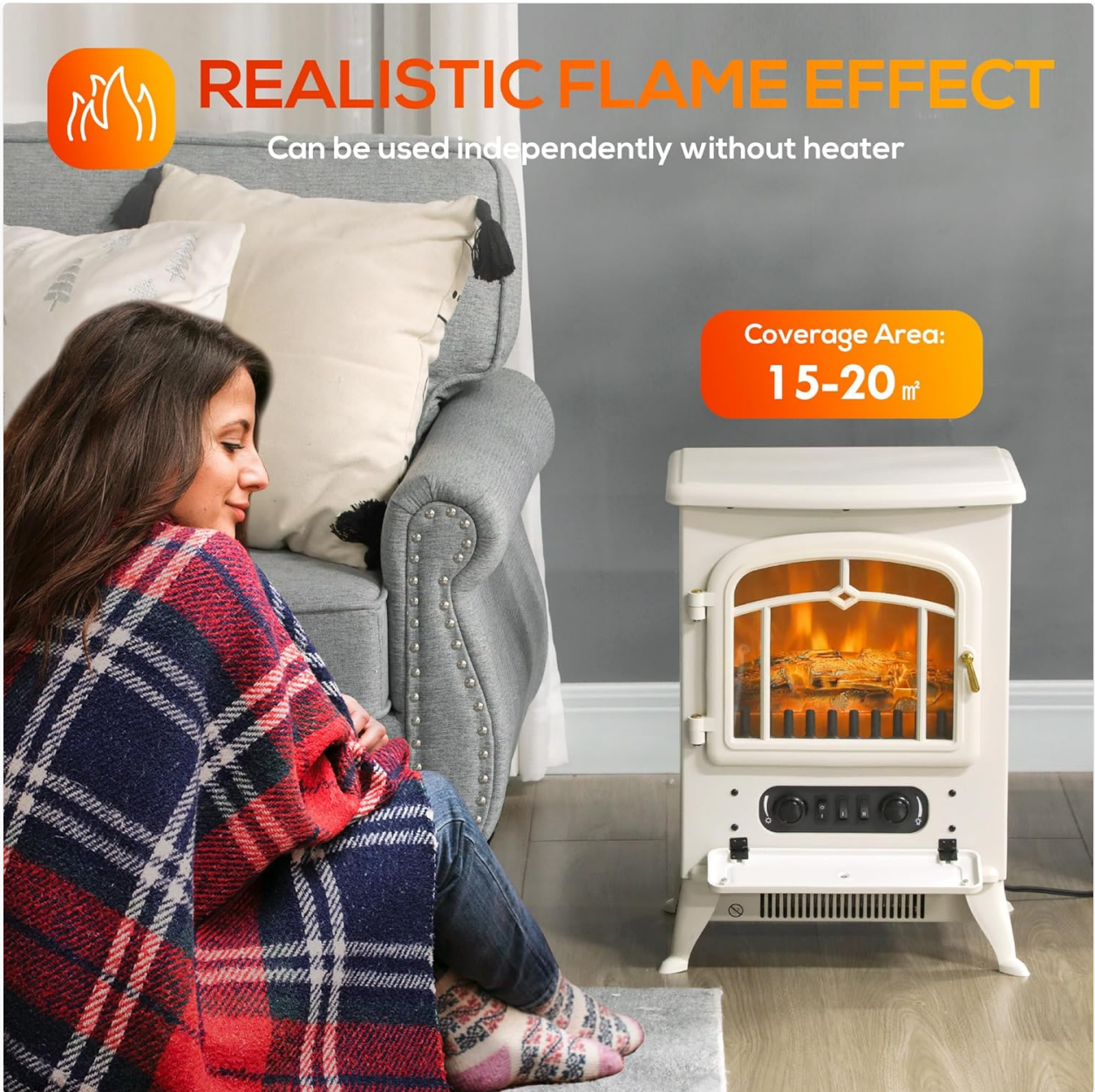
Figure 6: The fireplace provides warmth for a coverage area of approximately 216 sq ft (15-20 m 2 ).