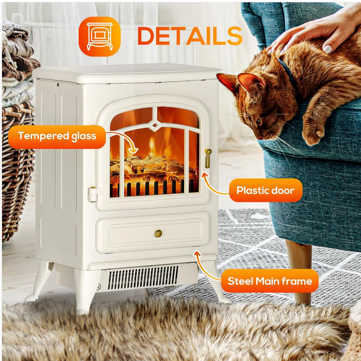
Figure 2: Detailed view of the fireplace components, highlighting the tempered glass, plastic door, and steel main frame.