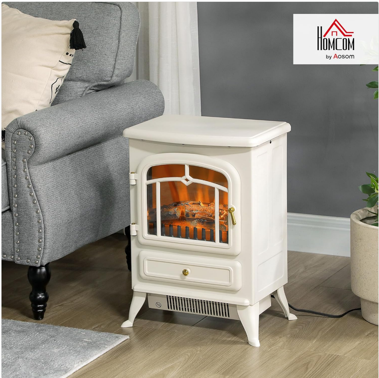
Figure 4: The HOMCOM Electric Fireplace Heater ready for use after assembly.