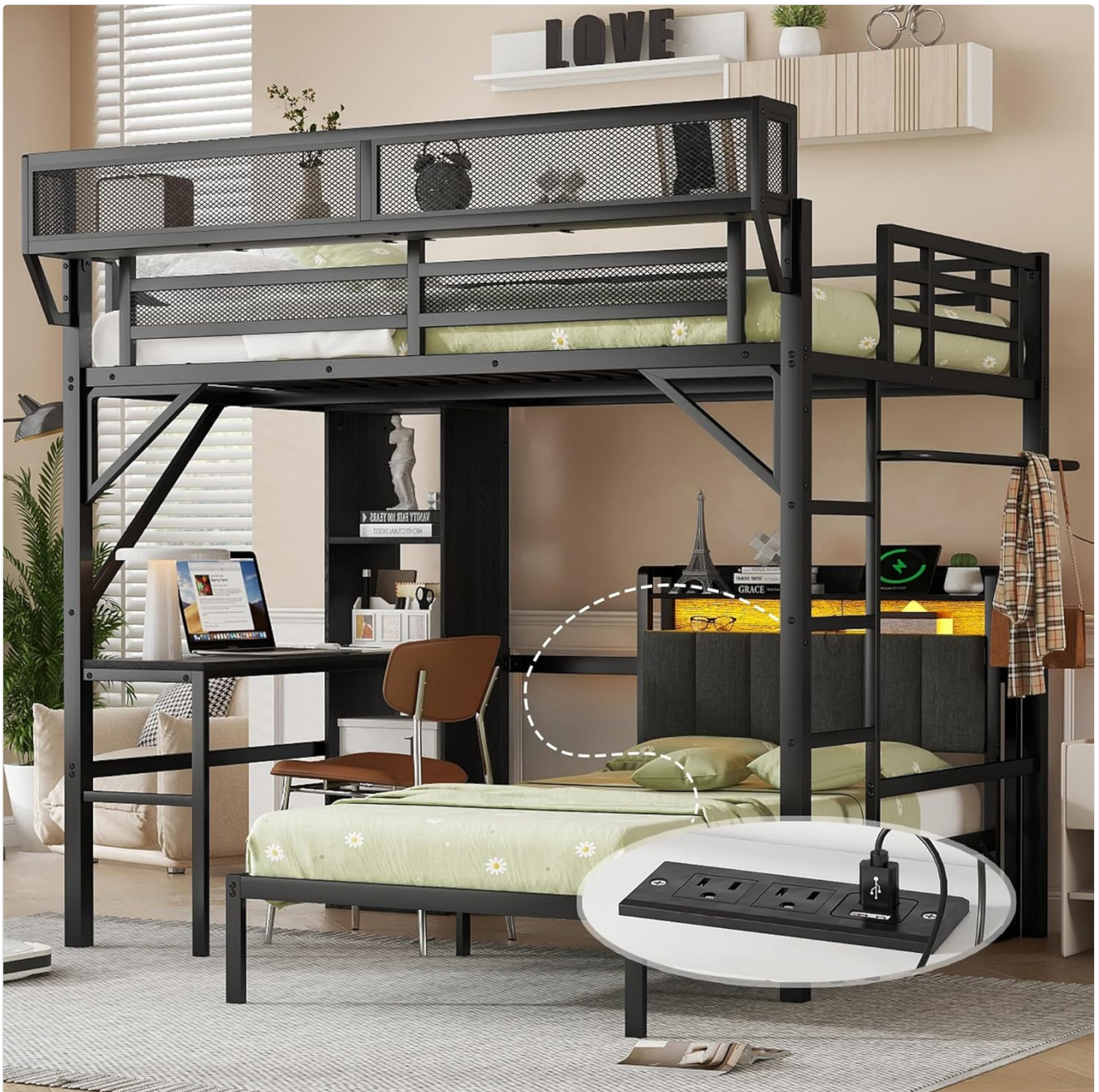
Image 1.1: Overview of the SOFTSEA Full Over Twin Bunk Bed, showcasing the integrated desk, upper bunk with mesh shelf, lower twin bed with headboard, and the USB charging station detail.