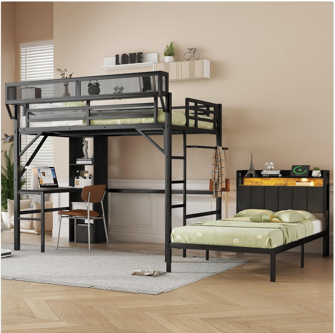
Image 4.2: The SOFTSEA bunk bed reconfigured as a separate loft bed with desk and a standalone twin bed.