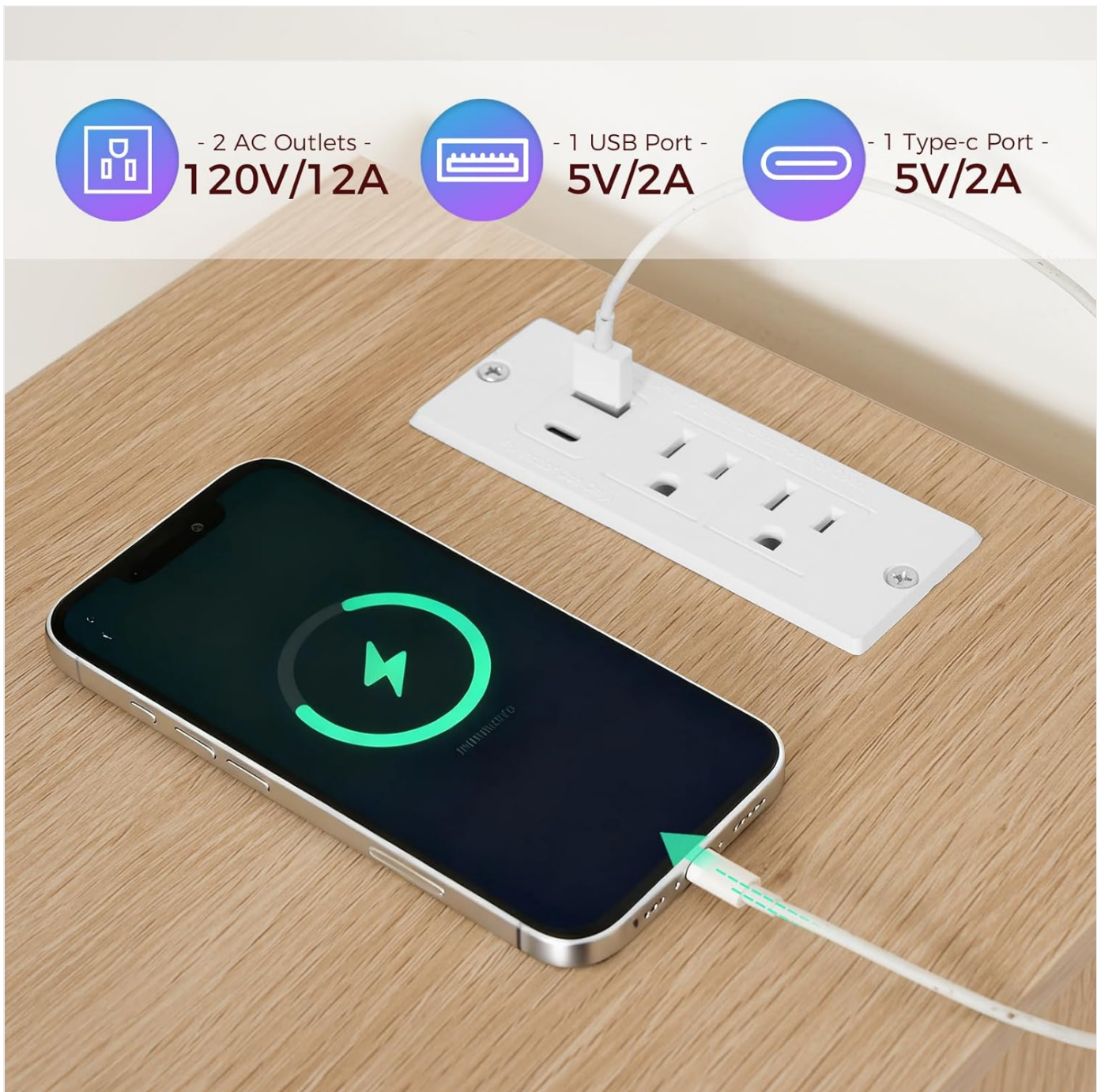
Figure 4.1: Charging station with AC, USB, and Type-C ports.