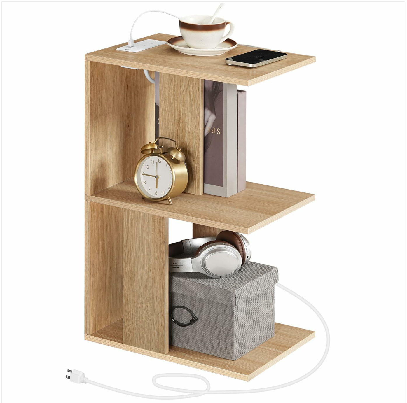
Figure 1.1: MAHANCRIS ETNA18E01 Modern End Table in use.