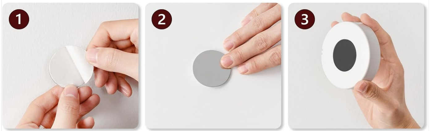
Figure 4.2: Sensor light installation steps.