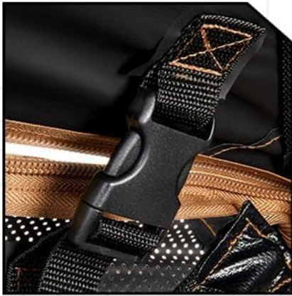
Buckles and Straps on The Door