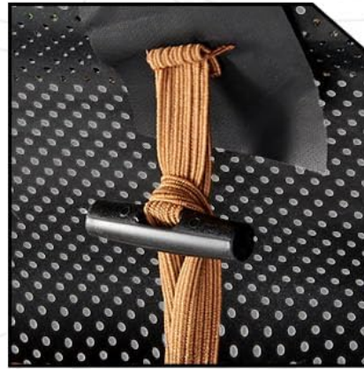
Toggle and Loop Fastening