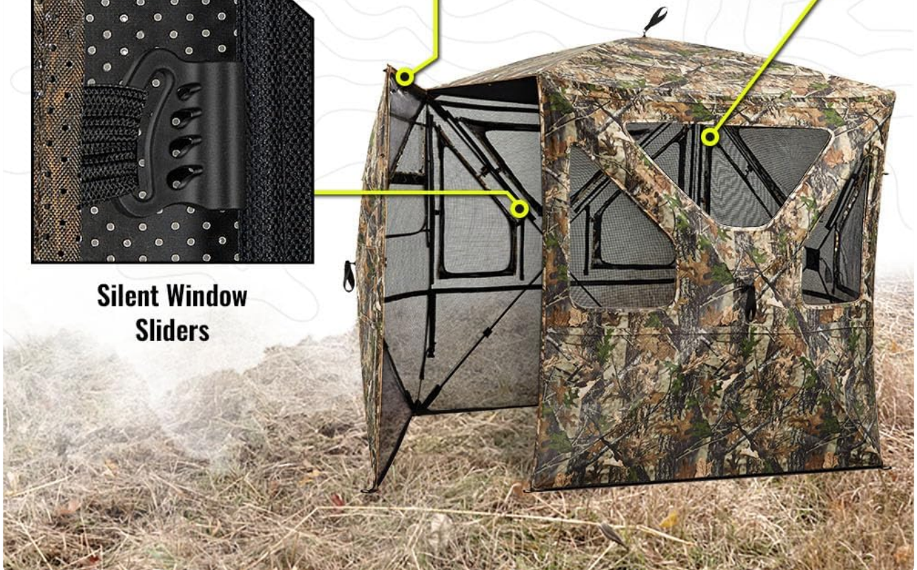
Image: Detailed view of the silent window sliders and door buckles, highlighting the quiet operation features.