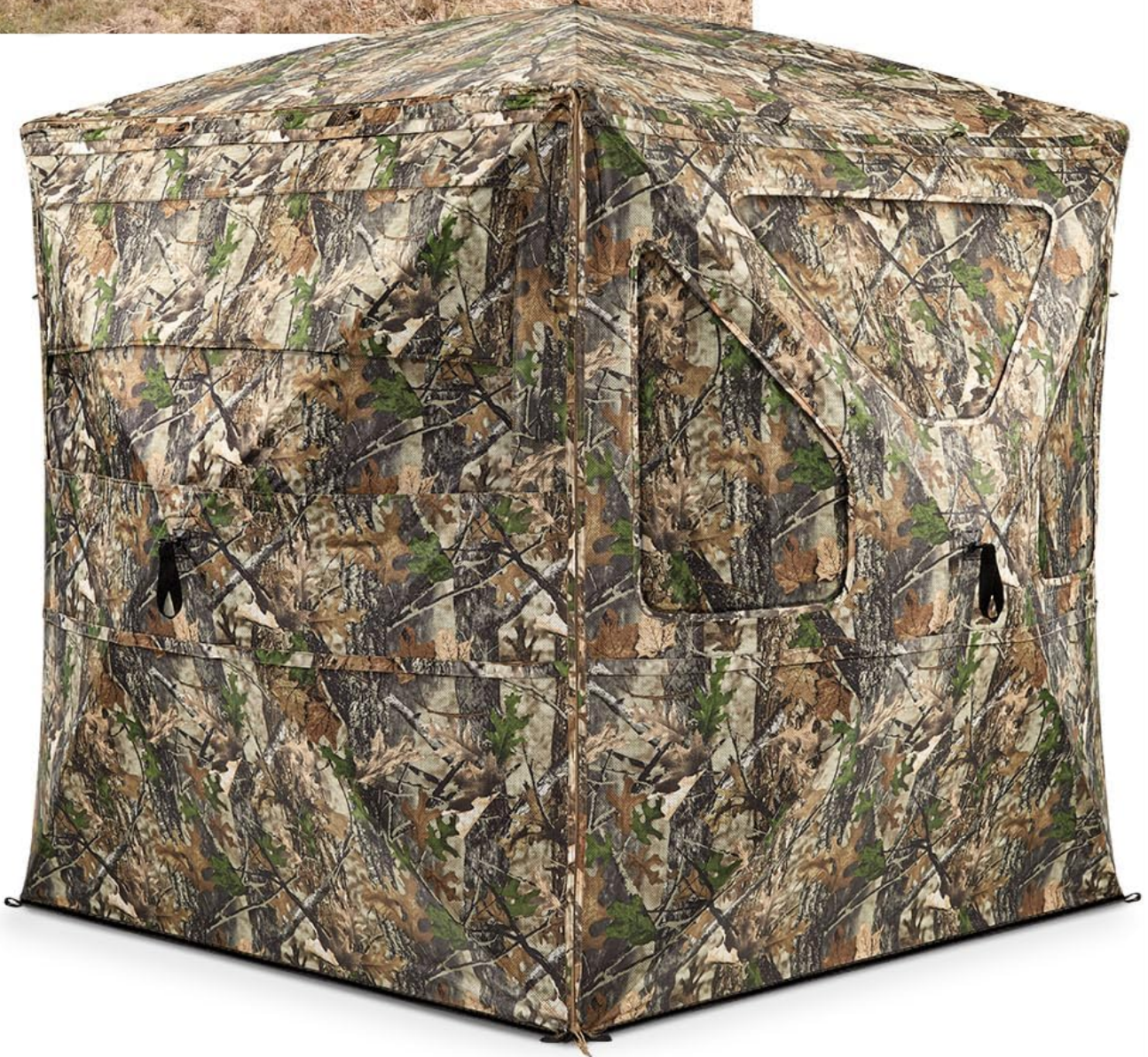
Image: The TIDEWE hunting blind fully erected and camouflaged in a natural outdoor setting.