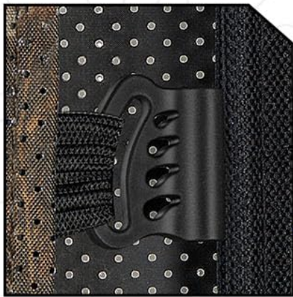
Silent Window Sliders