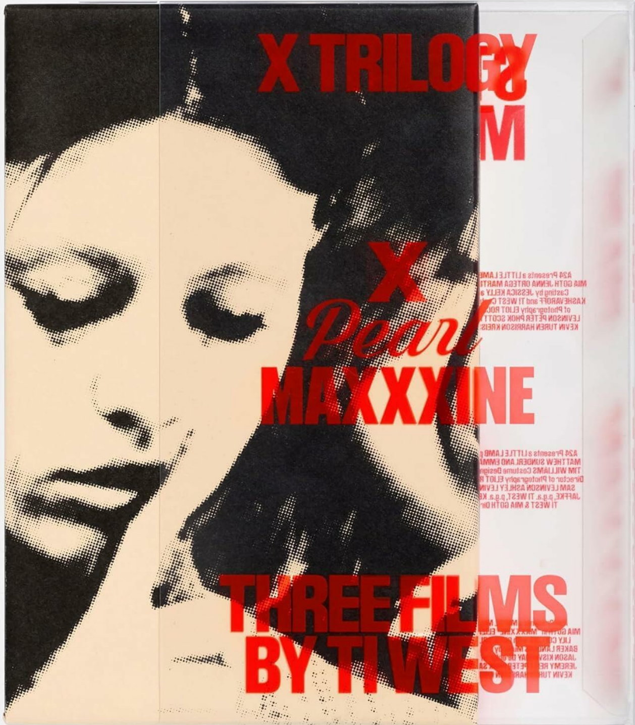
Image: Front cover of The X Trilogy 4K UHD Collector's Edition box set.