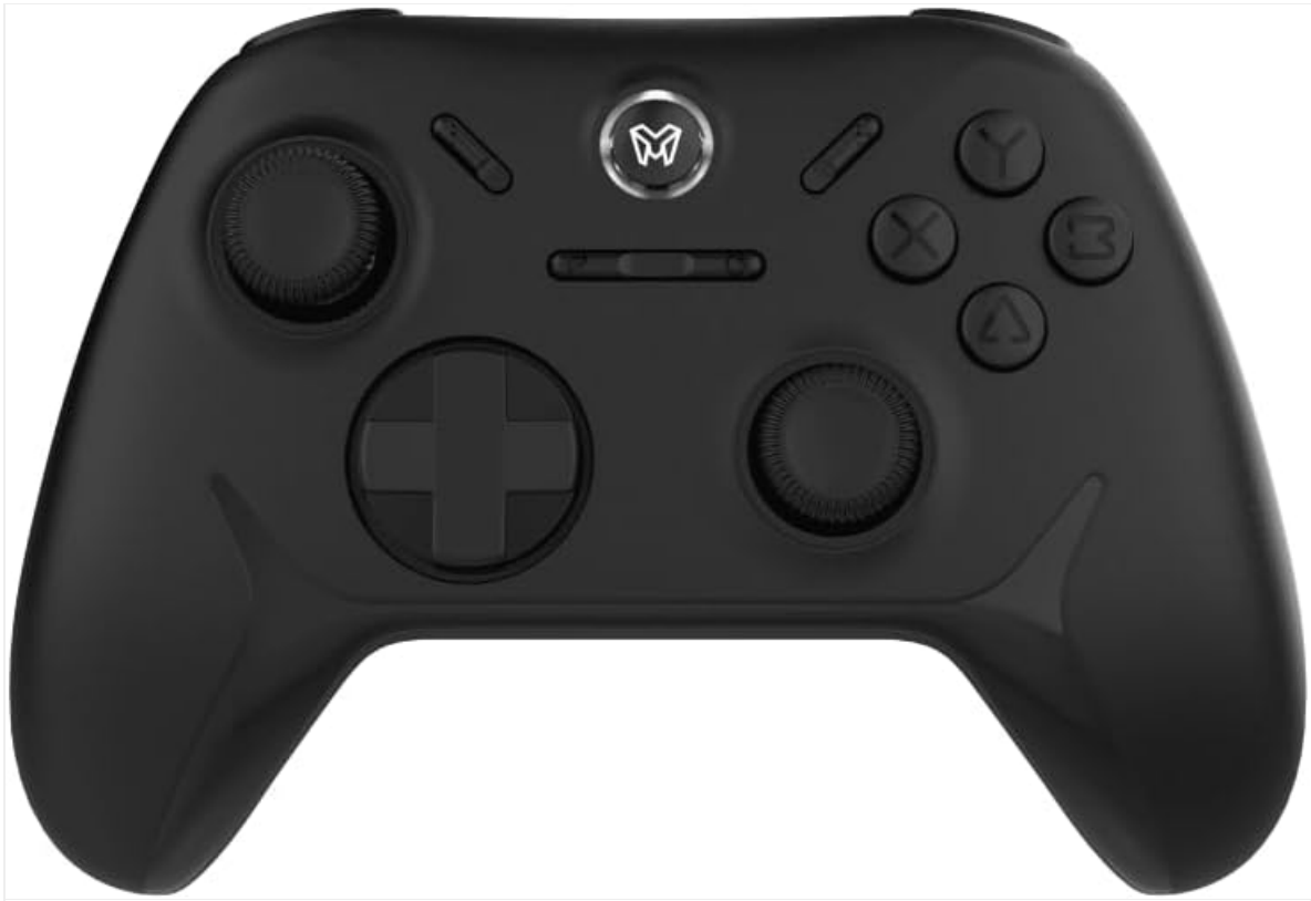
Figure 1: Front view of the EMG Artek Black Flame PX01 Wireless Game Controller, showing joysticks, D-pad, action buttons (A, B, X, Y), and central function buttons.