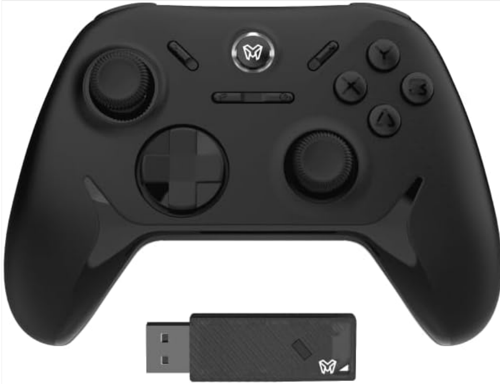
Figure 3: The PX01 controller shown with its accompanying USB 2.4GHz wireless receiver.