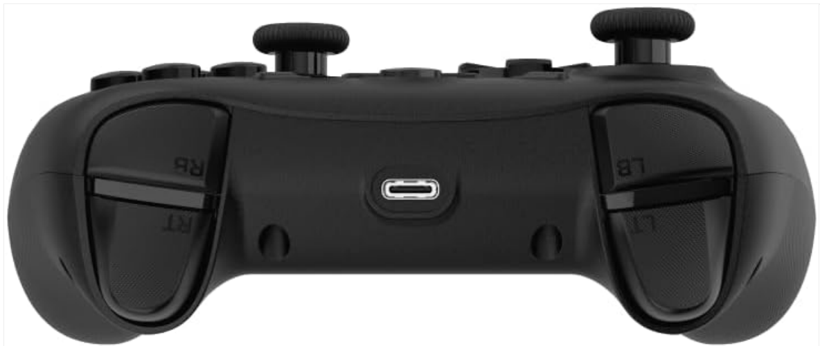
Figure 2: Top view of the controller, highlighting the USB-C charging port located between the shoulder buttons (LB, RB) and triggers (LT, RT).

Familiarize yourself with the buttons and their functions: