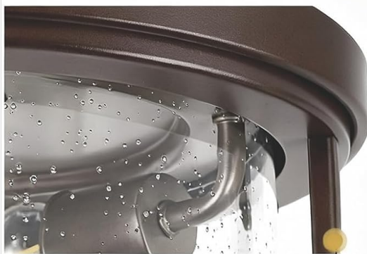
Metal Frame Black Finish