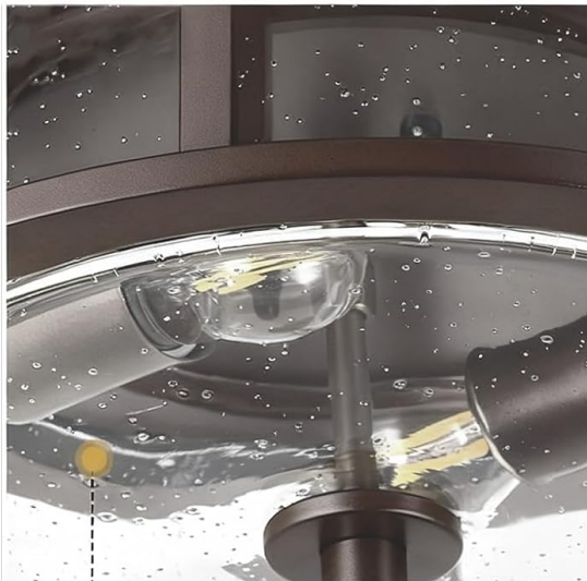
Clear Glass Shade