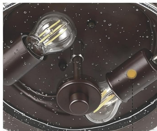
E26 Bulb Base (Bulb Not Included)