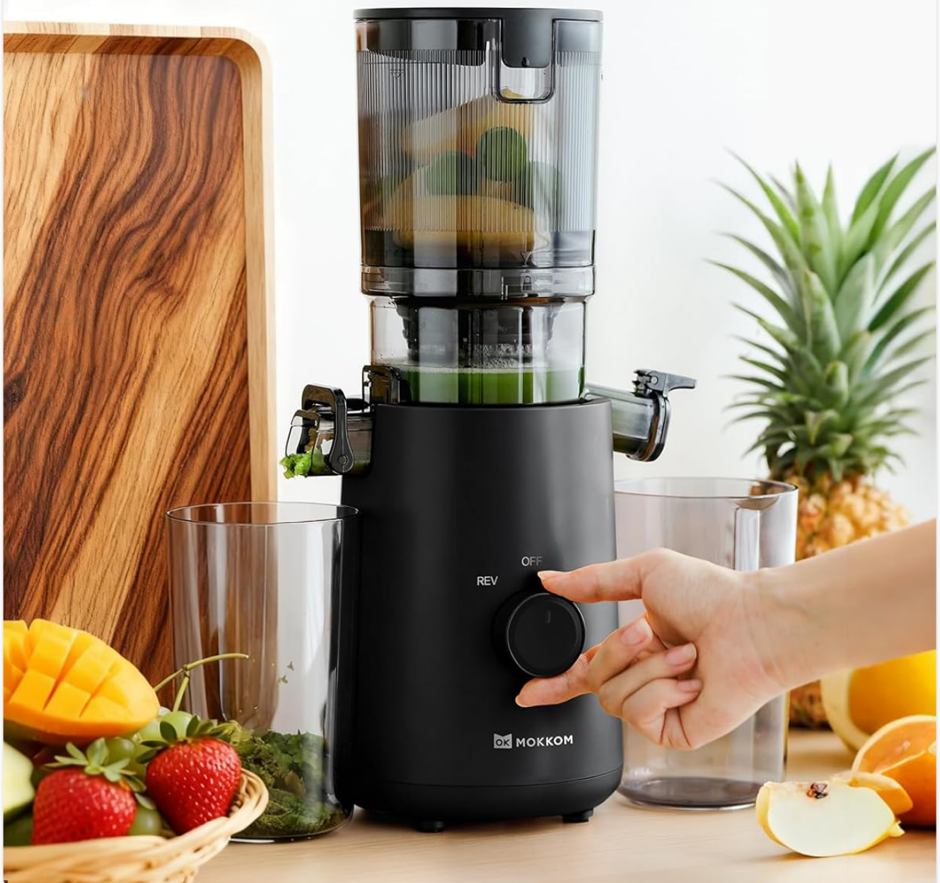
Image: A user demonstrates the simple twist control, highlighting the intuitive "ON" and "REV" settings for easy operation.

One Turn to Juice | Forward & Reverse Modes Easy for Kids & Seniors