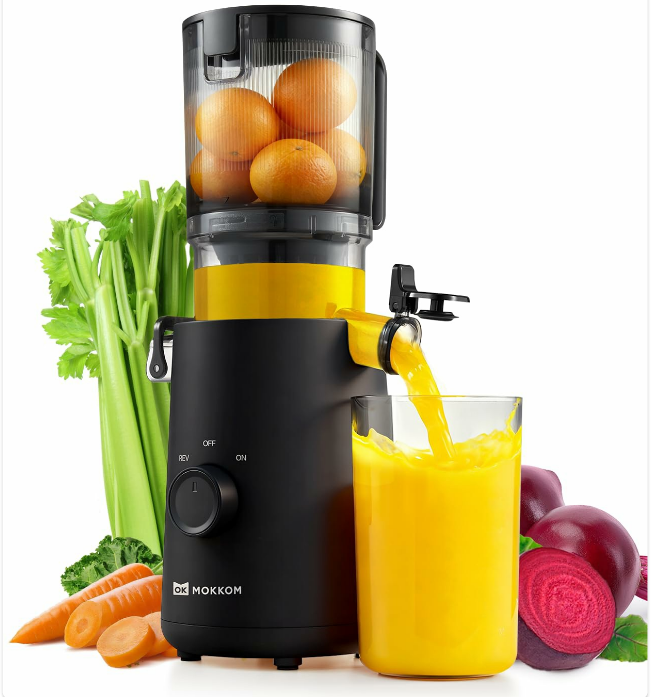
Image: The MOKKOM Cold Press Juicer, showcasing its sleek black design and compact form factor, surrounded by fresh produce.