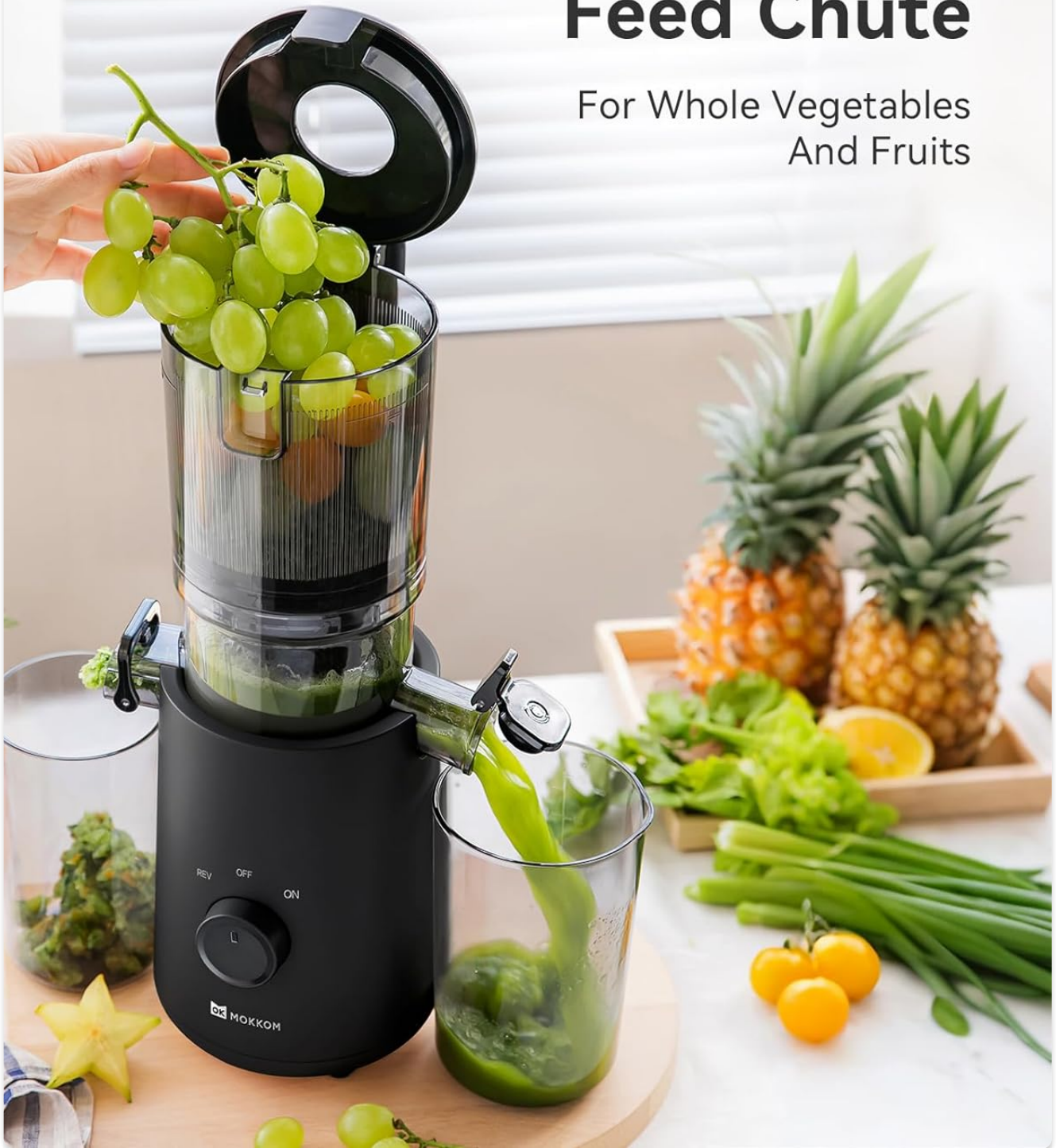
Image: The juicer's large feed chute is shown, demonstrating its capacity to handle whole fruits and vegetables, reducing preparation time.