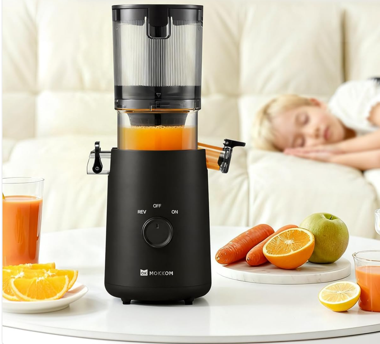
Image: The juicer in operation, highlighting its quiet performance with a sleeping child in the background, emphasizing its brushless AC motor.