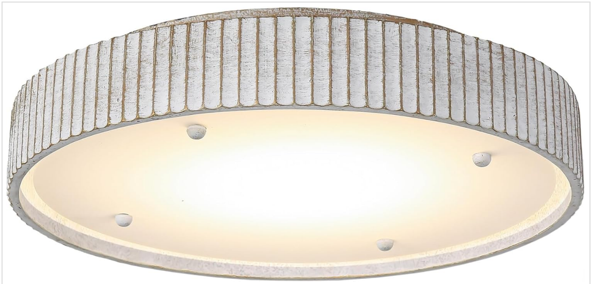
Image: The ceiling light emitting a neutral white glow, ideal for general tasks (4500K).