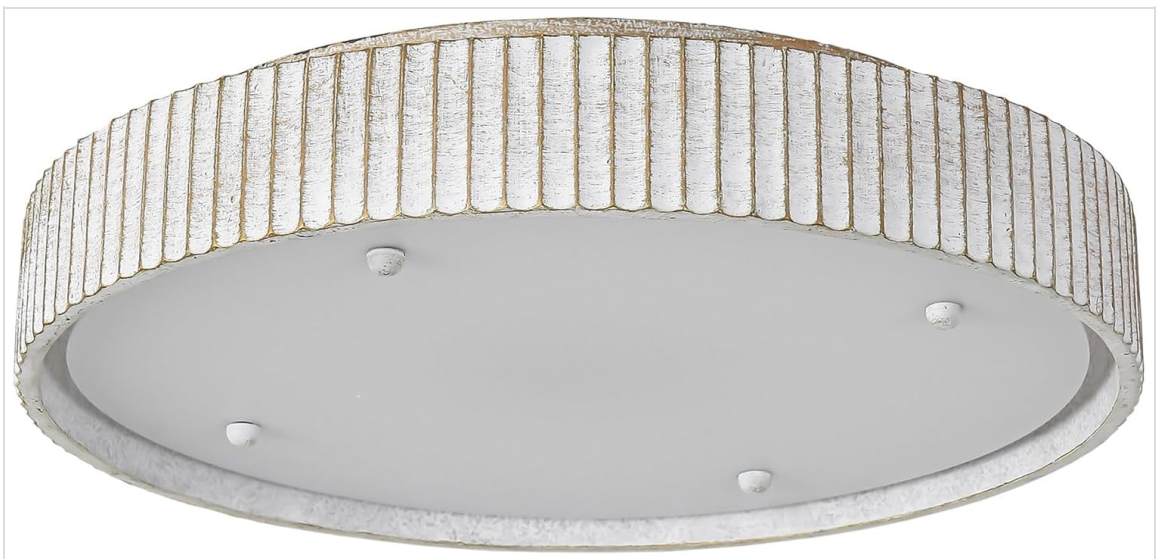
Image: The underside of the light fixture, showing the mounting points and the central LED panel. This image helps visualize where the mounting bracket would attach.