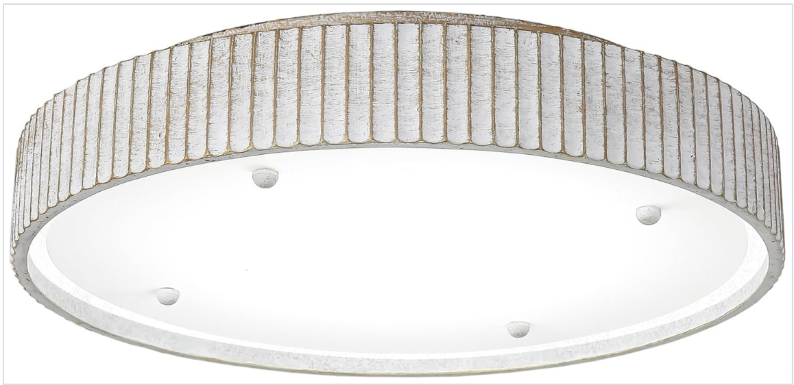
Image: The ceiling light emitting a cool white glow, suitable for bright task lighting (6000K).