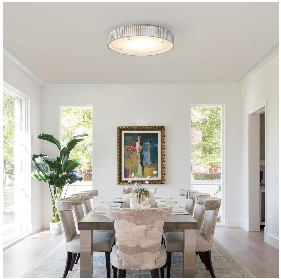
Image: The Parrot Uncle flush mount ceiling light installed in a dining room, demonstrating its appearance when mounted.