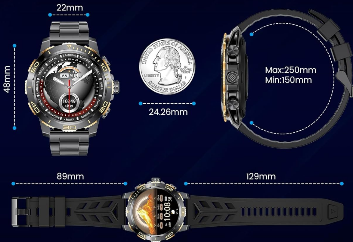
Image: Technical drawing of the smartwatch showing its dimensions and strap measurements.