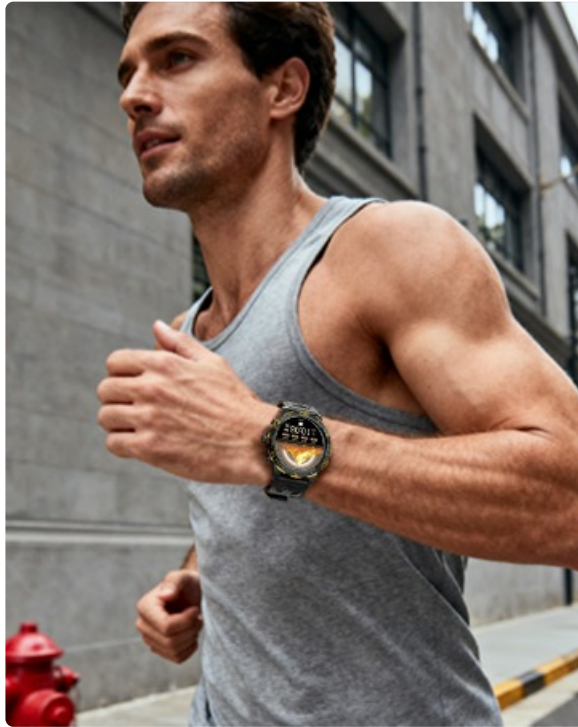
Image: The smartwatch's 1.43-inch AMOLED display showcasing a vibrant watch face.