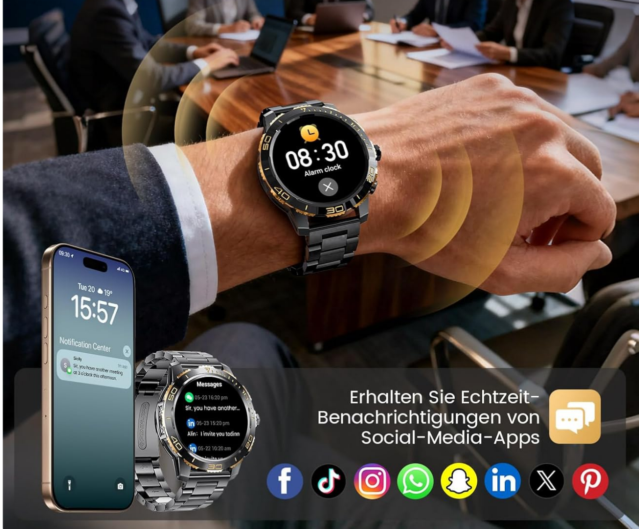
Image: The smartwatch screen showing various app notifications, including messages and social media alerts.

Verpassen Sie während wichtiger Momente nie eine cruciale Nachricht oder Meeting-Erinnerung. Ein kurzer Blick genügt.