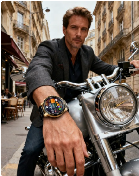
Image: The smartwatch displaying a notification during a meeting, highlighting its discreet communication features.