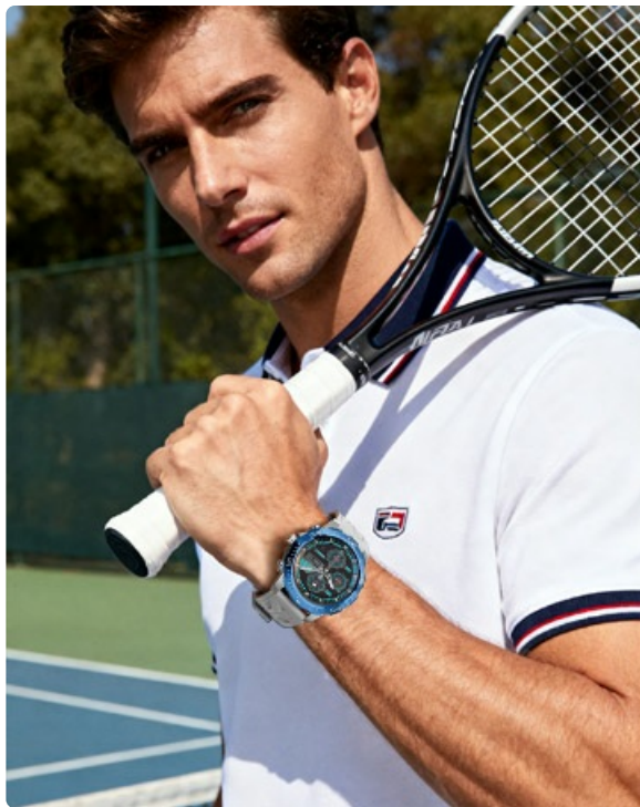
Image: The smartwatch showing a selection of sports modes and real-time activity tracking data.