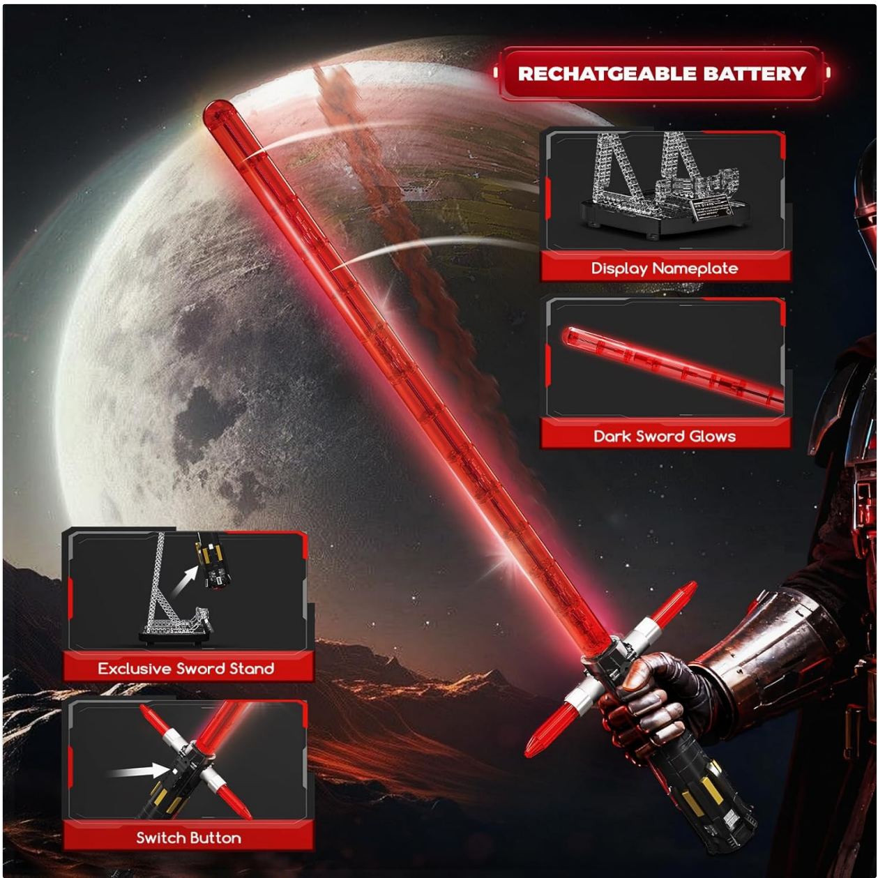
Image: The fully assembled lightsaber, highlighting key features like the rechargeable battery compartment, display nameplate, glowing blade, stand, and activation switch.