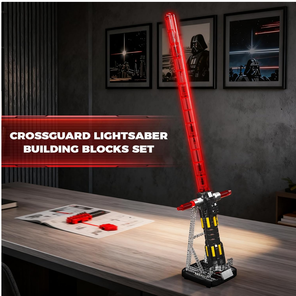
Image: The assembled lightsaber positioned on its exclusive display stand.