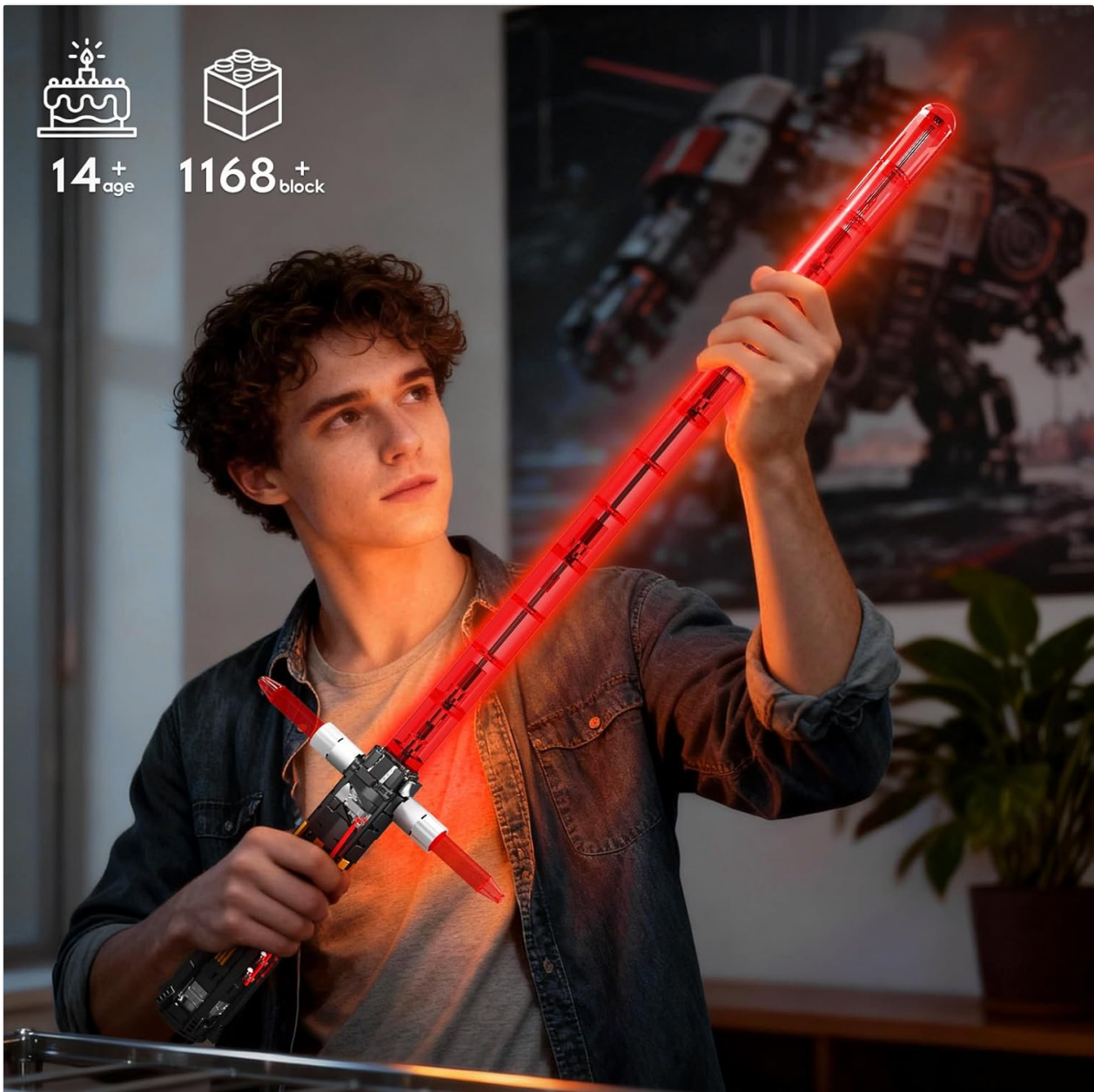
Image: A user demonstrating the illuminated lightsaber.