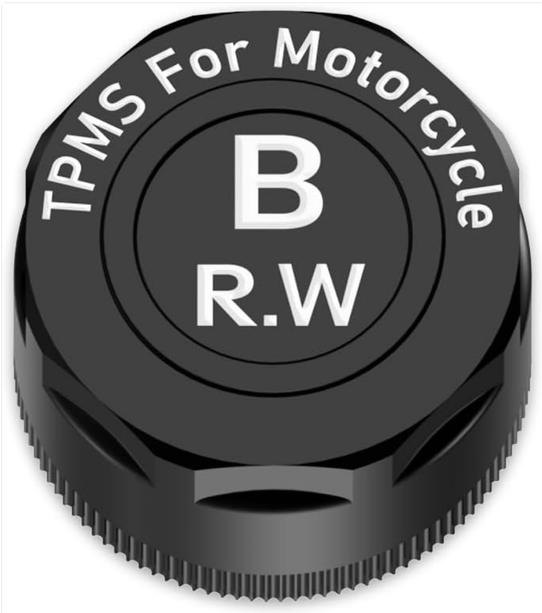
Image: Rear TPMS sensor, labeled 'B R.W', designed for motorcycle tires.