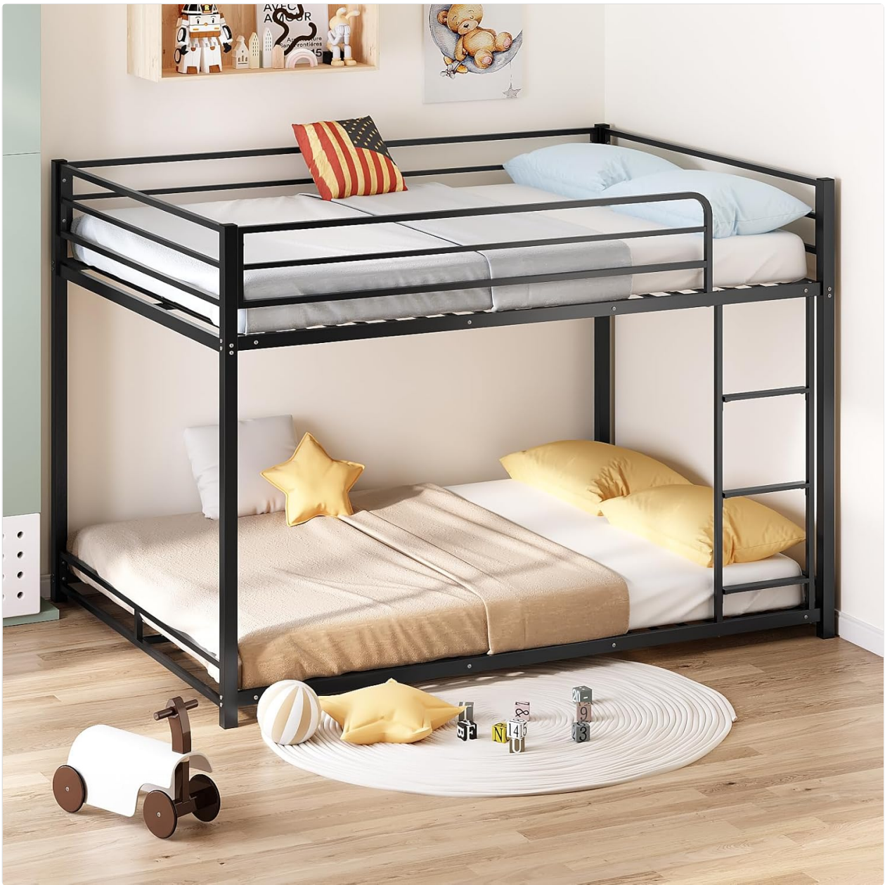
Figure 2: Assembled JOYMOR Metal Full Over Full Bunk Bed.