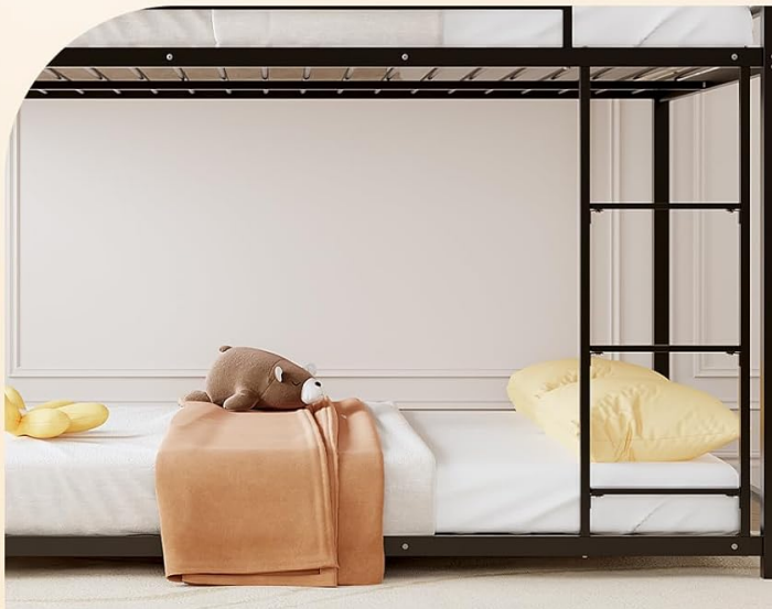
Figure 1: Product certified to ASTM F1427-21 safety standards.