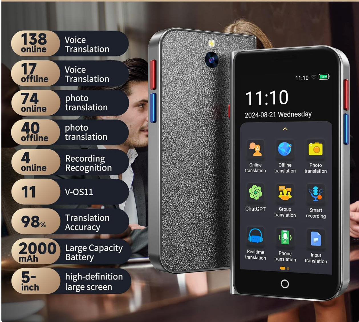
Image: The ACODO A70 translator displaying its main interface with icons for online, offline, and photo translation, ChatGPT, group translation, smart recording, real-time translation, phone translation, and input translation. Text highlights features like 138 online voice languages, 17 offline voice languages, 74 online photo languages, 40 offline photo languages, 4 online recording recognition languages, 11 V-OS11, 98% translation accuracy, 2000mAh battery, and 5-inch high-definition large screen.