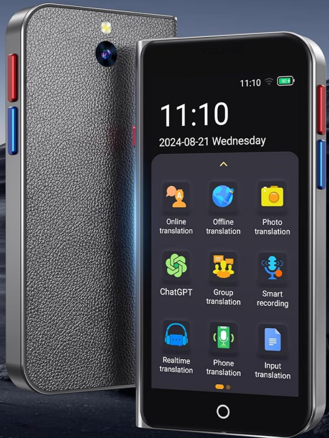
Image: The ACODO A70 translator with text indicating a 2000mAh battery, 8 hours of continuous translation, 7 days of standby, and 90 minutes for a full charge.