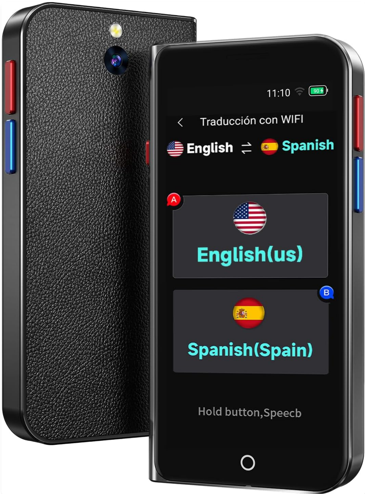
Image: Front and back view of the ACODO A70 Language Translator Device, showing the screen, camera, and side buttons.

Familiarize yourself with the physical components of your ACODO A70 translator.