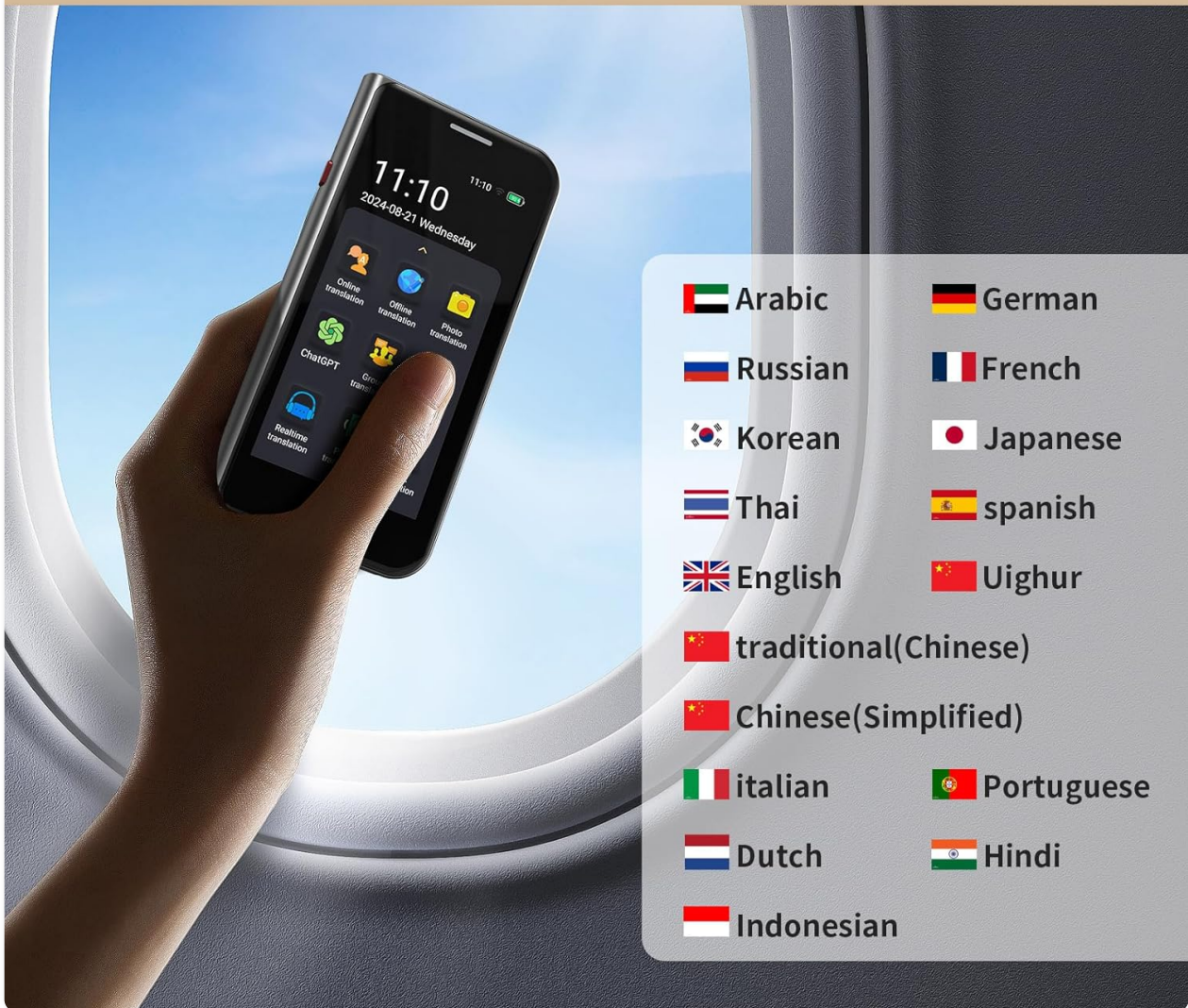
Image: The ACODO A70 translator screen displaying the offline voice translation interface, listing 17 supported languages including Arabic, German, Russian, French, Korean, Japanese, Thai, Spanish, English, Uighur, Traditional Chinese, Simplified Chinese, Italian, Portuguese, Dutch, Hindi, and Indonesian.