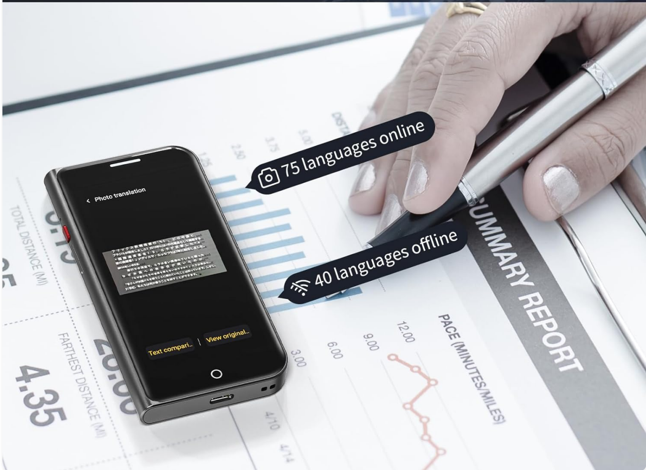
Image: A hand holding the ACODO A70 translator over a document, demonstrating the photo translation feature. The screen shows the original text and its translation, indicating support for 75 online and 40 offline languages.

Build-in 5-megapixel auto zoom camera. Support online 75 languages and offline 40 languages. Can be used without network