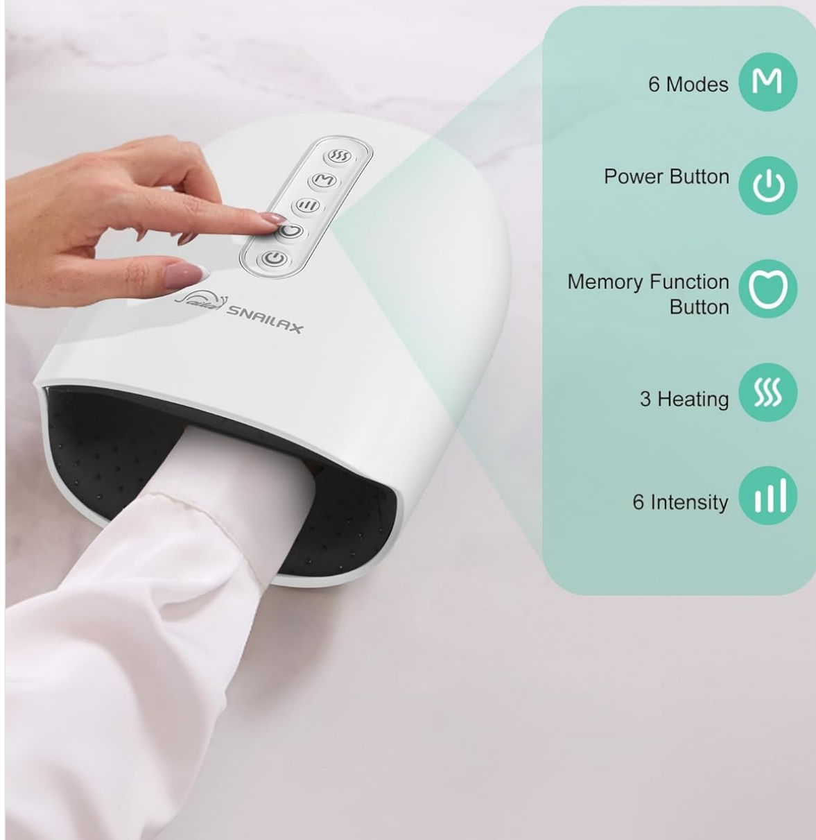
Figure 1: Control Panel and Hand Insertion Area. The device features buttons for heat, mode, intensity, memory, and power, clearly labeled for easy operation.