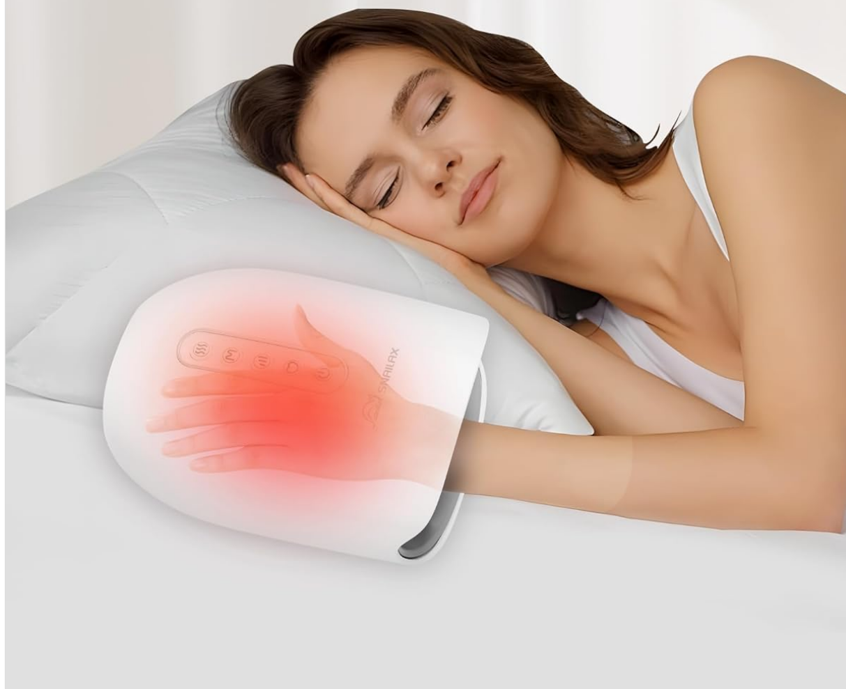
Figure 4: Soothing Heat Function. The image depicts the massager's ability to provide warmth to the hand, promoting relaxation and circulation.

Provides a rapid heat that helps promote circulation and keeps your hands warm