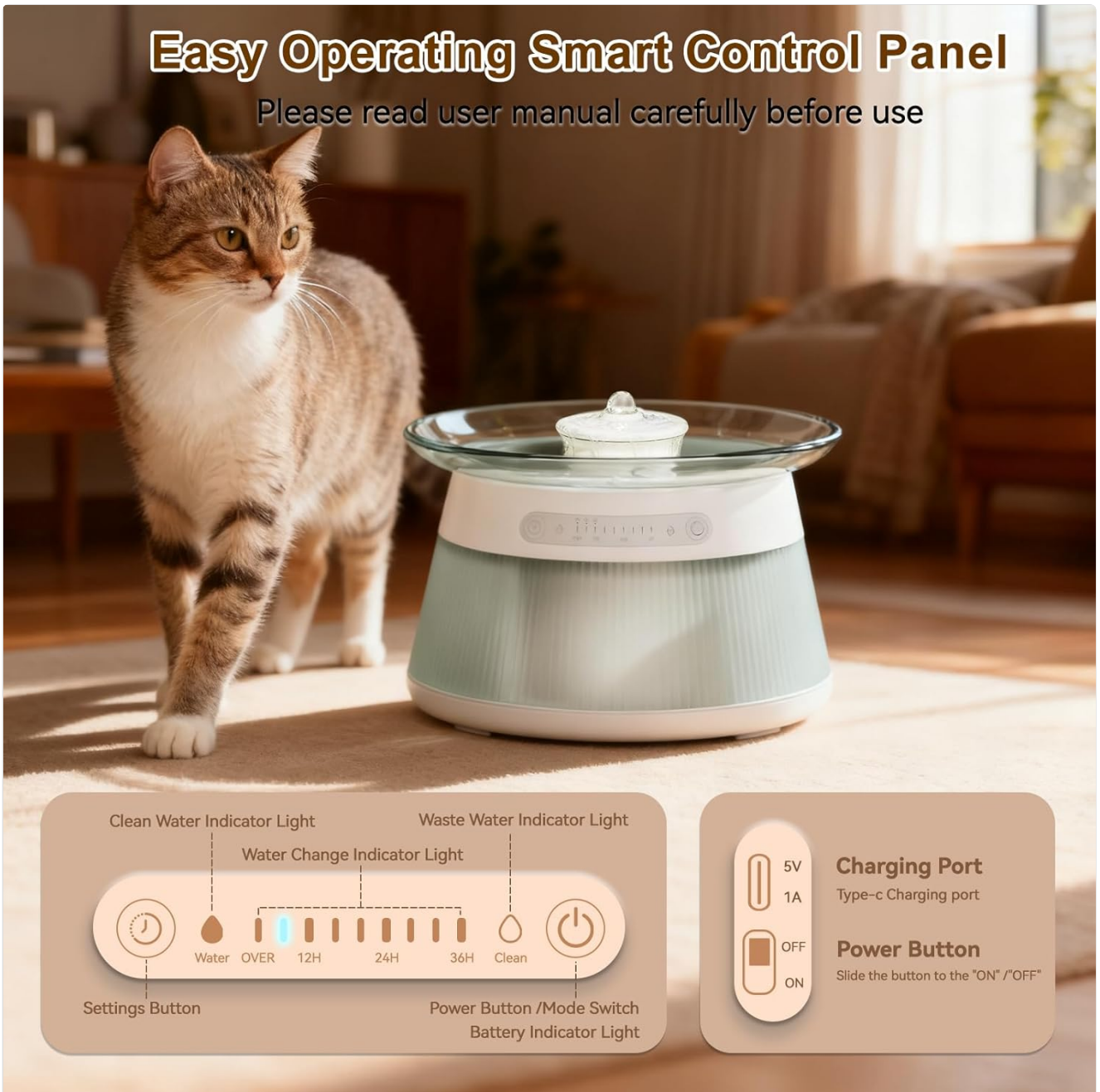
Image: Detailed view of the control panel, showing the Settings Button, Water OVER indicator, 12H/24H/36H indicators, Clean Water Indicator Light, Waste Water Indicator Light, Water Change Indicator Light, Power Button/Mode Switch, Battery Indicator Light, and the Type-C Charging Port.

Please read user manual carefully before use