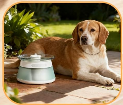
Image: The GOYJOY fountain shown in a kitchen, living room, and garden setting, emphasizing its portability due to the 60-day battery life from its 4000mAh Li-Polymer battery.