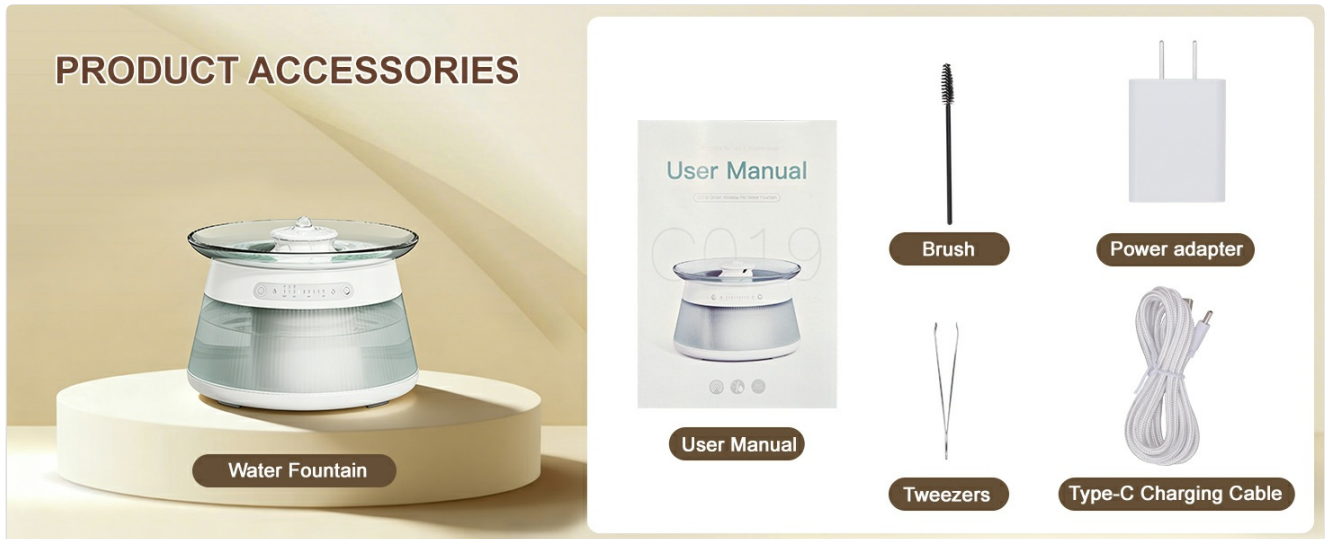
Image: Contents of the GOYJOY Smart Glass Cat Water Fountain package, showing the main unit, user manual, cleaning brush, power adapter, tweezers, and Type-C charging cable.