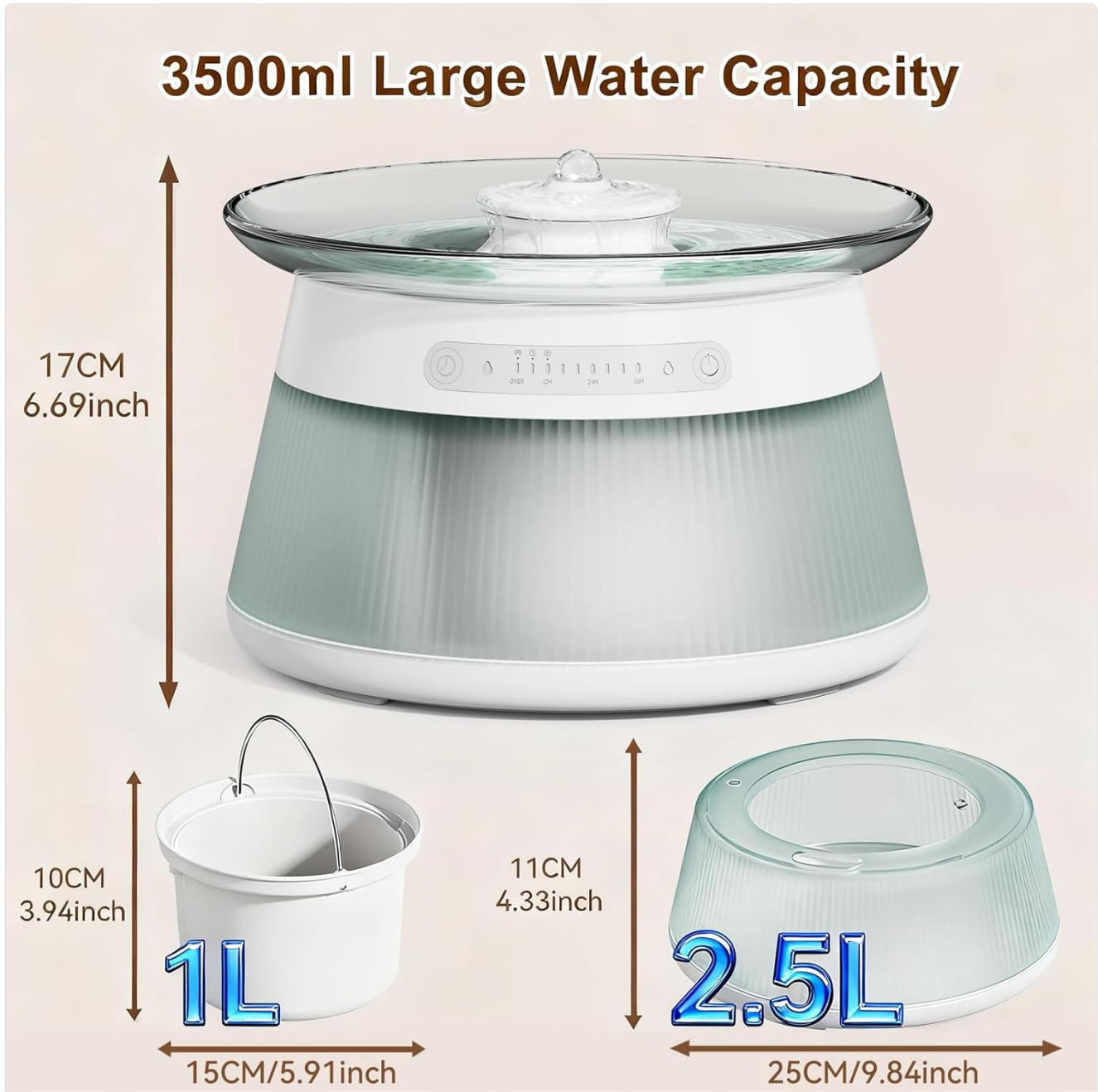
Image: Detailed dimensions of the GOYJOY Smart Glass Cat Water Fountain, including its overall height (17cm/6.69inch), 1L sewage tank, and 2.5L clean water tank, totaling 3500ml capacity.