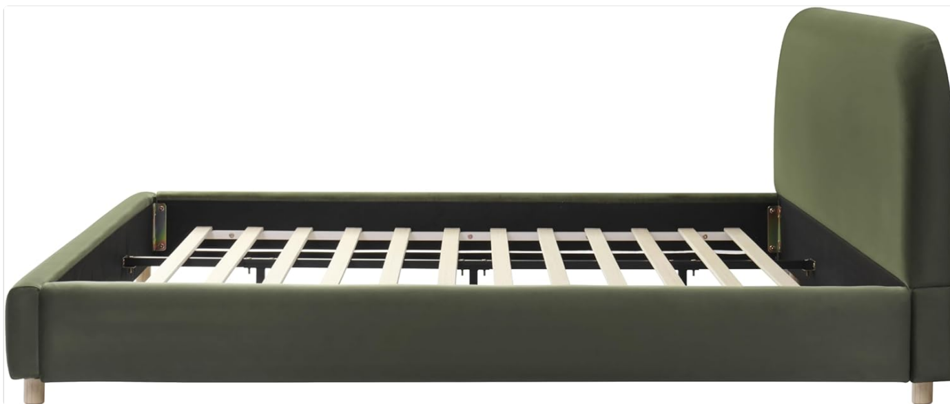
Figure 5: Assembled Bed Frame (Front and Side Views)