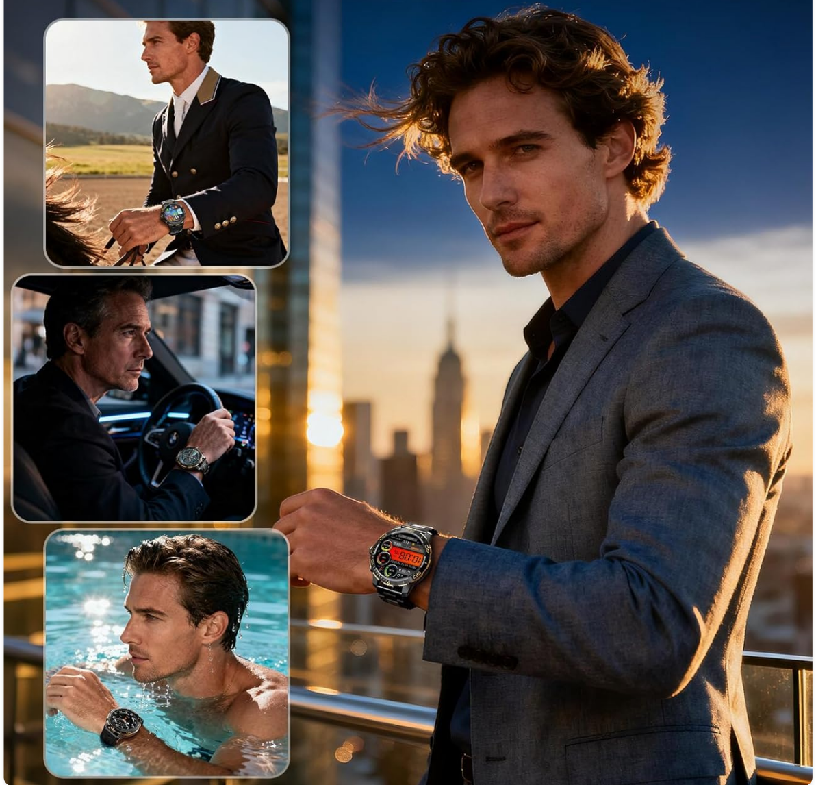
Image 1: LIGE EF21-F Smart Watch with both metal and silicone bands.