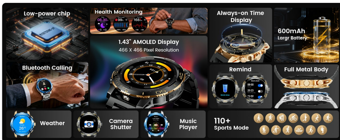
Image 5: A detailed view of the LIGE EF21-F Smart Watch's 1.43-inch AMOLED display, highlighting its high resolution and vibrant colors.

The EF21-F features a 1.43-inch AMOLED high-definition color screen with a resolution of 466x466 pixels. This provides a crisp, detailed display with vibrant colors and clear visibility even under strong sunlight. The ultra-narrow bezel design offers an immersive viewing experience.