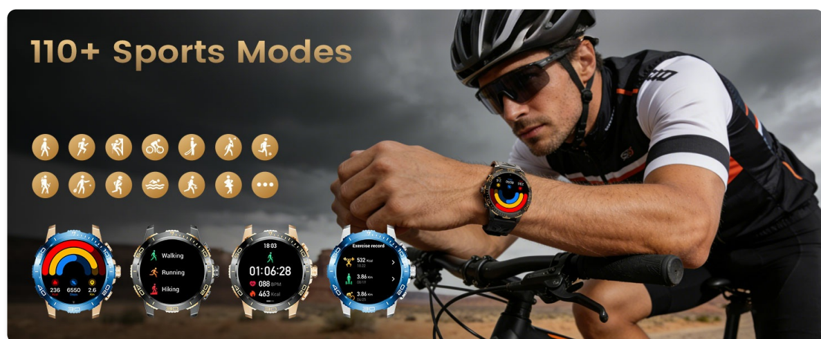
Image 10: A man cycling outdoors with his LIGE EF21-F Smart Watch, showcasing the variety of sports modes available for tracking activities like walking, running, and hiking.