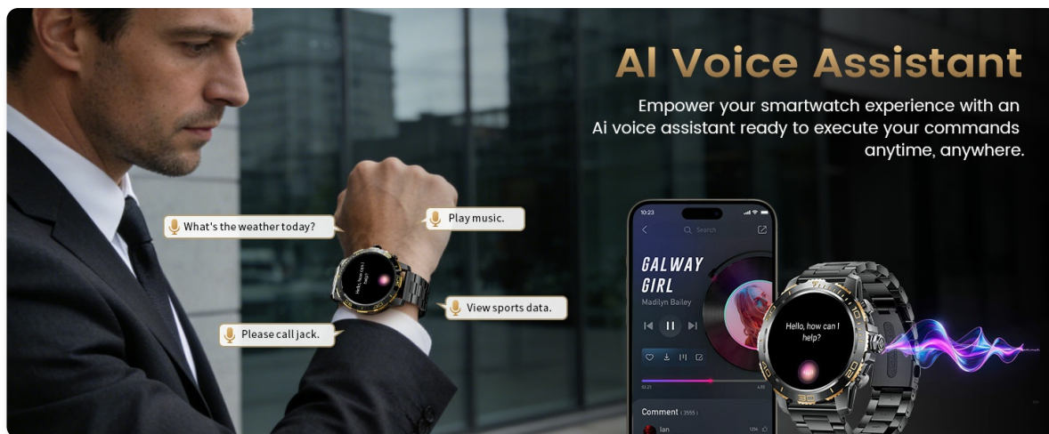
Image 3: A man using the LIGE EF21-F Smart Watch to make a Bluetooth call, illustrating the clear audio quality.