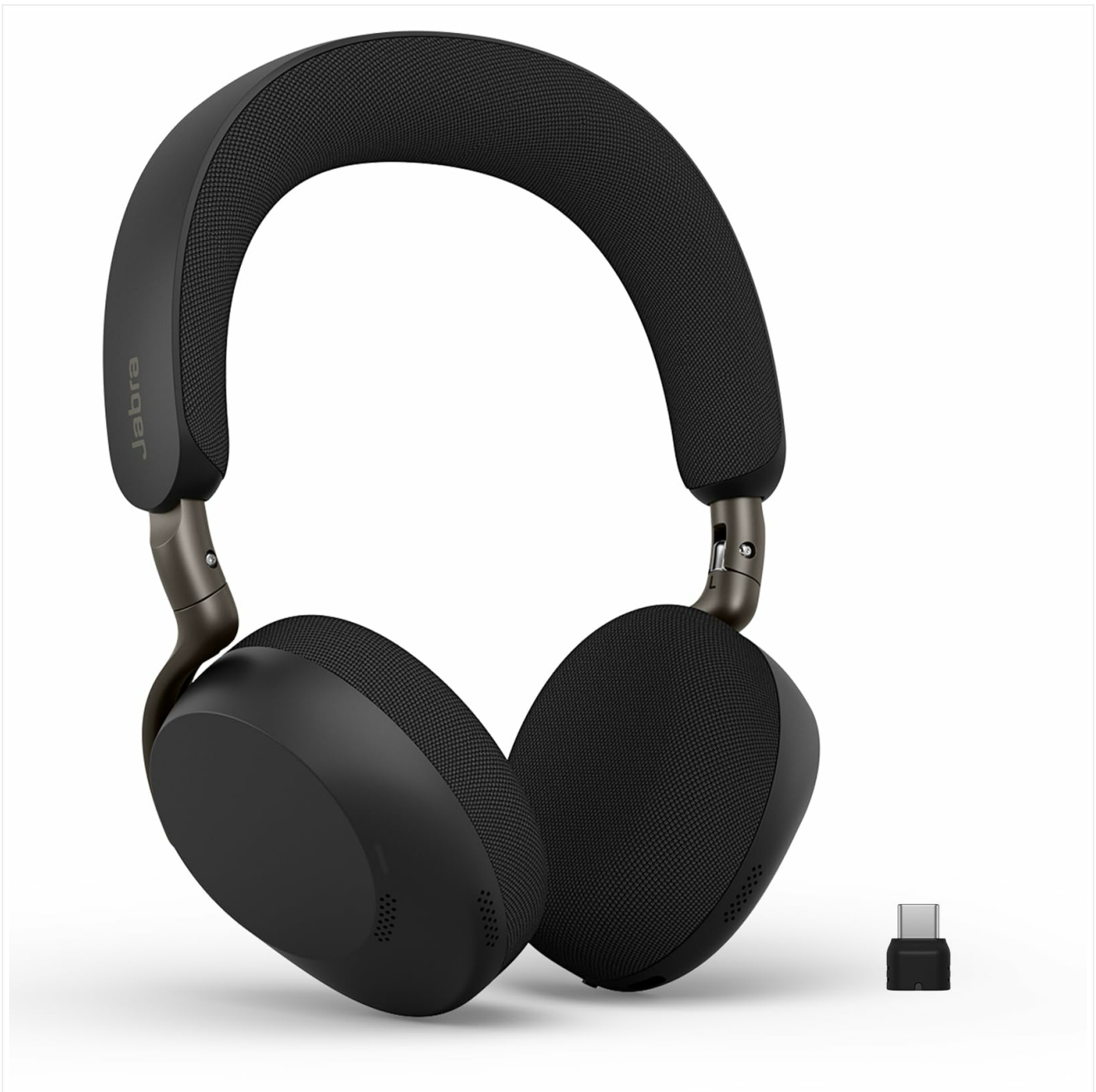
Image: Jabra Evolve3 75 Wireless Headset, showcasing its sleek design.