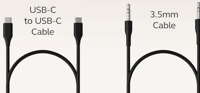
Image: All components included in the Jabra Evolve3 75 package, neatly arranged.