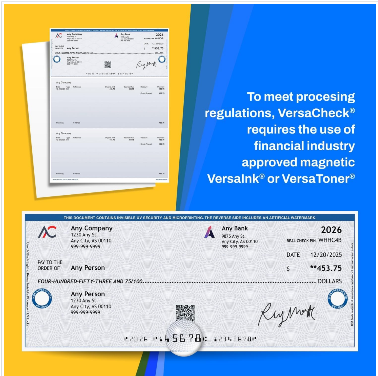
Figure 6.1: This image clearly states that VersaCheck requires the use of financial industry-approved magnetic Versalnk® or VersaToner® to meet processing regulations. This is crucial for ensuring checks are accepted by banks.