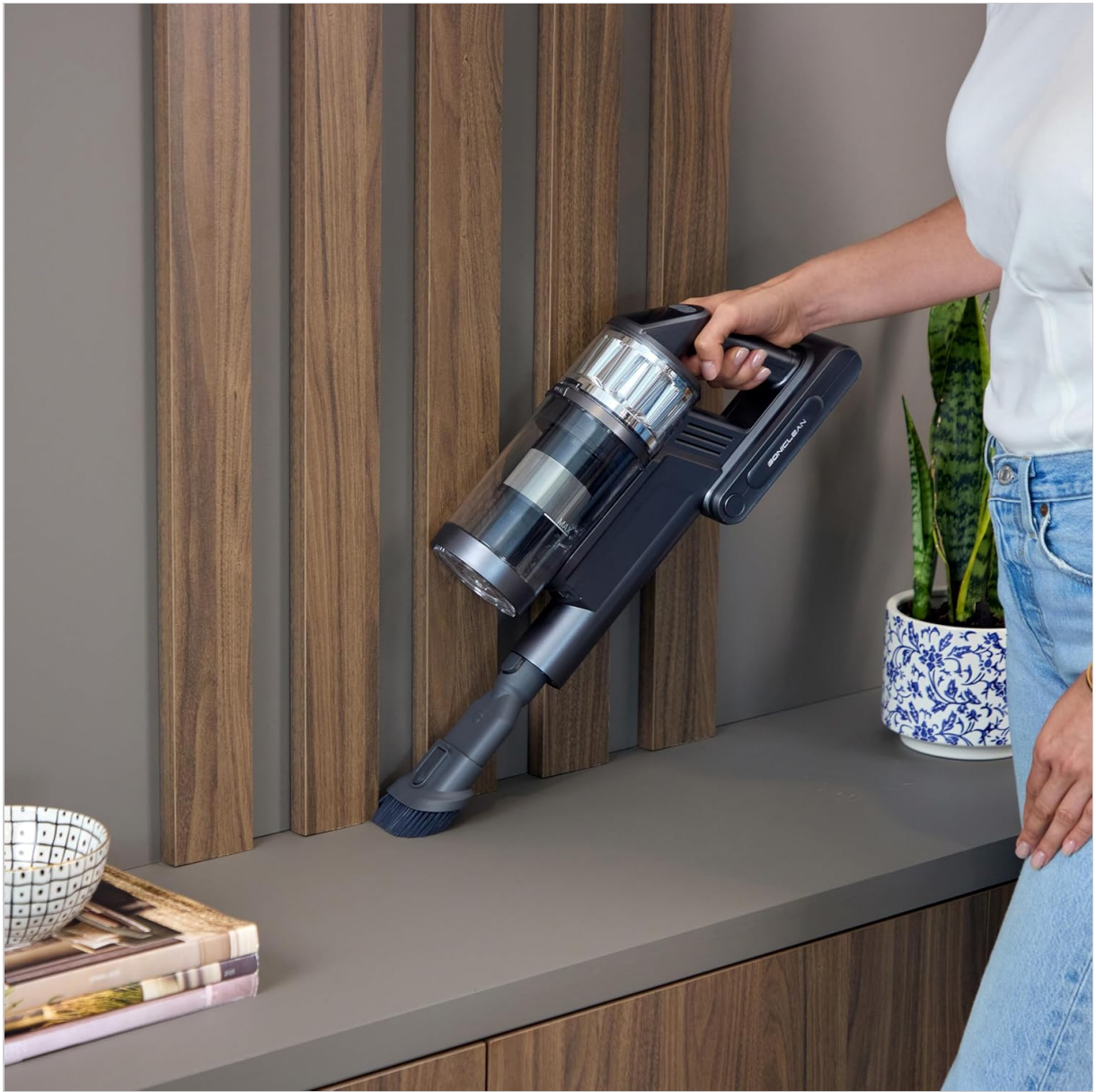
Image: The vacuum in handheld mode, using the dusting brush attachment to clean a shelf.