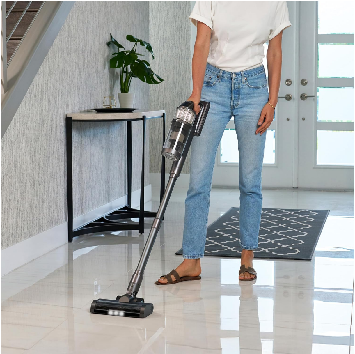
Image: The Soniclean STV-3 Cordless Vacuum Cleaner being used on a hard floor, highlighting its effectiveness on smooth surfaces.