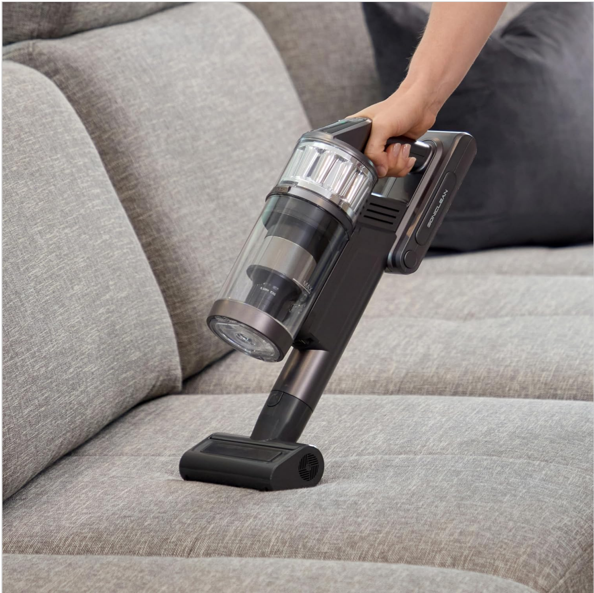
Image: The vacuum in handheld mode, demonstrating the mini motorized powerhead for effective cleaning of upholstery.