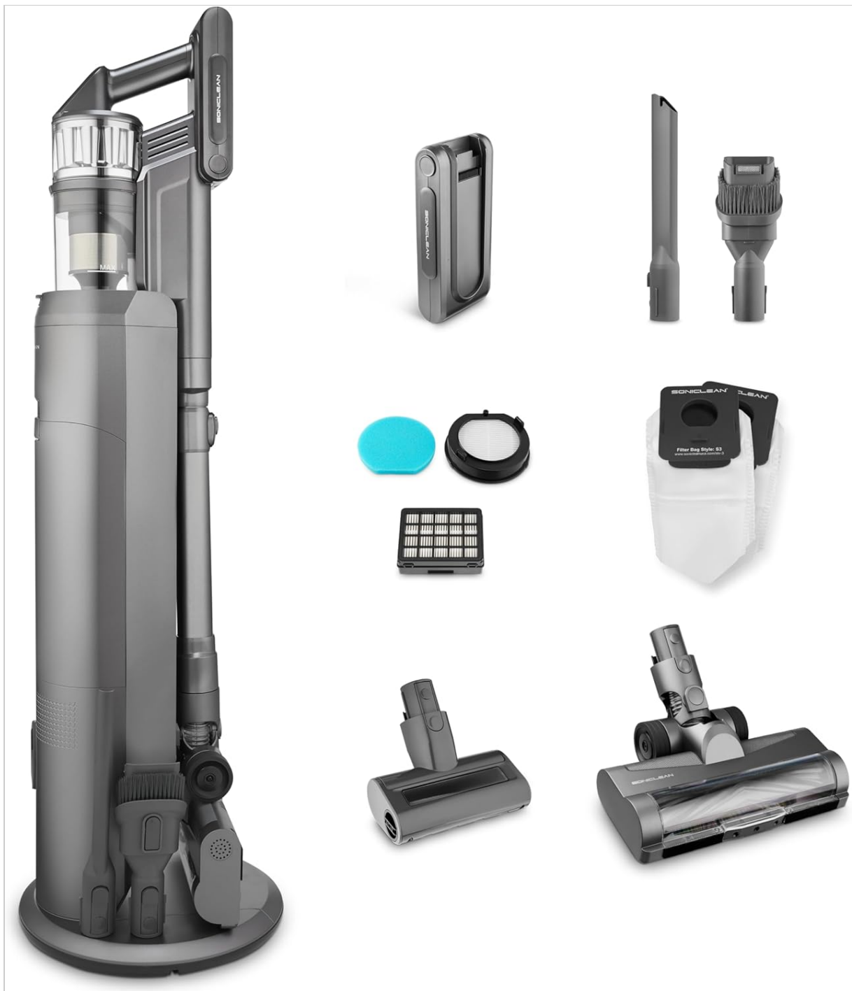
Image: All included components of the Soniclean STV-3 Cordless Vacuum Cleaner and Auto-Empty Base Station.