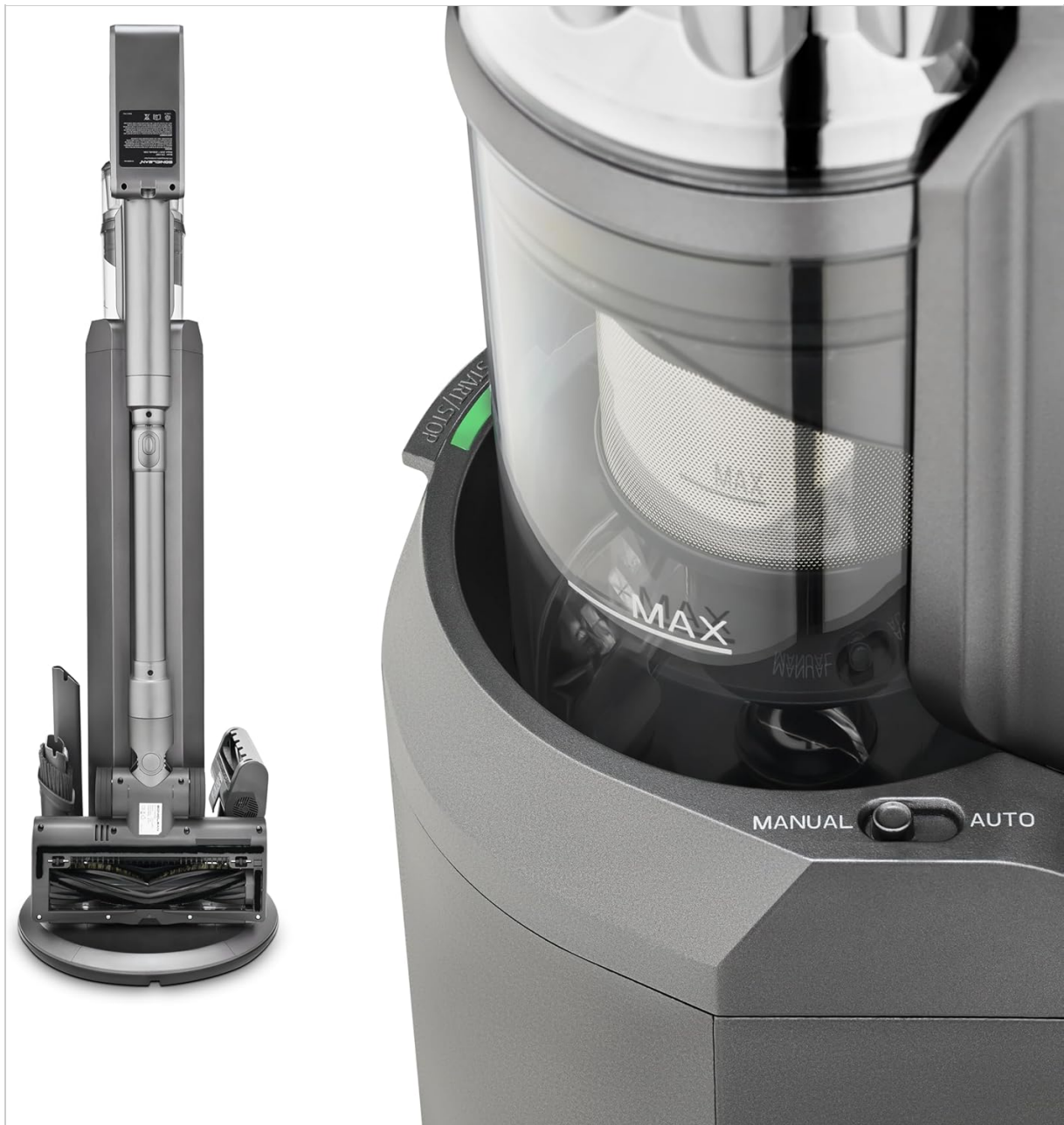
Image: Close-up view of the auto-empty base station, showing the vacuum unit docked for charging and automatic dust disposal.