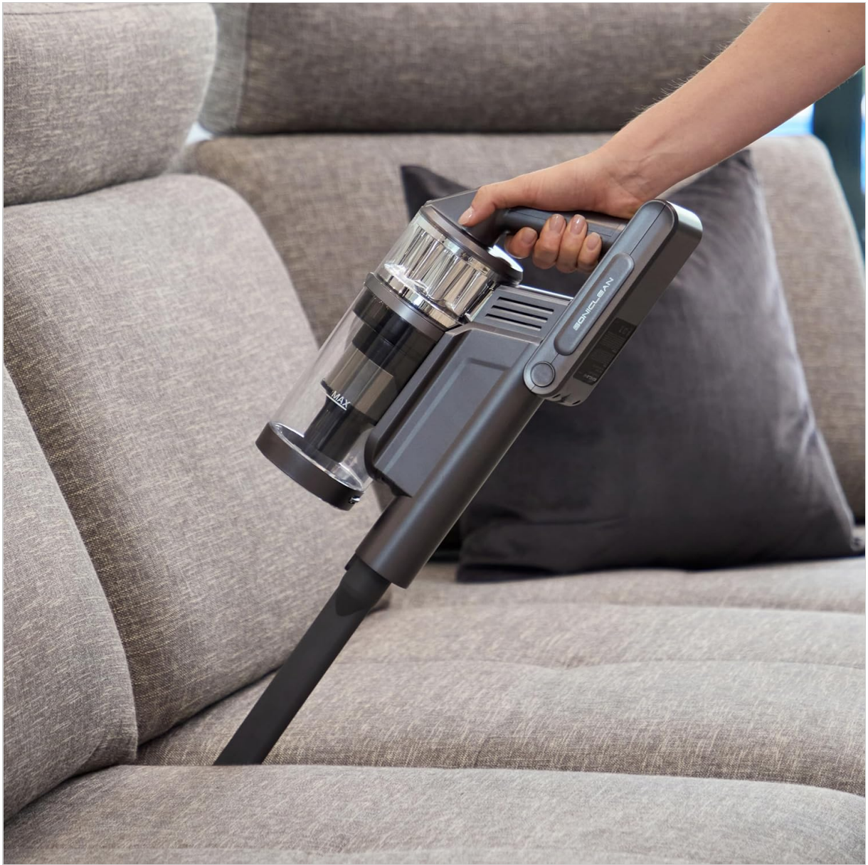
Image: The vacuum in handheld mode, utilizing the crevice tool to clean between sofa cushions.