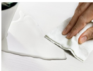
Cleaning the dresser surface with a cloth.