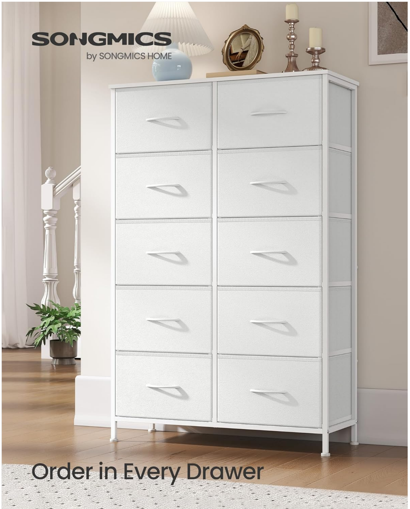
Image: Illustration of the dresser's spacious storage capacity for various clothing items.