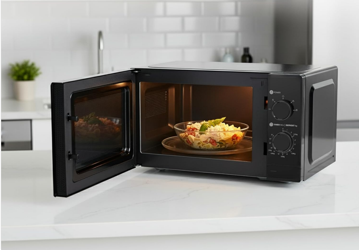
Image 3.1: The interior of the microwave oven showing the glass turntable and oven light, with a bowl of food inside.

Mit fünf Leistungsstufen und einem 35-Minuten-Timer wird das tägliche Kochen mühelos und unkompliziert.