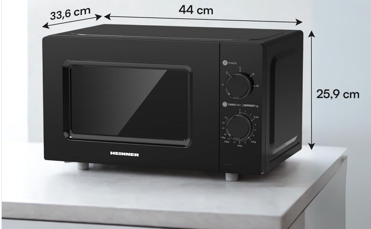
Image 4.1: Diagram illustrating the dimensions of the microwave oven: 44 cm width, 33.6 cm depth, and 25.9 cm height, for proper placement.

Passt mühelos in jede Küche, ohne zusätzlichen Platz zu beanspruchen.