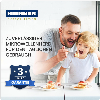
Image 9.1: Official HEINNER 3-Year Warranty badge, signifying reliable after-sales support.

For warranty claims, technical support, or service inquiries, please contact your retailer or the HEINNER customer service department. Please have your model number (HMW-MD20MBK) and proof of purchase ready.