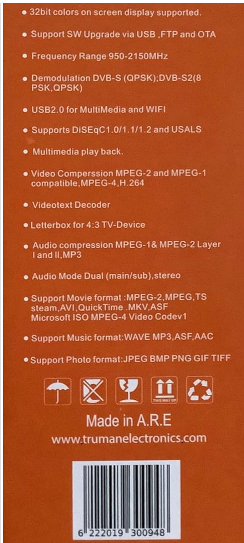
Figure 4.3: The side of the TRUMAN TM-2K receiver's packaging, detailing technical specifications including Full HD 1080p, DVB-S2/MPEG-4/H.264 decoder, 8000 channel memory, 32-bit color support, USB 2.0, DiSEqC support, and various multimedia format compatibilities.