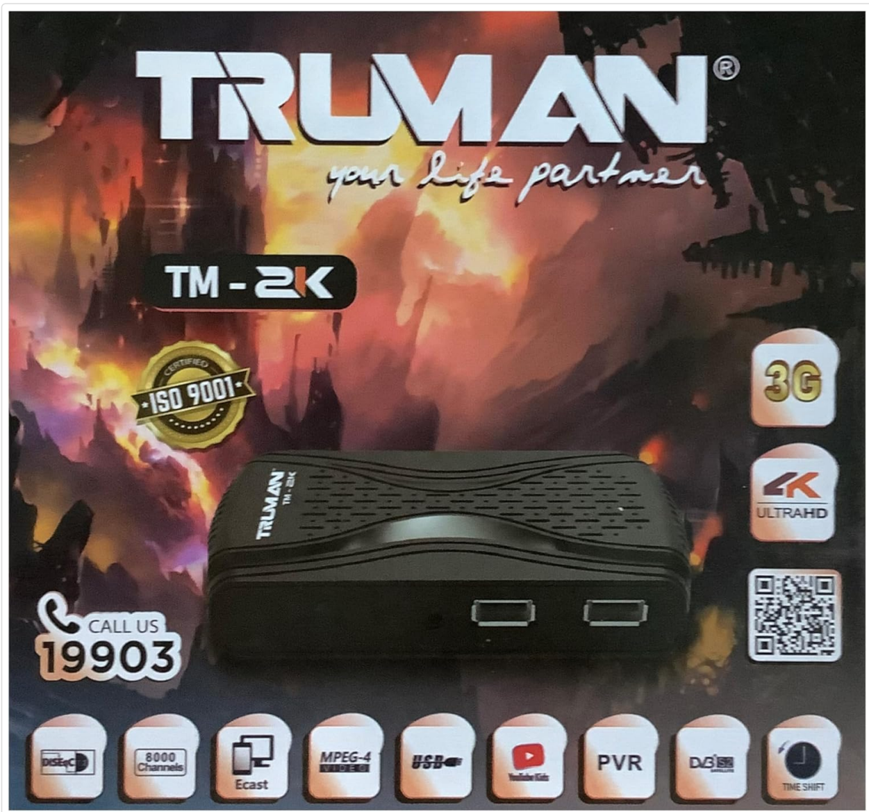
Figure 4.2: The retail packaging for the TRUMAN TM-2K receiver, highlighting key features such as Full HD, 8000 channels, MPEG-4, USB, and PVR capabilities.